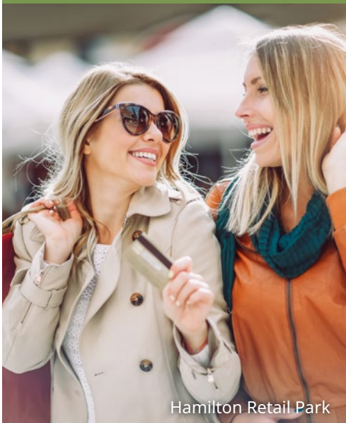
Hamilton Retail Park