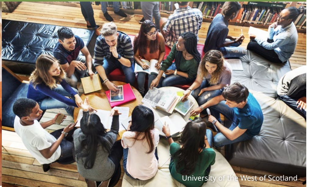
University of the West of Scotland