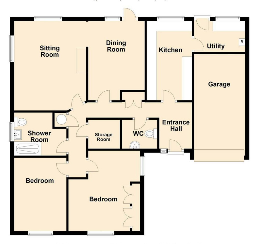
Floor Plan Approx. 86.2 sq. metres (927.7 sq. feet)

Total area: approx. 86.2 sq. metres (927.7 sq. feet)