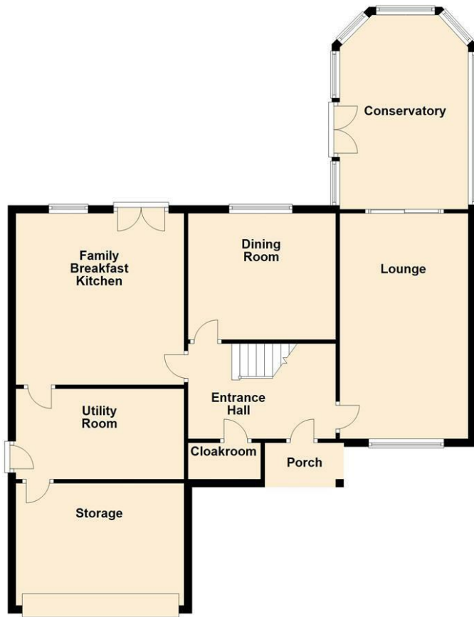
Ground Floor Approx. 90.1 sq. metres (970.2 sq. feet)