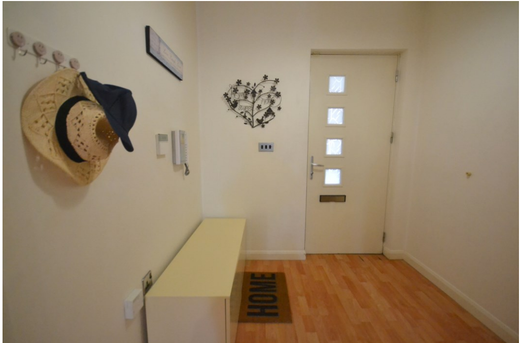
Cloakroom - 1.48m x 1.14m (1.7 sqm) - 4' 10" x 3' 9" (18 sq ft)

The living room has laminate flooring and painted plaster walls. 2 full height double glazed windows overlooking the terrace with roller blinds and curtains. Double glazed door leading to outside decking. Inset spotlights, 3 wall mounted lights, 2 thermostatic radiators. Furniture includes a corner sofa, a chunky distressed wood table, 50" TV unit and Blu-Ray & DVD player on stand. The TV comes with a sound bar for surround sound. Other occasional furniture.