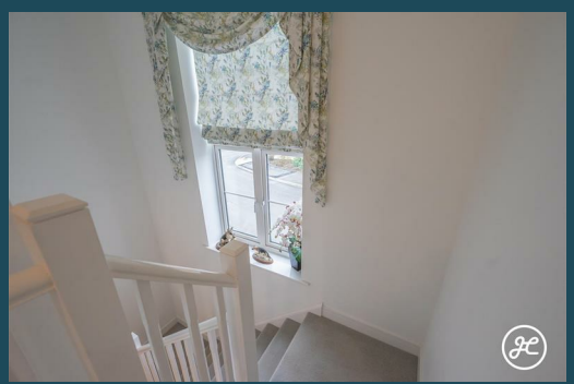
Joseph Casson Estate Agency -Taunton 2 The Crescent Taunton Somerset TA1 4EA

Contact 01823 740051 office@josephcasson.co.uk www.josephcasson.co.uk