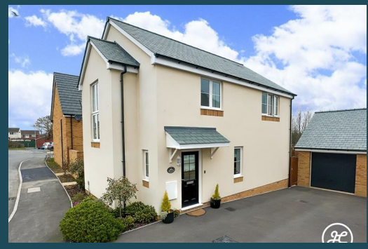
Stamford Road North Petherton TA6 6ZL