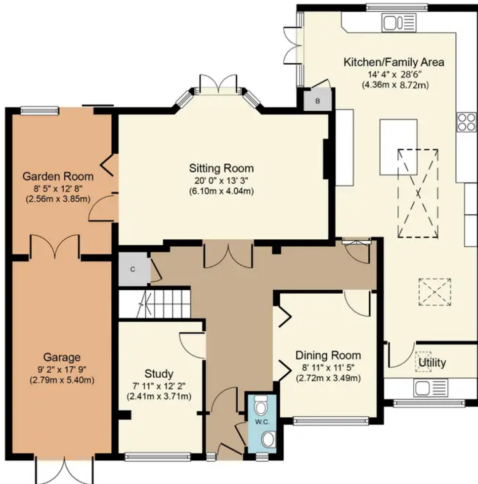
Ground Floor Approximate Floor Area 1,429 sq. ft. (132.7 sq. m.)