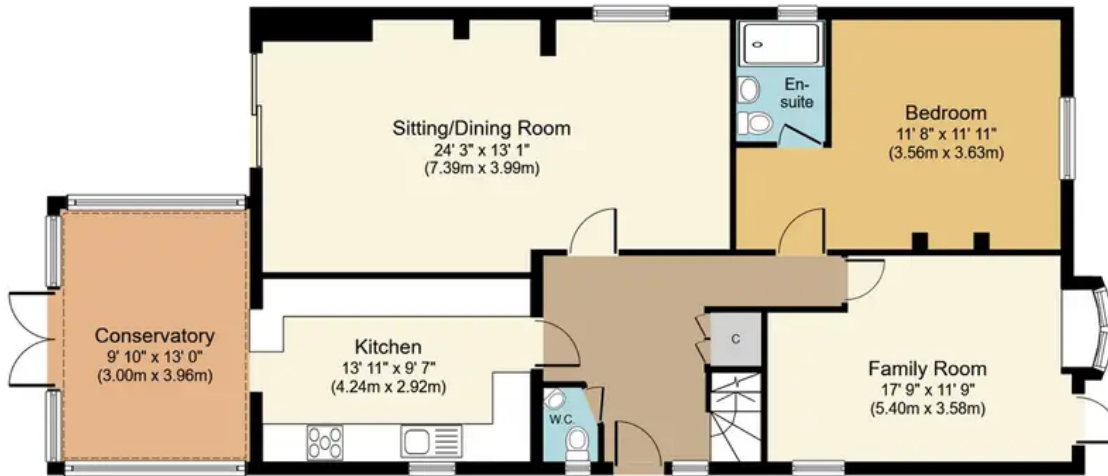
Ground Floor Approximate Floor Area 1122 sq. ft. (104.2 sq. m.)