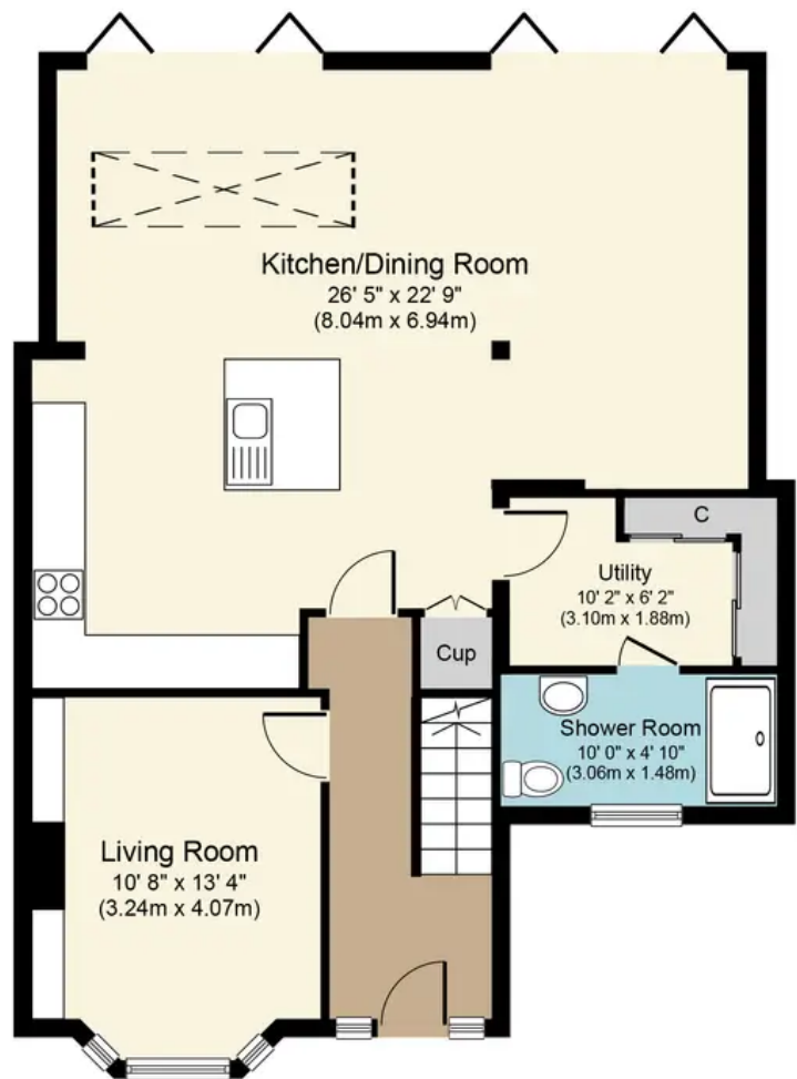
Ground Floor Approximate Floor Area 864 sq. ft. (80.2 sq. m.)