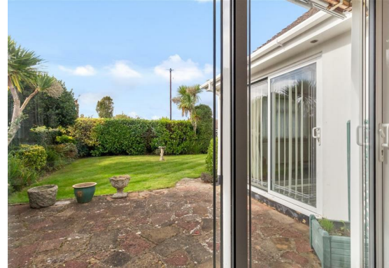
Dining Room With Sliding Door To Front Patio 17'7 x 11'11 (5.36m x 3.63m)