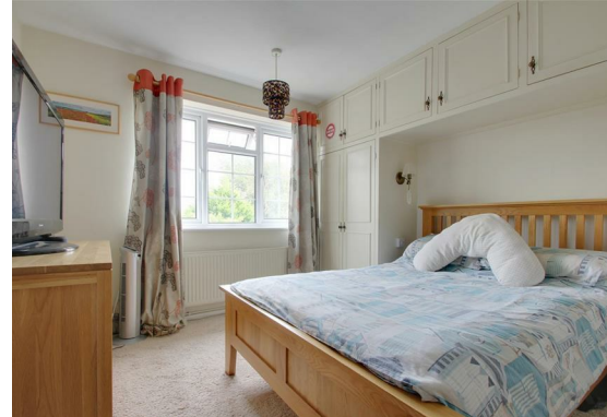
Bedroom One 12'3 10'6 (3.73m 3.20m)