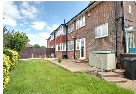
Garden Shed 7'10 x 3'10 (2.39m x 1.17m)