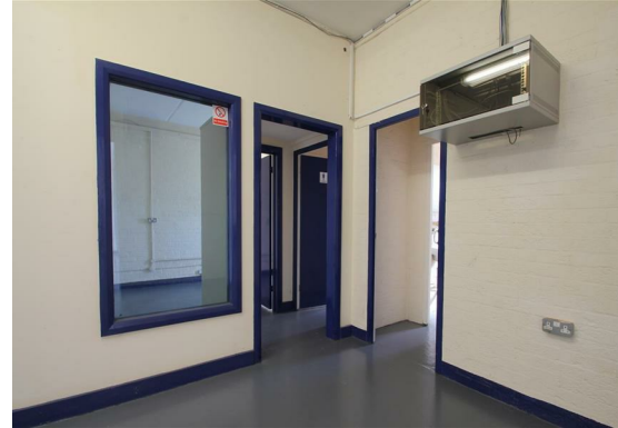
Storage Area 1 11'85 x 13'15 (3.35m x 3.96m)