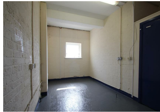
Storage Area 2 /Office 11'76 x 16'62 (3.35m x 4.88m)