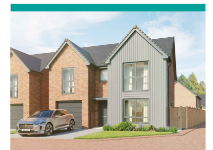
The Trillium 4 bedroom home Plot 264