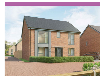
The Aster 4 bedroom home Plot 265