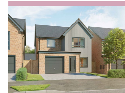
The Begonia 3 bedroom home Plots 249, 254 & 257