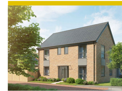
The Angelica 4 bedroom home Plots 77, 192, 233 & 266