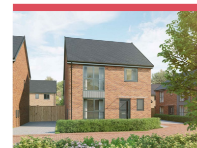
The Ophelia 4 bedroom home Plots 228 & 253