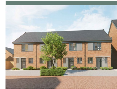
The Sundew 2 bedroom home Plots 247, 248 & 252