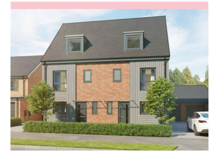
The Armeria 4 bedroom home Plots 78, 79, 80, 81, 229, 230, 231 & 232