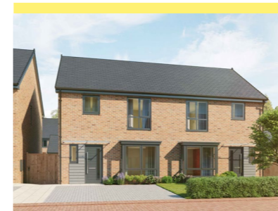
The Orchid 3 bedroom home Plots 242, 243, 244, 245, 246, 255, 256, 258, 259, 260, 261 & 263