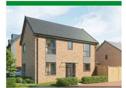
The Daisy 3 bedroom home Plots 241, 250, 251 & 262