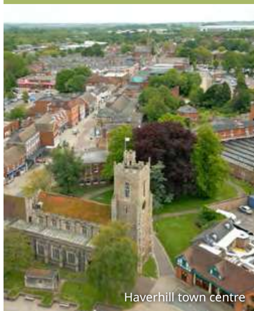
Haverhill town centre