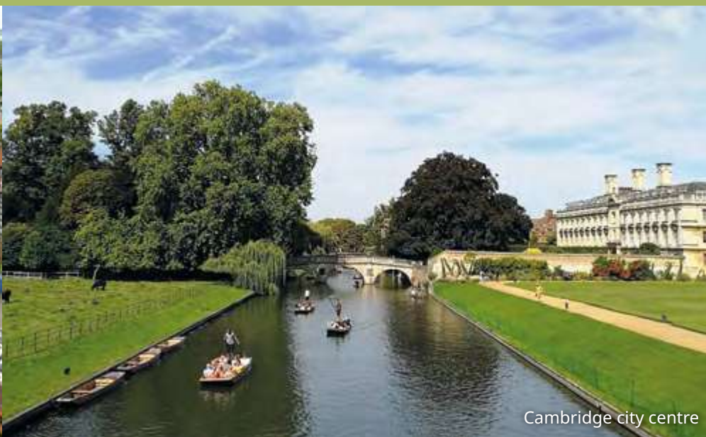
Cambridge city centre