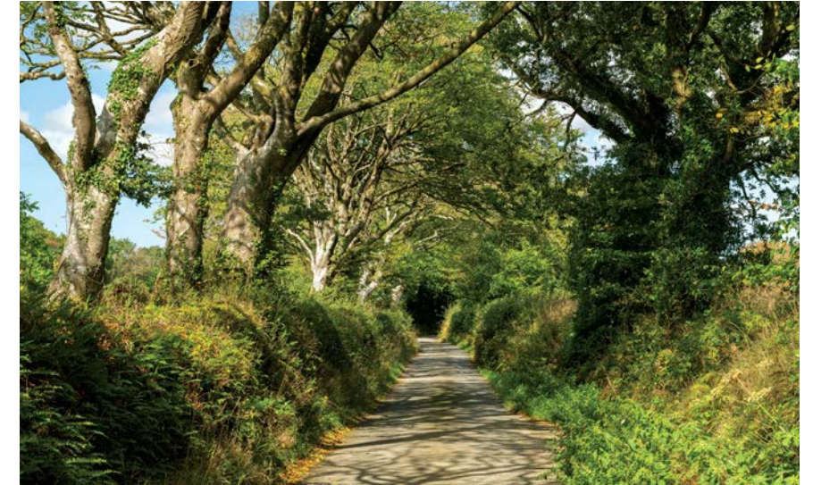
LEFT & ABOVE Grassland at Halwill Junction Nature Reserve Quiet country lane typical of the area

Nearby Dartmoor National Park is a dramatic landscape of granite tors, wooded valleys and rugged open expanses, perfect for adventurous days spent hiking, cycling, kayaking or riding.