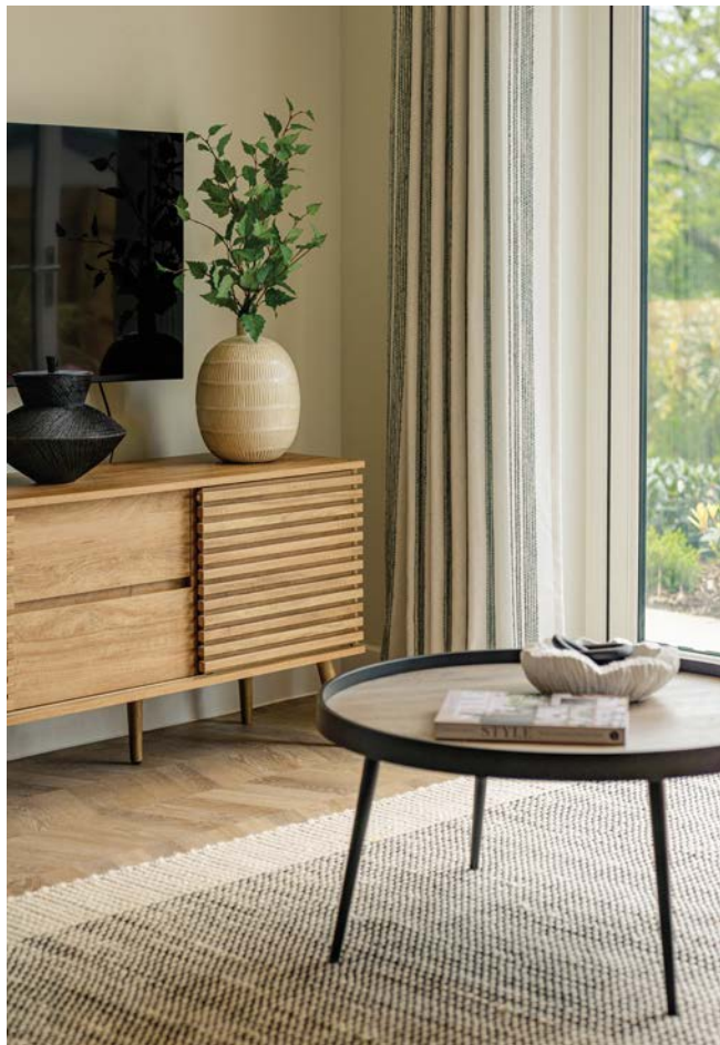
ABOVE & RIGHT Arlington show home interior