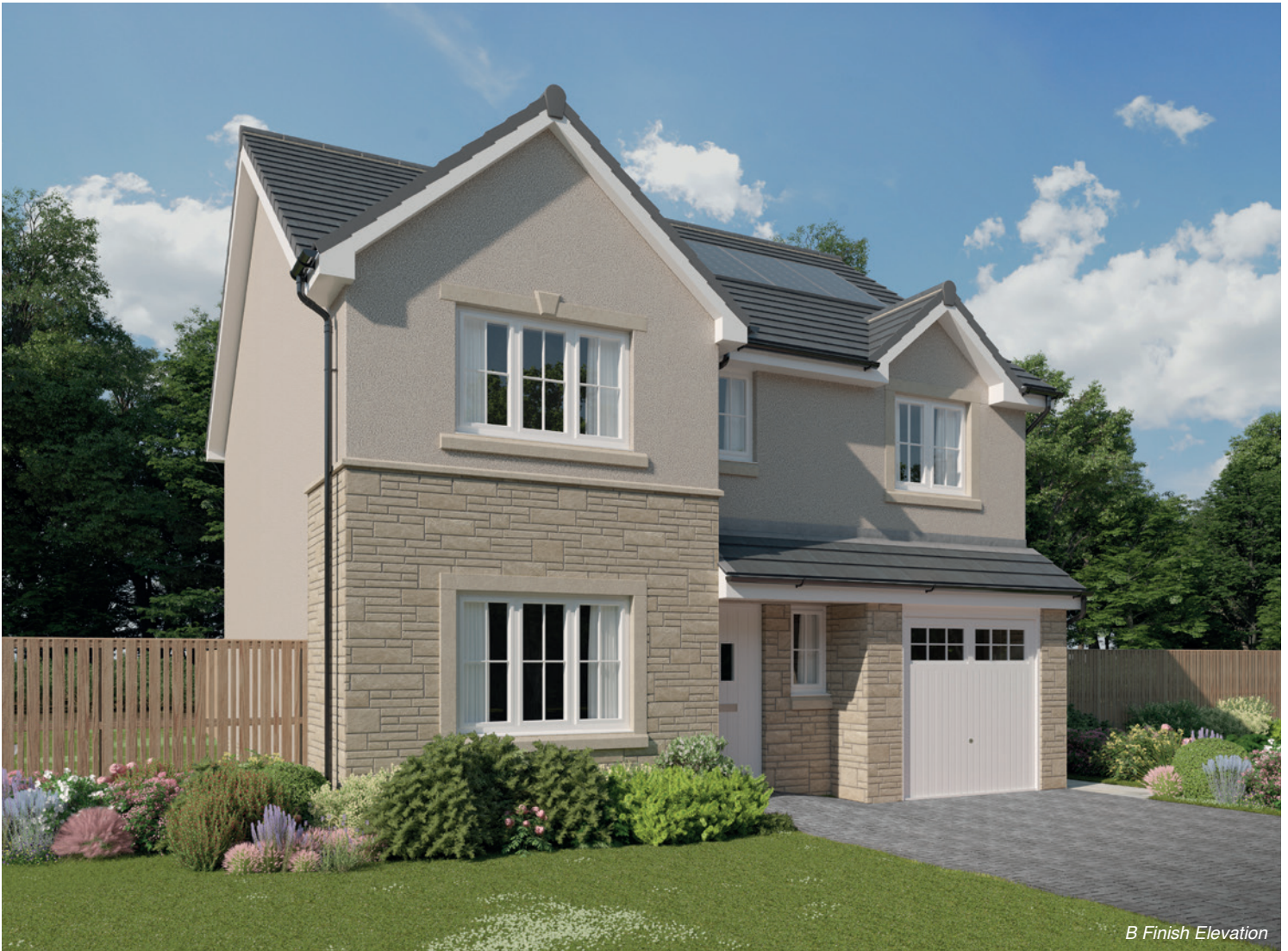
B Finish Elevation

FOUR BEDROOM DETACHED HOME WITH INTEGRAL GARAGE