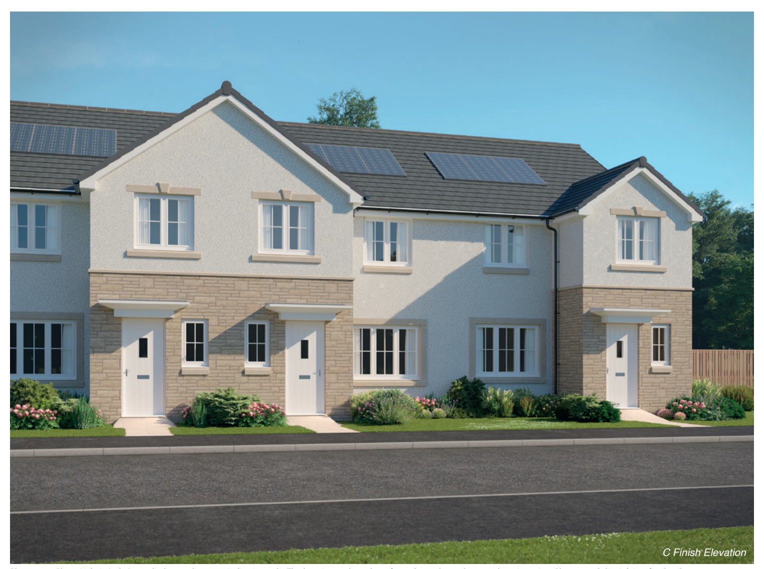
Please note Photo Voltaic (solar) panels shown above are indicative only. The location and number of panels are dependent on plot orientation. Please see Sales Advisor for details.