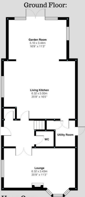
Flint Lane, Barrow Upon Soar Internal Square Footage: Approx 1453 sq.ft