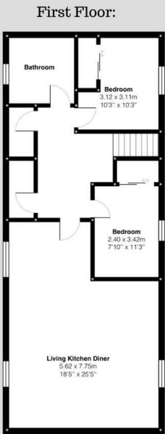
Highland Drive, Loughborough Internal Square Footage: 990 sq.ft