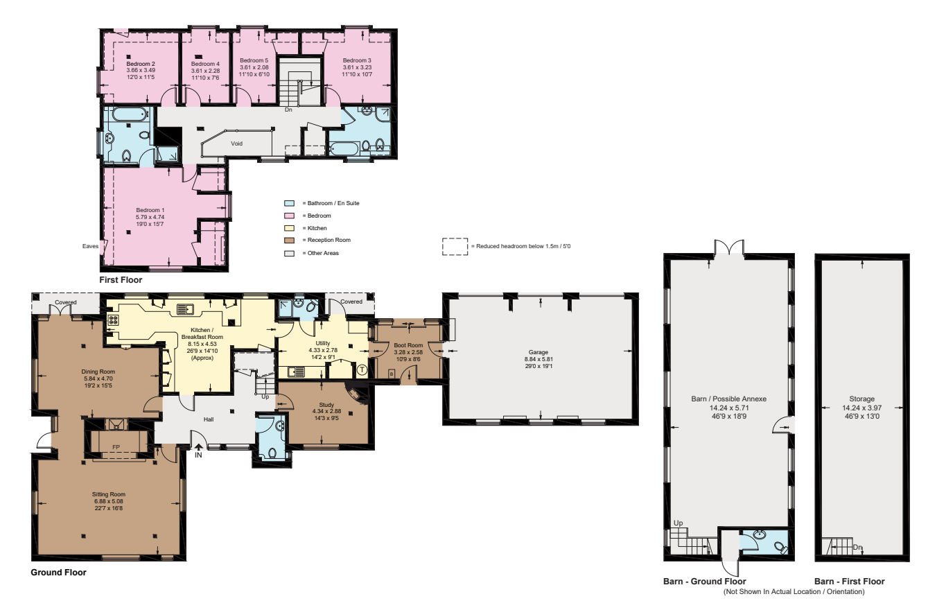
Illustration for identification purposes only, measurements are approximate, not to scale. floorplansUsketch.com © (ID1119662)

Fixtures and fittings: A list of the fitted carpets, curtains, light fittings and other items fixed to the property which are included in the sale (or may be available by separate negotiation) will be provided by the Seller's Solicitors.