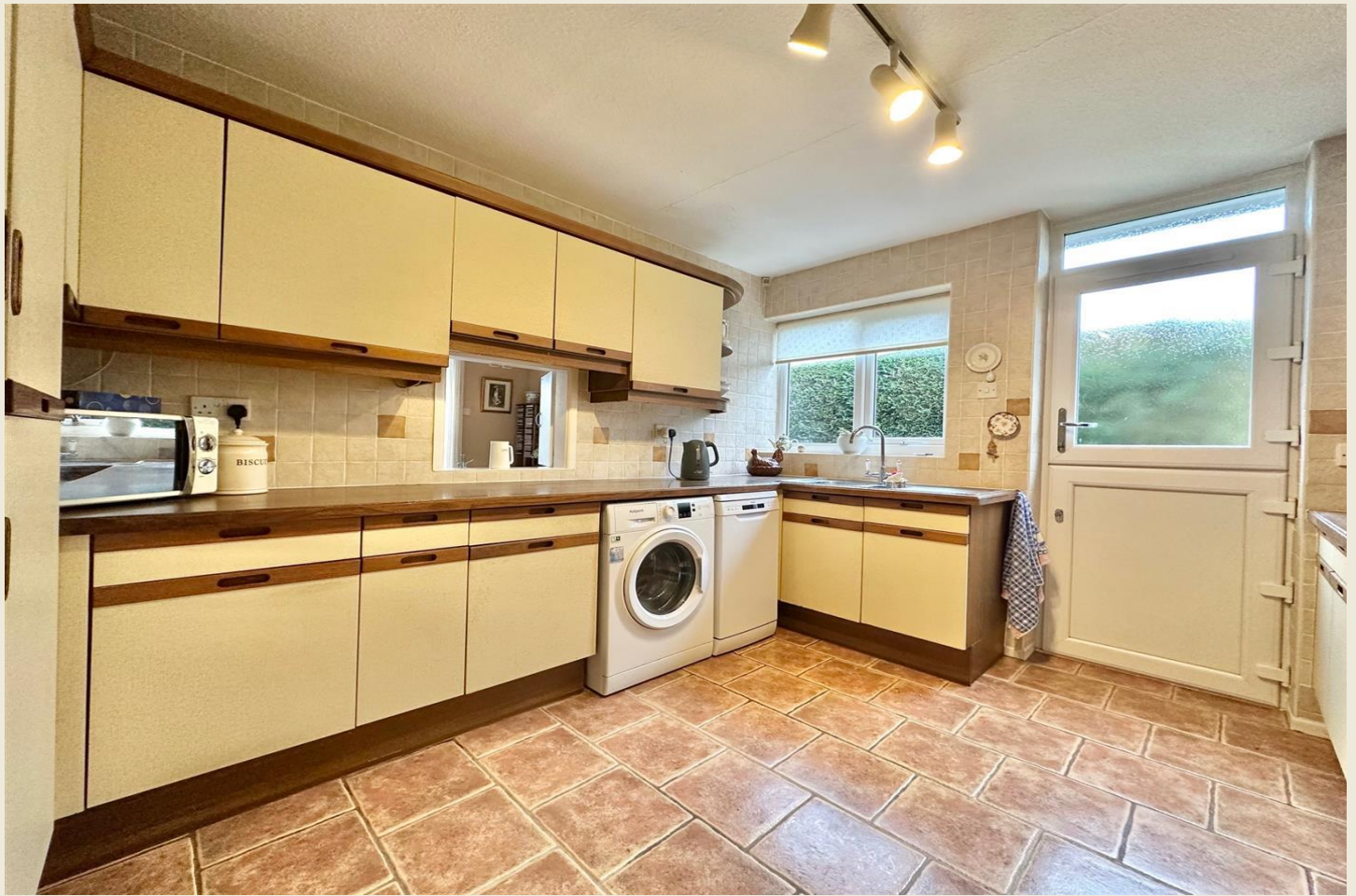
KITCHEN 11'10 x 9'10