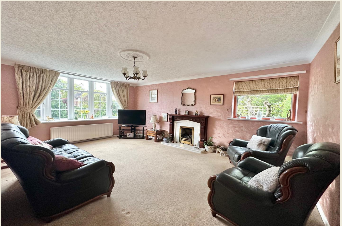
LIVING ROOM 17'6 x 12'2