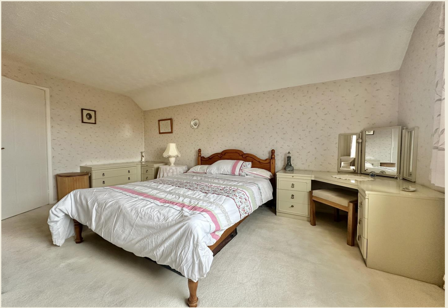
BEDROOM TWO 15'0 x 13'11