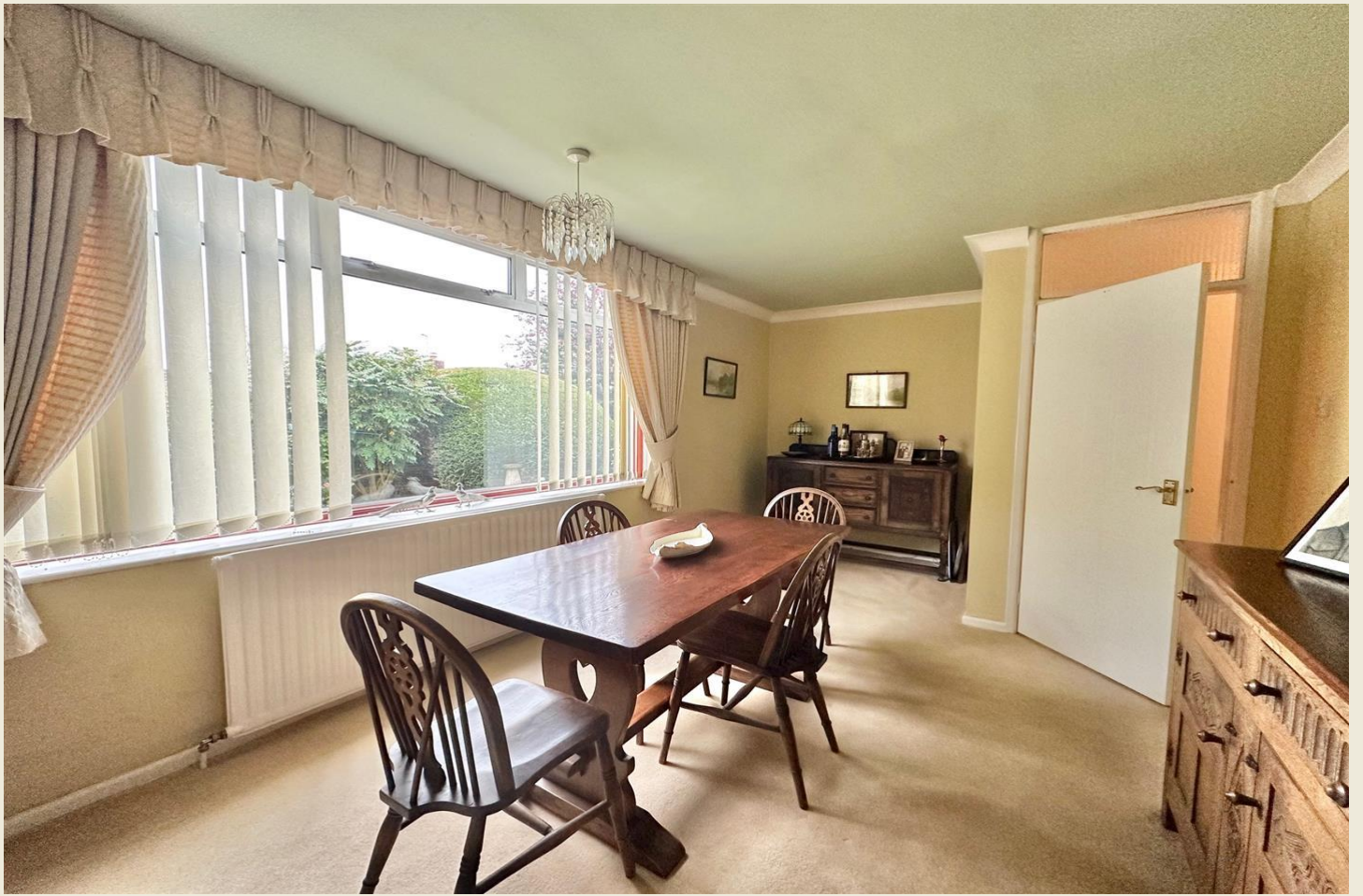
DINING ROOM / BEDROOM FOUR 16'5 x 9'11