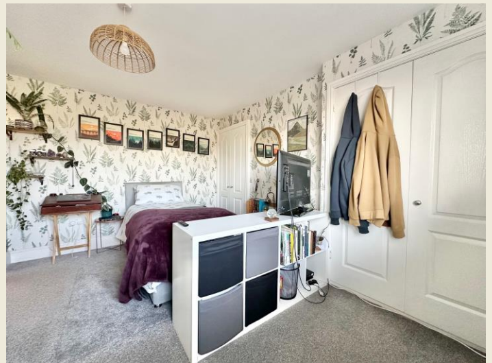
BEDROOM FOUR 9'0 x 8'5