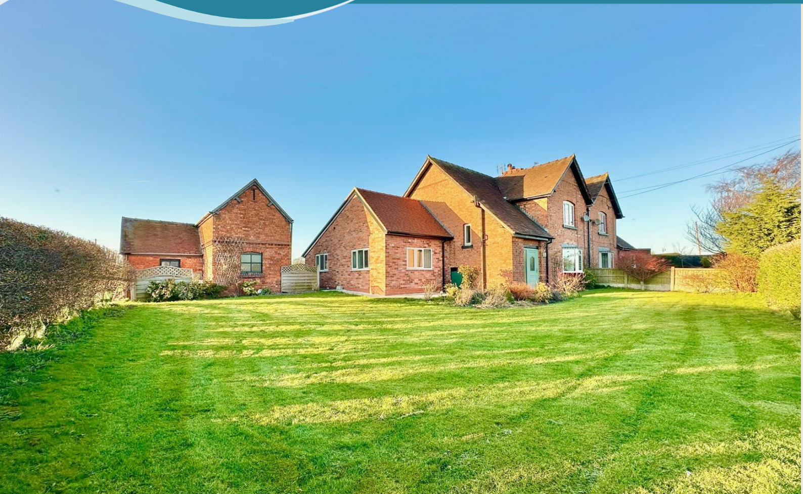
'ROSE COTTAGE' | MIDDLEWICH ROAD | LEIGHTON | CHESHIRE | CW1 4QQ | OIRO £485,000