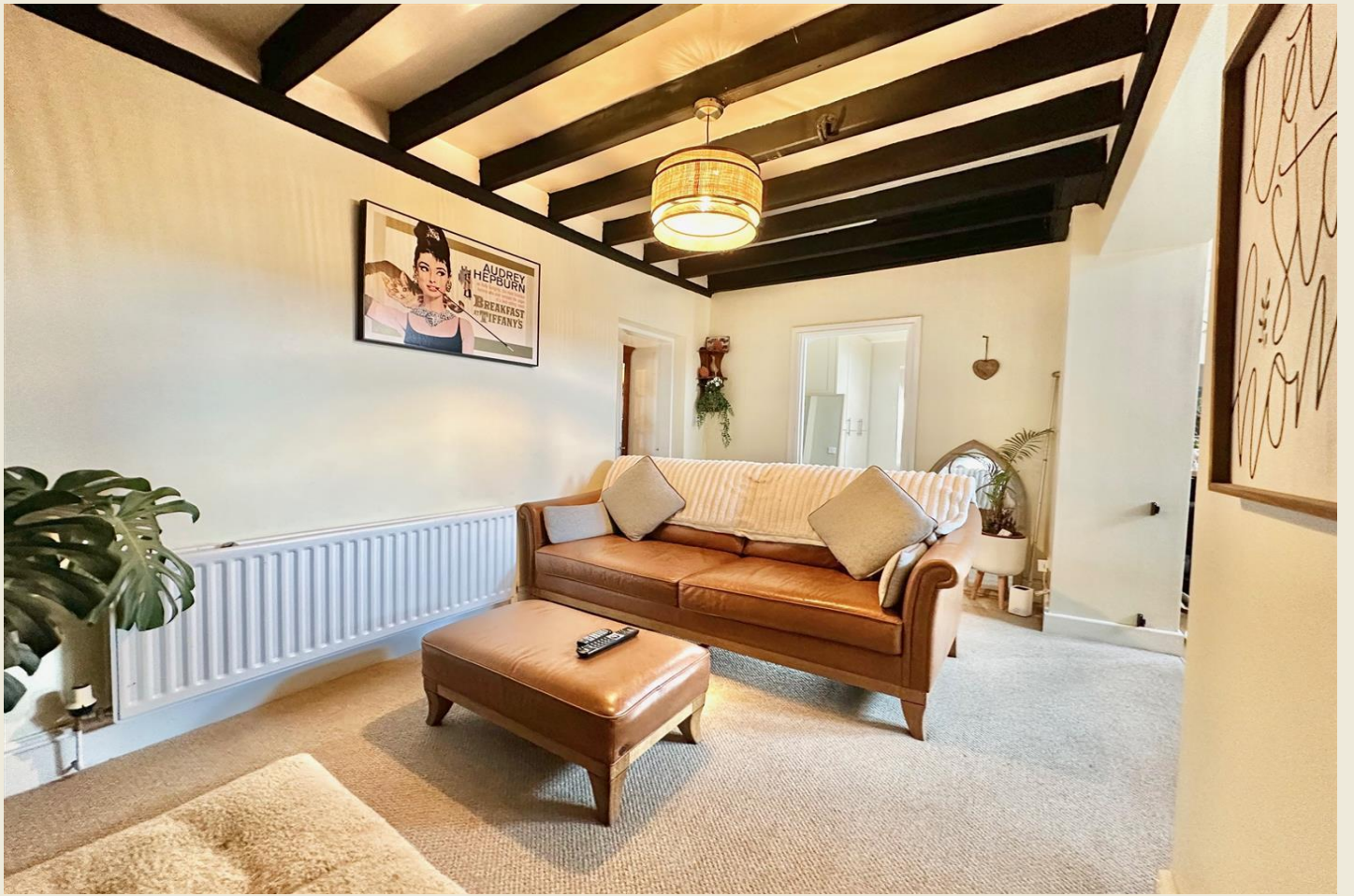
TV / GAMES AREA 15'0 x 8'4