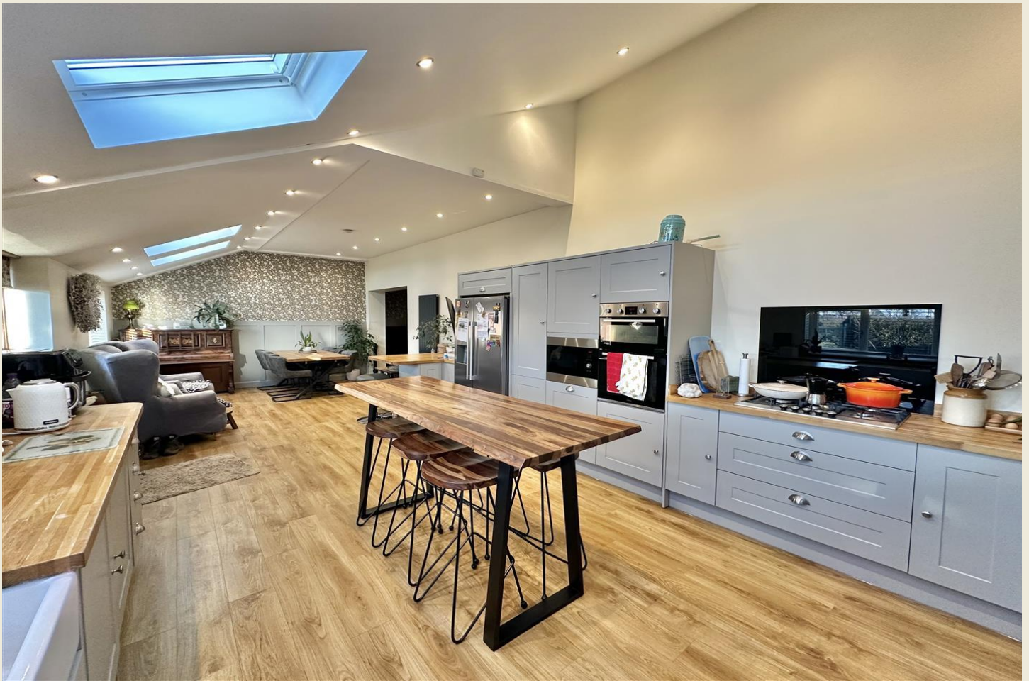
KITCHEN DINING FAMILY ROOM 32'2 x 13'2