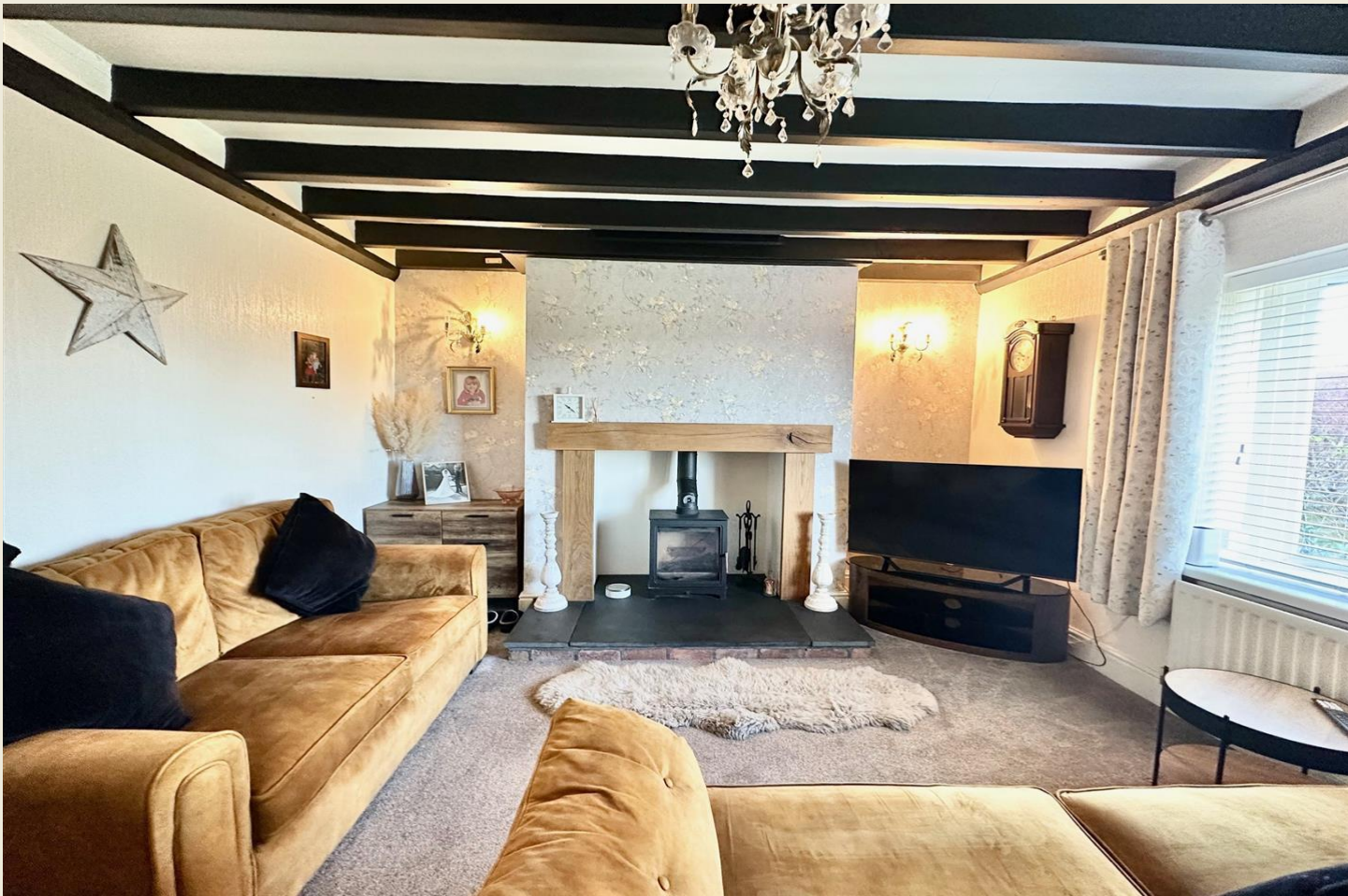
SITTING ROOM 14'11 x 13'0