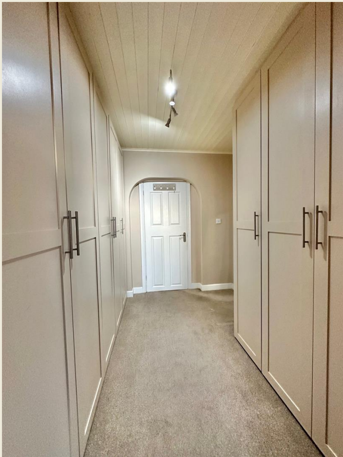
DRESSING ROOM 8'11 x 8'3