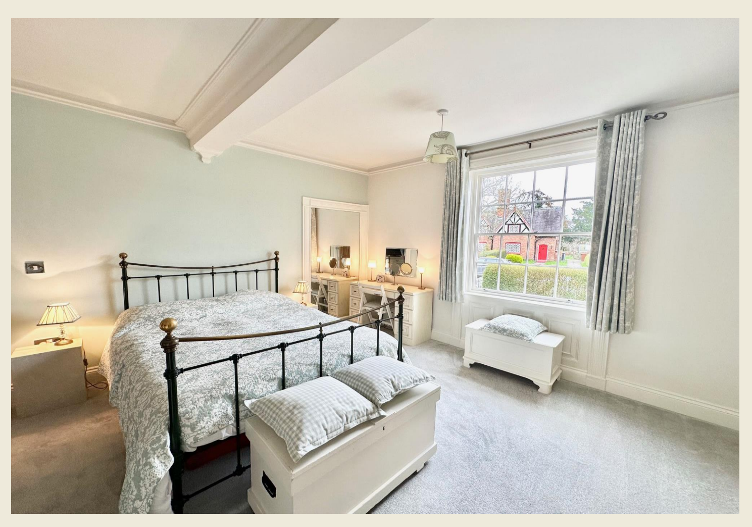
MASTER BEDROOM ONE (16'5 x 15'5)