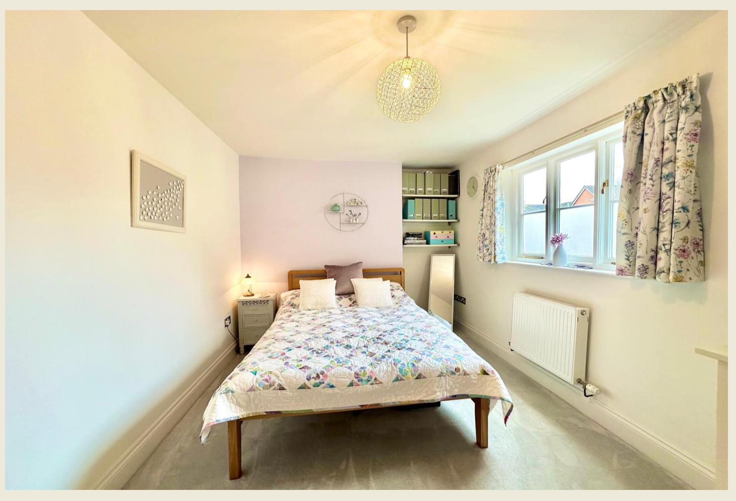
BEDROOM TWO (16'5 x 9'6)