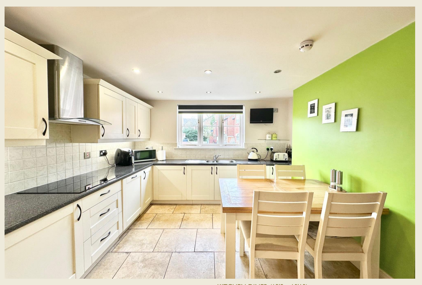
KITCHEN DINER (13'5 \times 10'10)