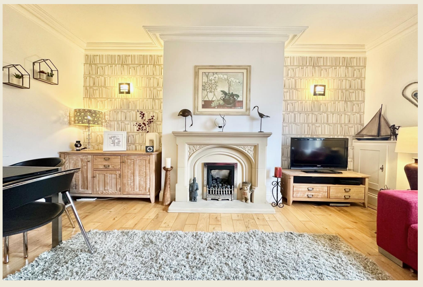
LIVING DINING ROOM (15'5 x 14'10)