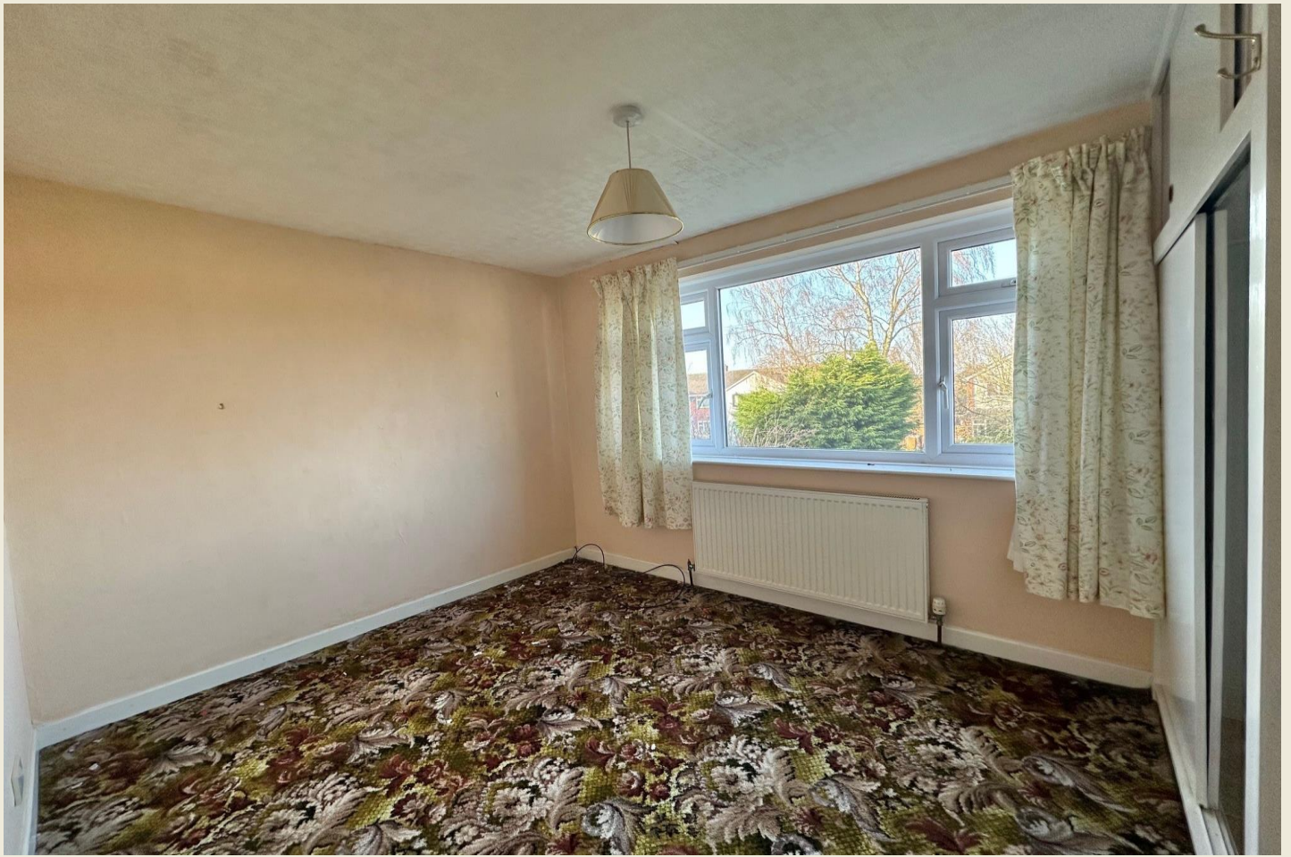
BEDROOM TWO 13'10 x 8'6