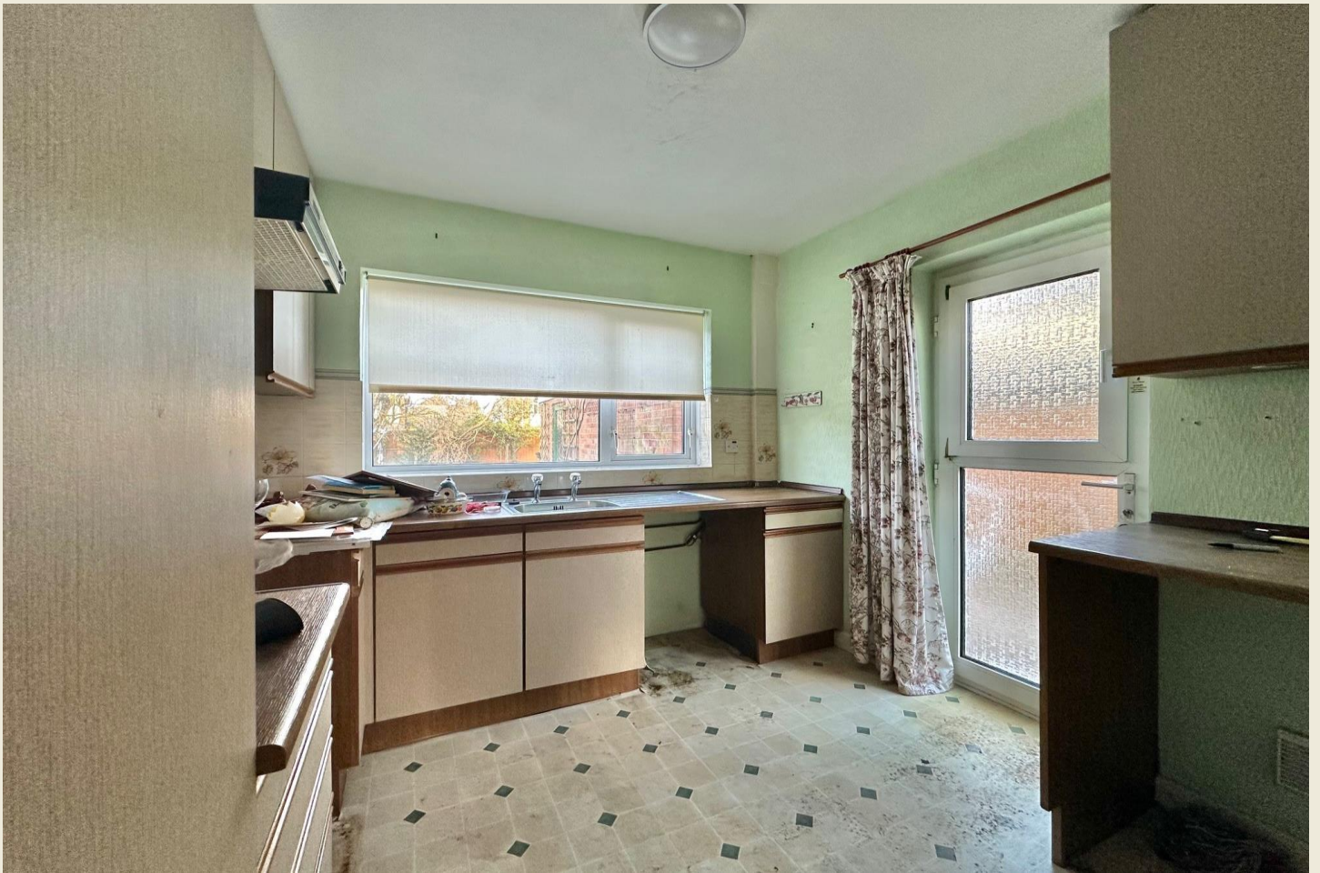
KITCHEN 10'1 x 8'11