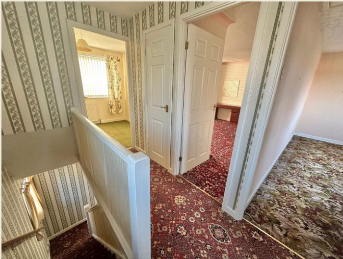
BATHROOM 8'0 x 5'6