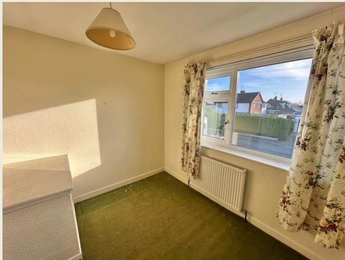
BEDROOM THREE 9'0 x 7'8