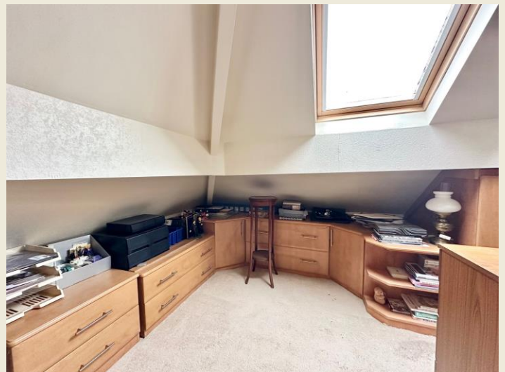
SECOND FLOOR LOFT ROOM