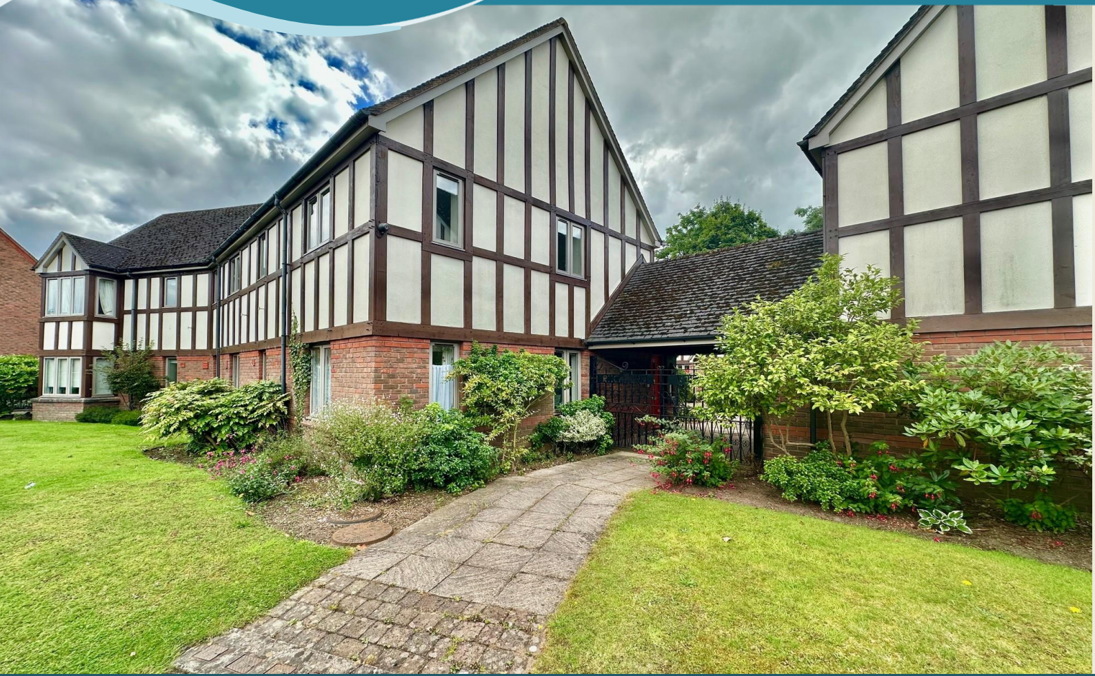
APARTMENT 23, RICHMOND VILLAGE | ST JOSEPH'S WAY OFF LONDON ROAD | NANTWICH | CHESHIRE | CW5 6LZ | OFFERS OVER £200,000