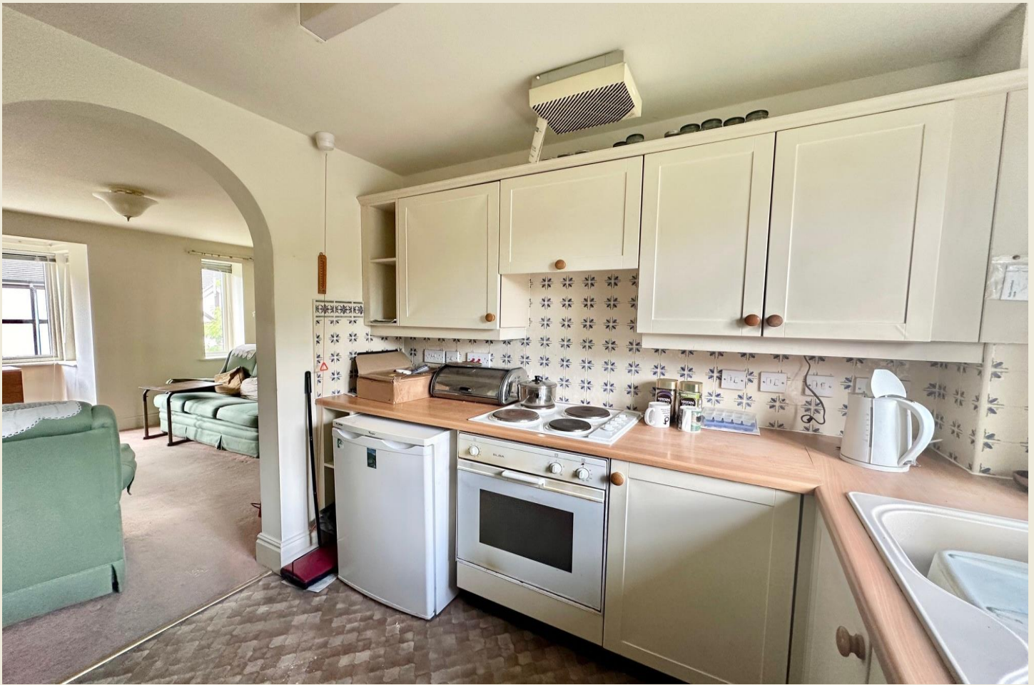
KITCHEN BREAKFAST ROOM 8'7 x 8'6