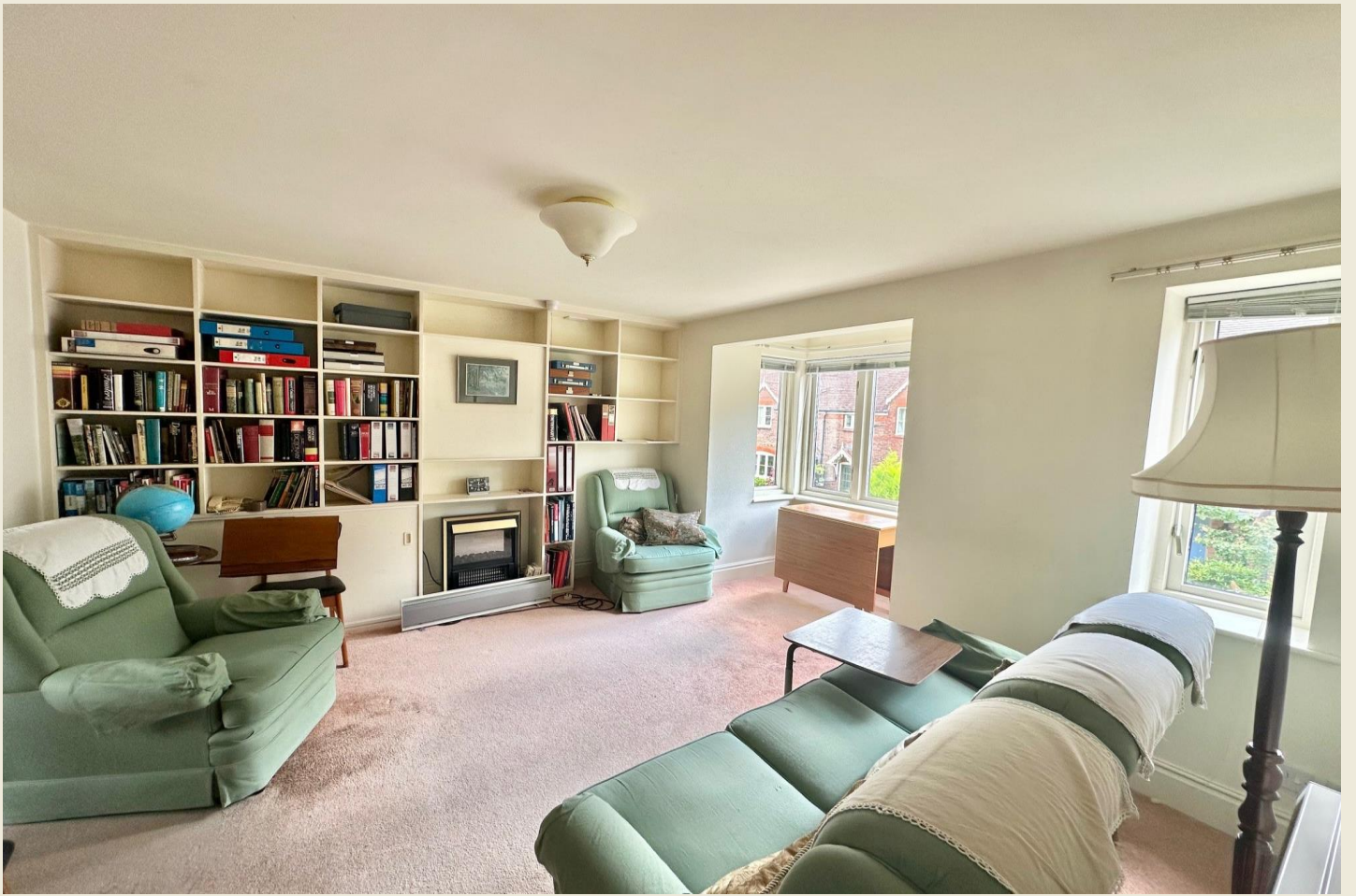
LIVING DINING ROOM 14'7 x 12'5