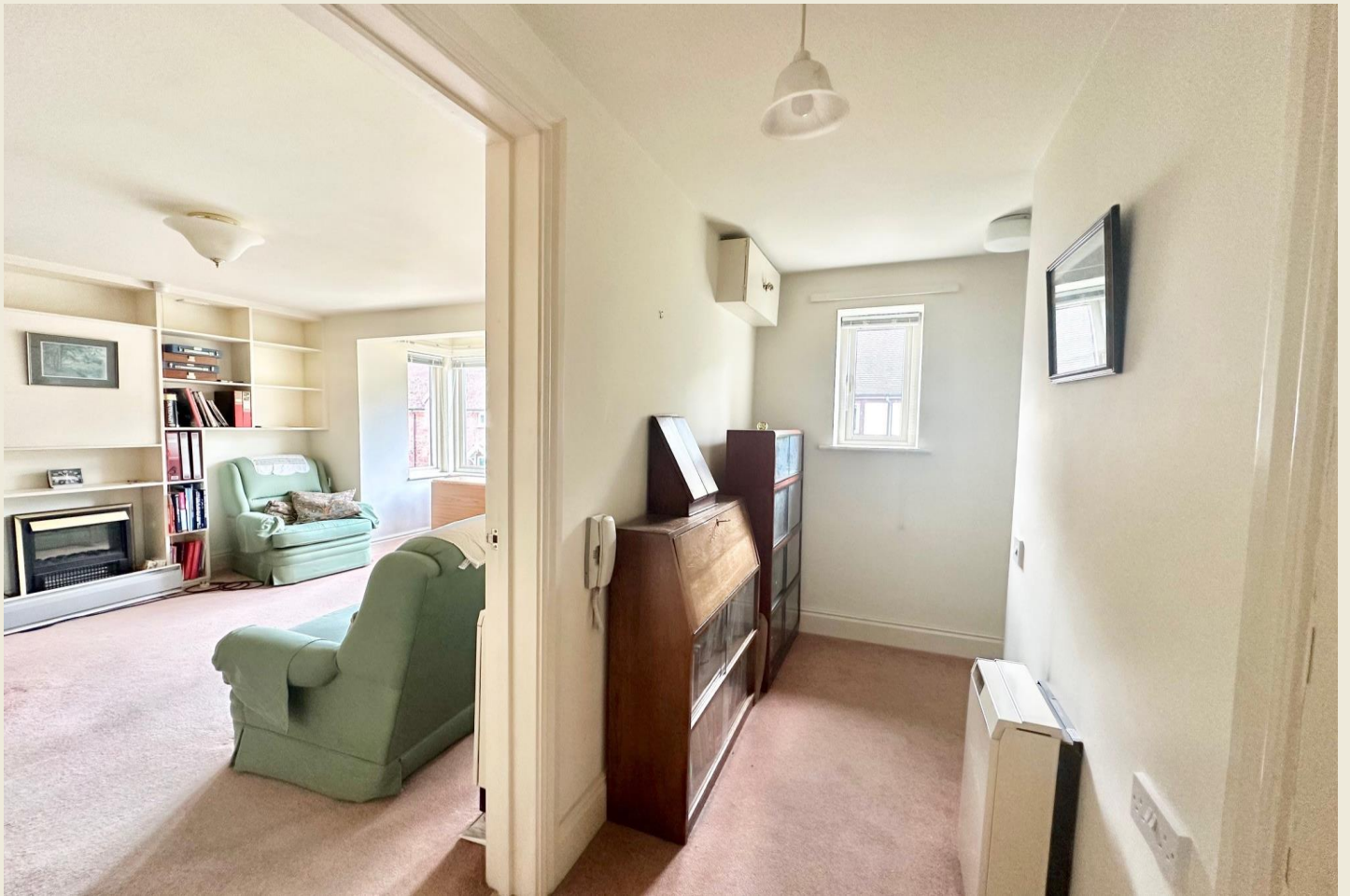
THE ACCOMMODATION:- With approximate dimensions, comprises;