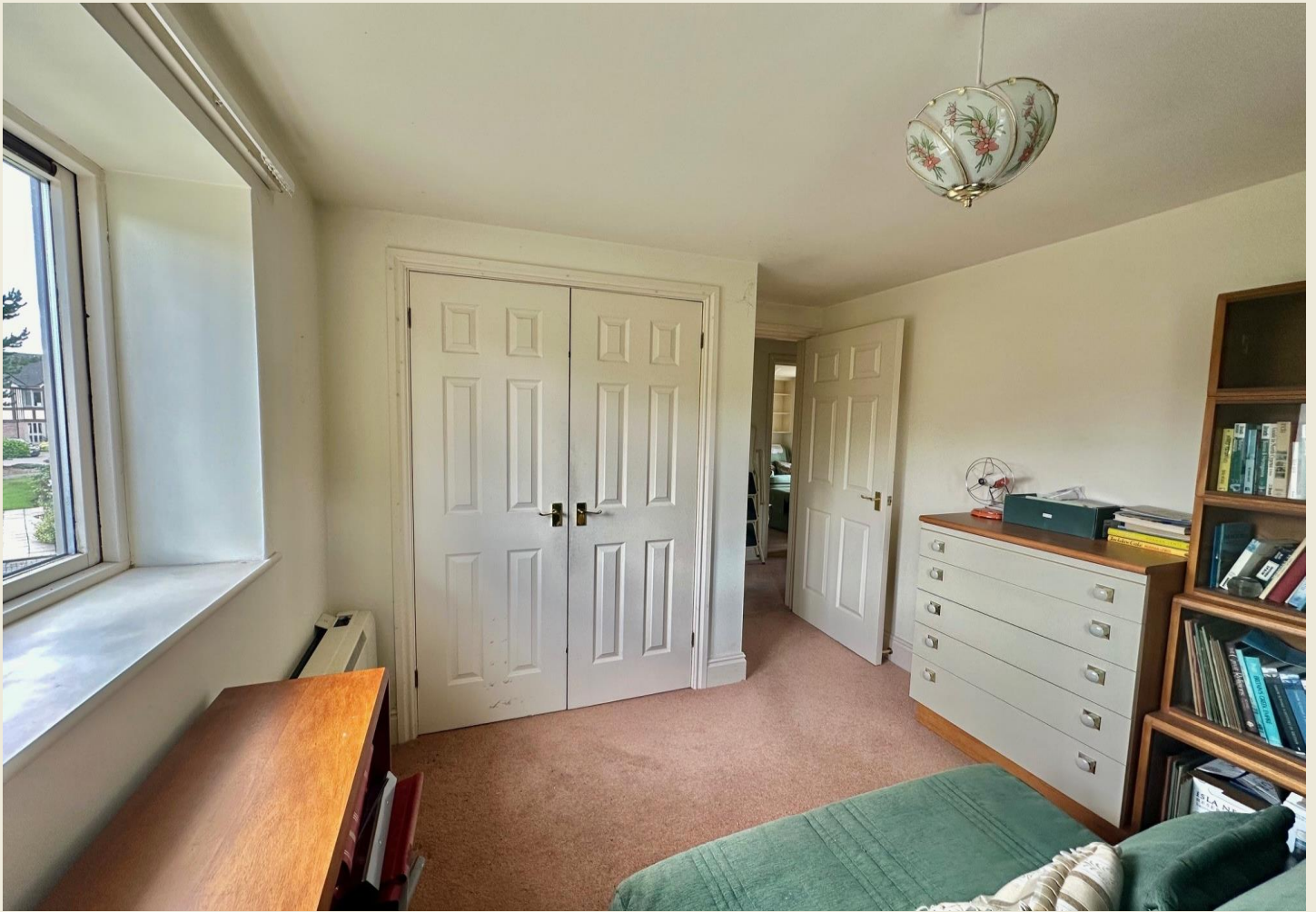
BEDROOM ONE 11'10 x 9'1