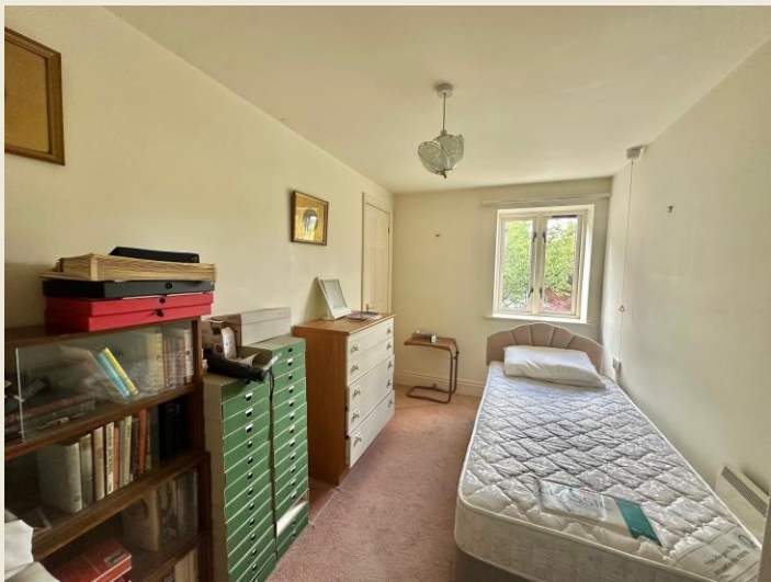
BEDROOM TWO 11'11 x 7'2