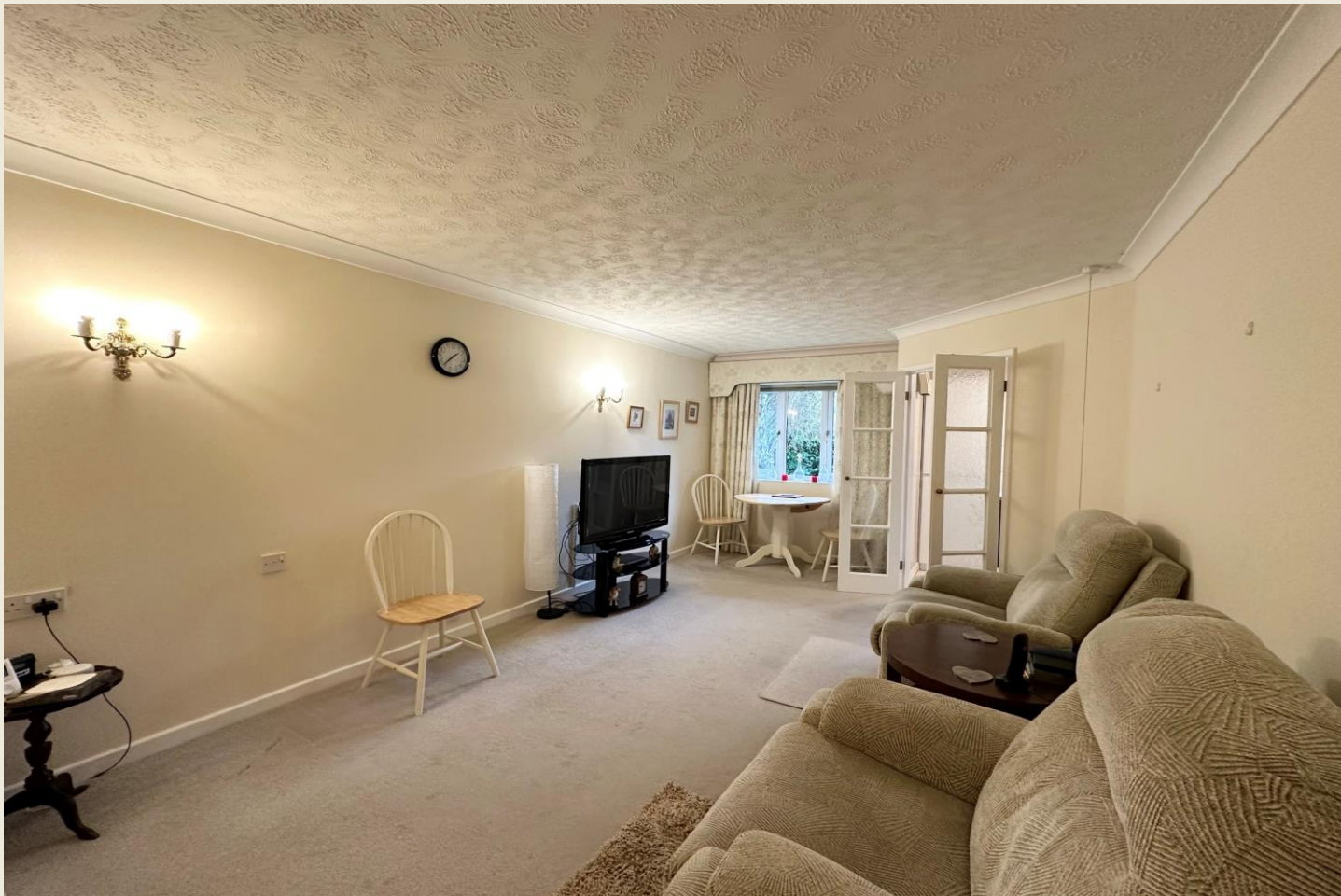
LIVING DINING ROOM 19'0 x 10'9