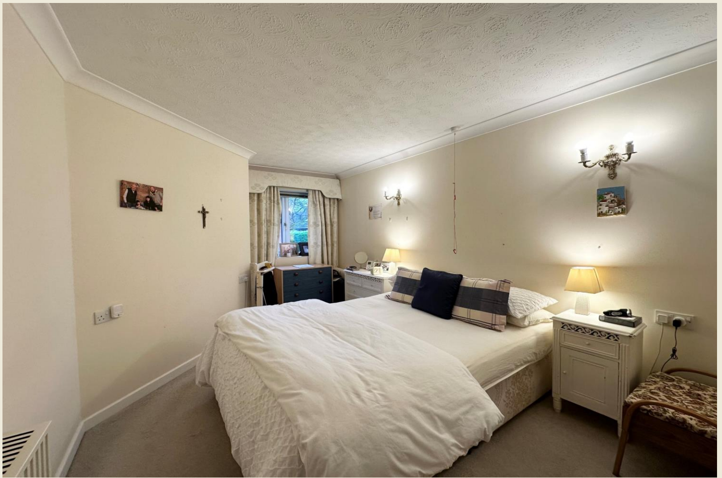
BEDROOM 15'9 x 9'2