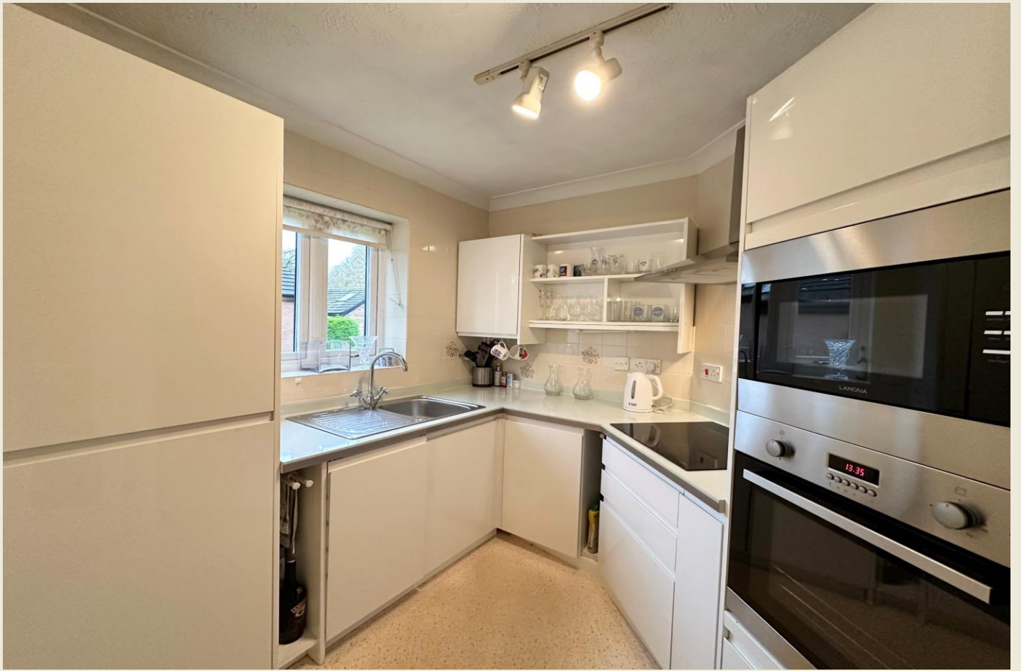
FITTED KITCHEN 8'4 x 7'9