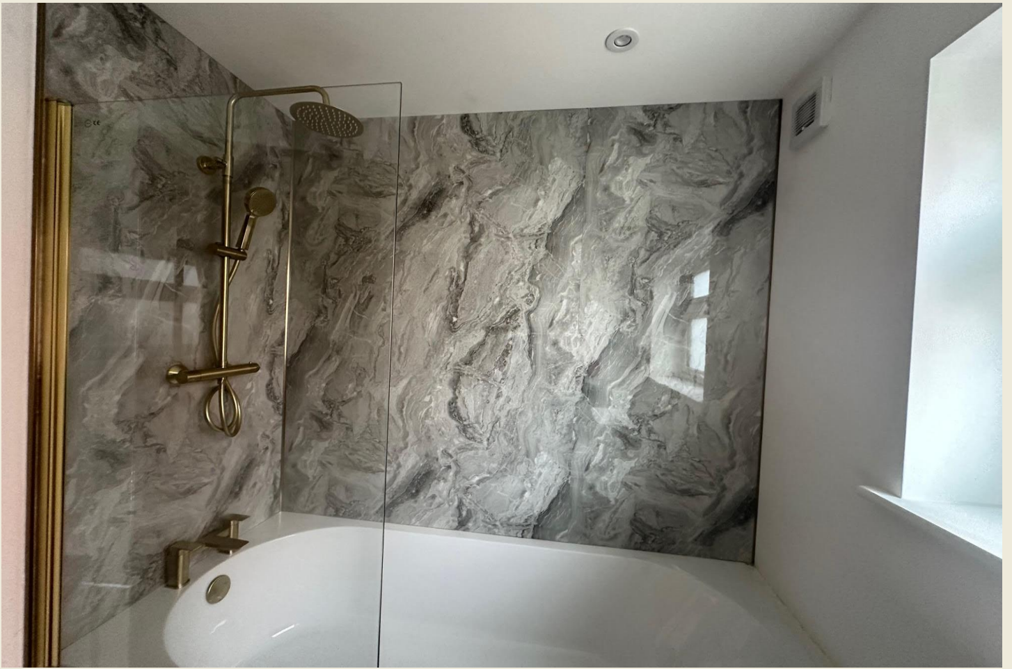
BATHROOM 6'6 x 6'0