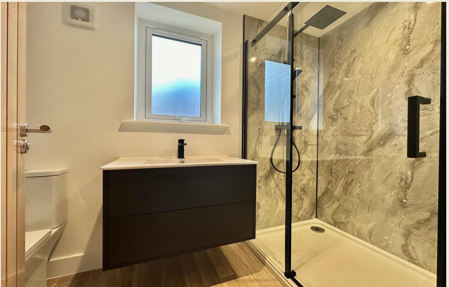
SHOWER ROOM 9'2 x 4'6