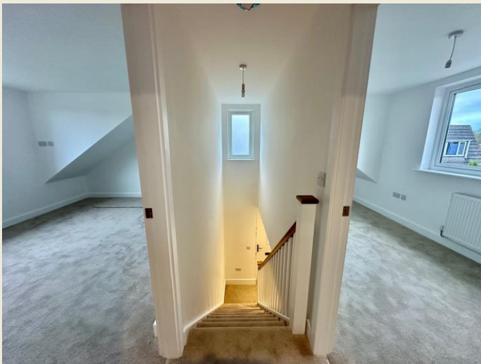
BEDROOM ONE 20'0 x 10'9