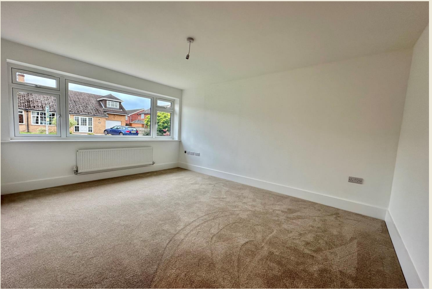
LIVING ROOM 13'6 x 10'3