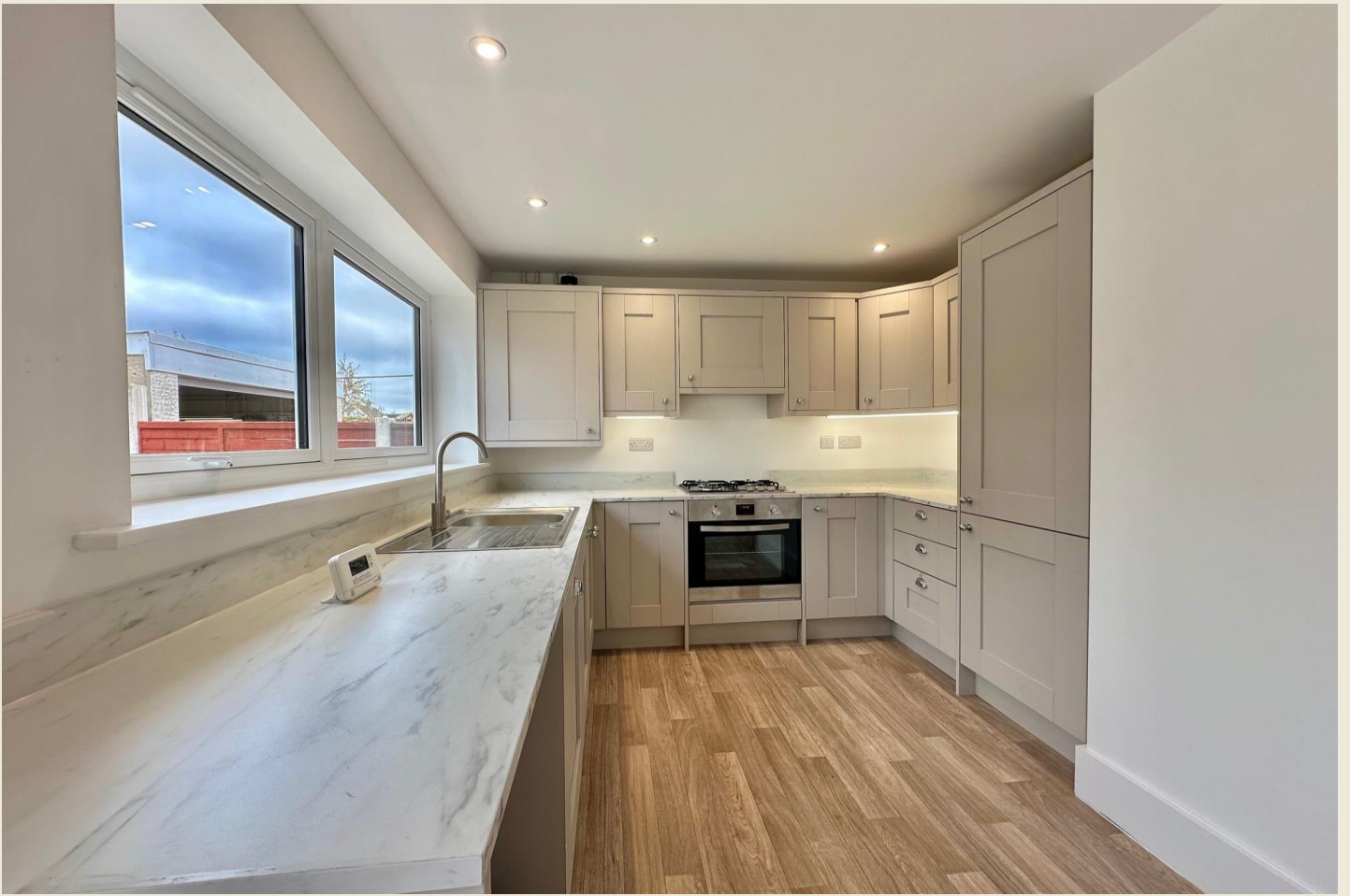
KITCHEN DINER 20'0 x 9'0