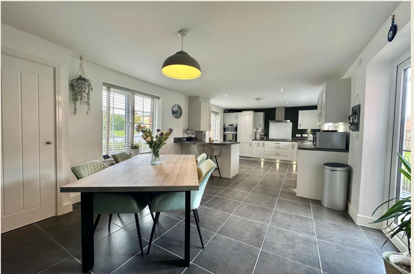
KITCHEN DINING FAMILY ROOM