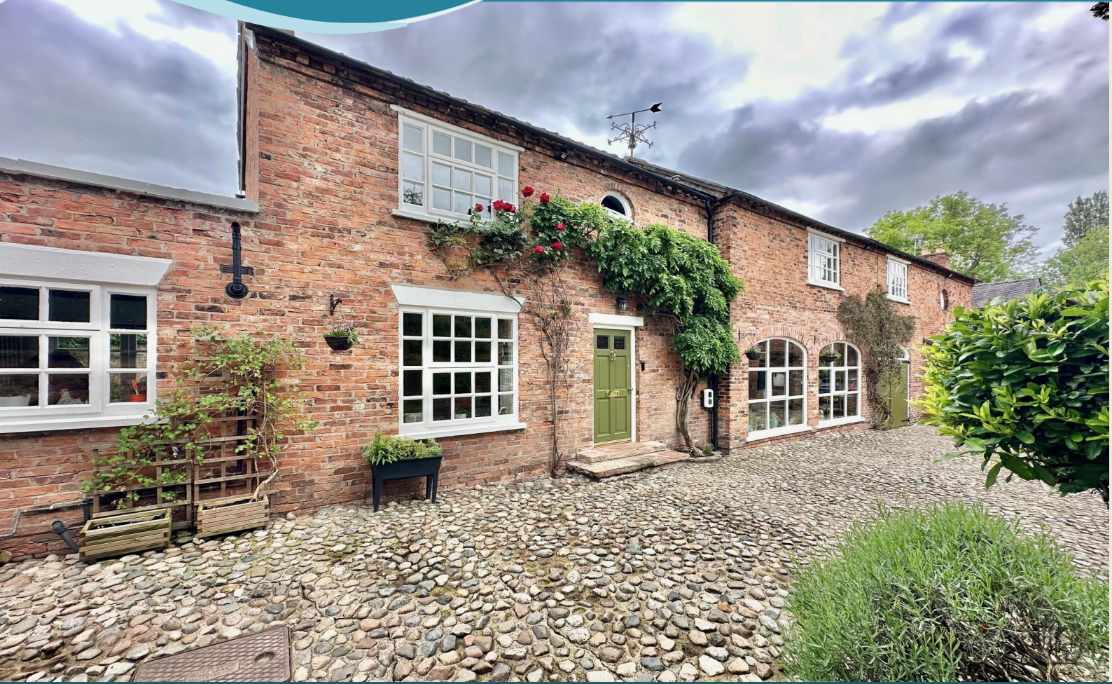
'THE COACH HOUSE' | 83 WELSH ROW | NANTWICH | CHESHIRE | CW5 5ET | OIRO £595,000