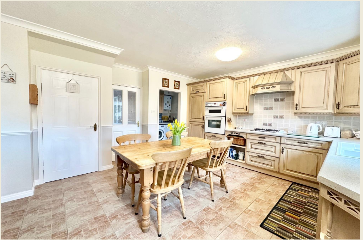
KITCHEN DINER (14'5 x 11'19)