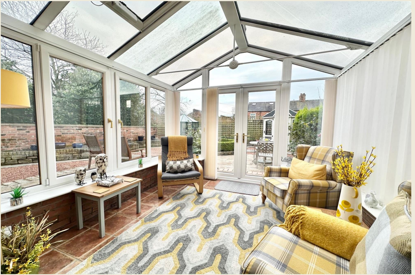
CONSERVATORY (9'10 x 9'10)