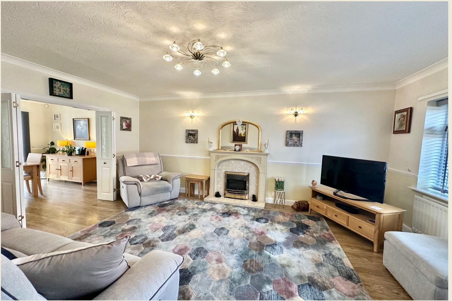
LIVING ROOM (17'1 x 11'10)