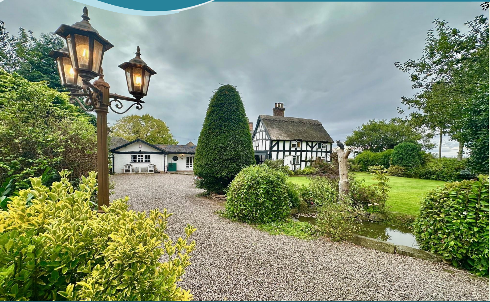
'CUCKOO COTTAGE' | CUCKOO LANE | ACTON | NANTWICH | CHESHIRE | CW5 8LL | OIRO £485,000