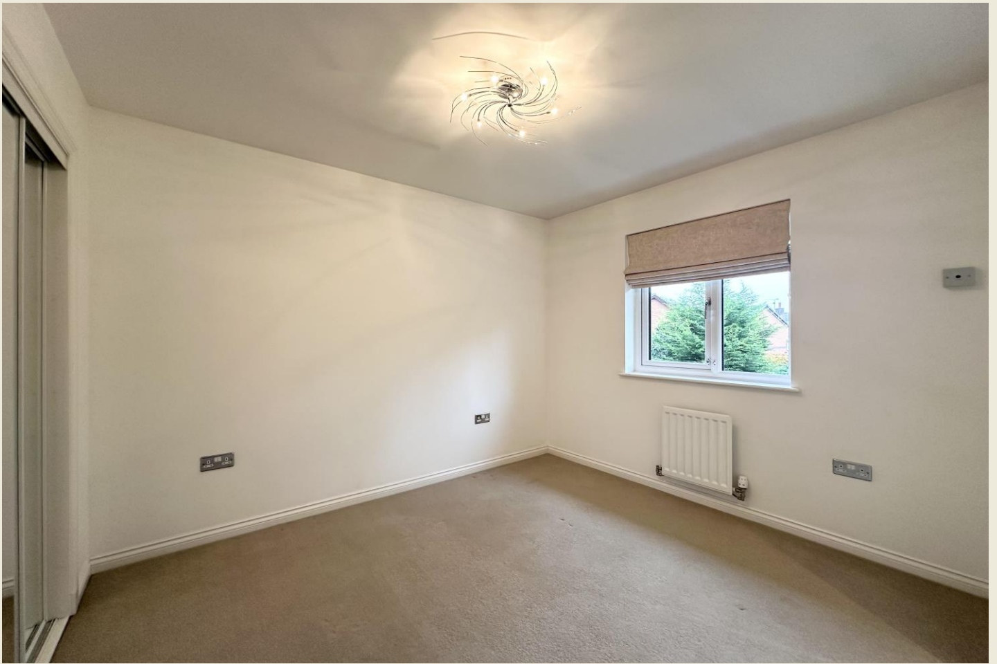
BEDROOM TWO (9'9 x 8'5)