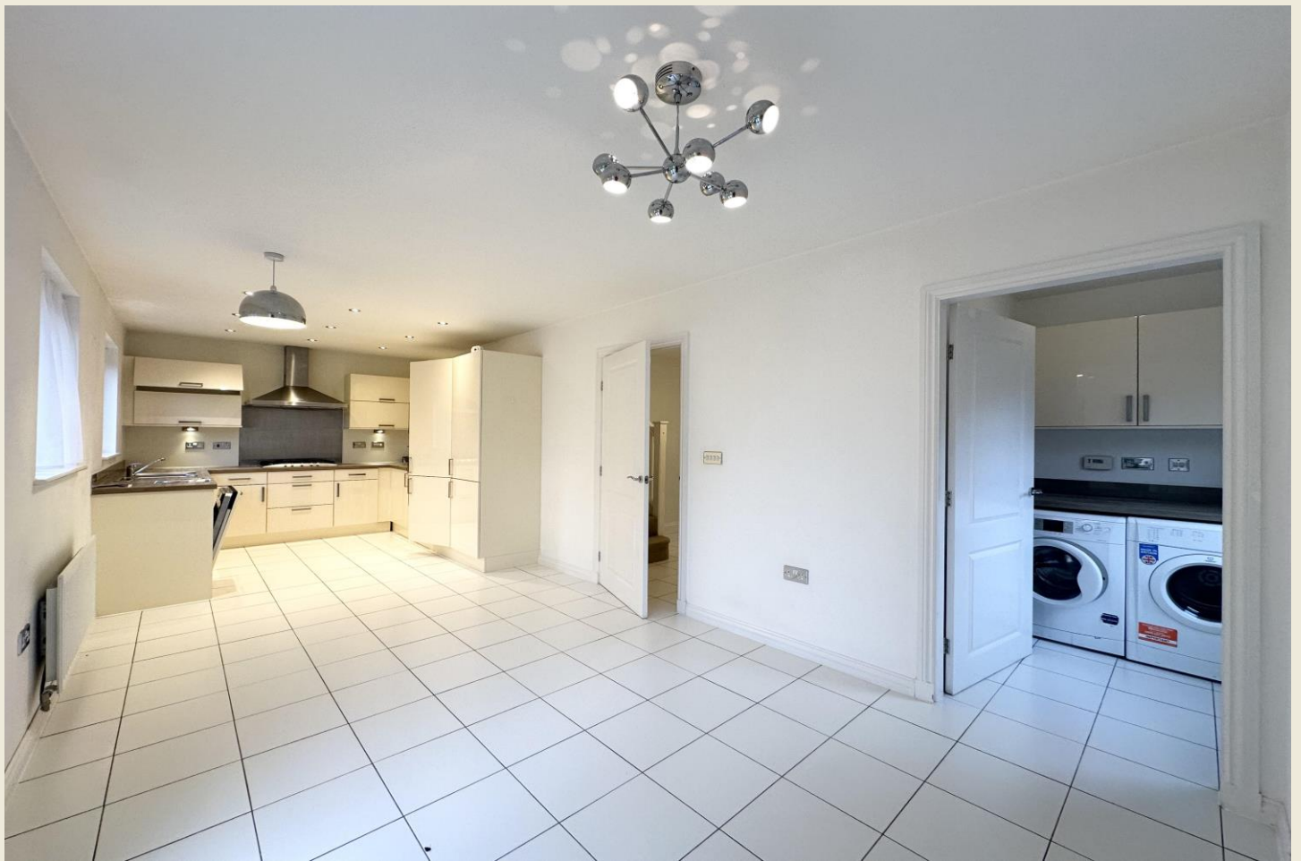
KITCHEN DINING FAMILY ROOM (24'8 x 9'3)