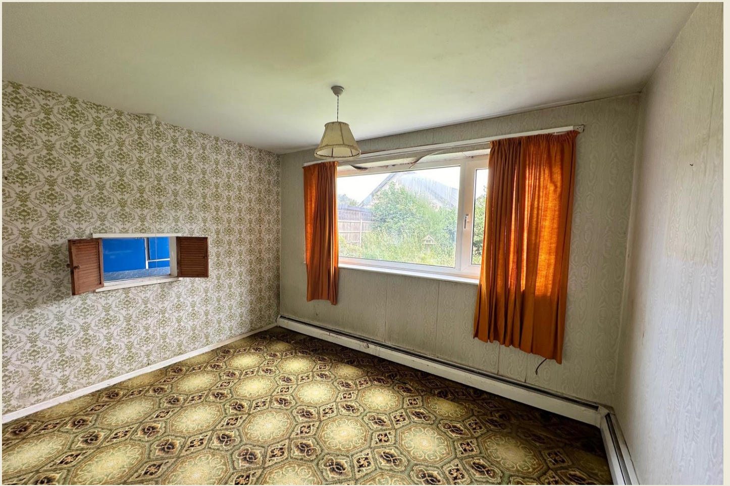
BEDROOM THREE / DINING ROOM (9'10 x 10'10)