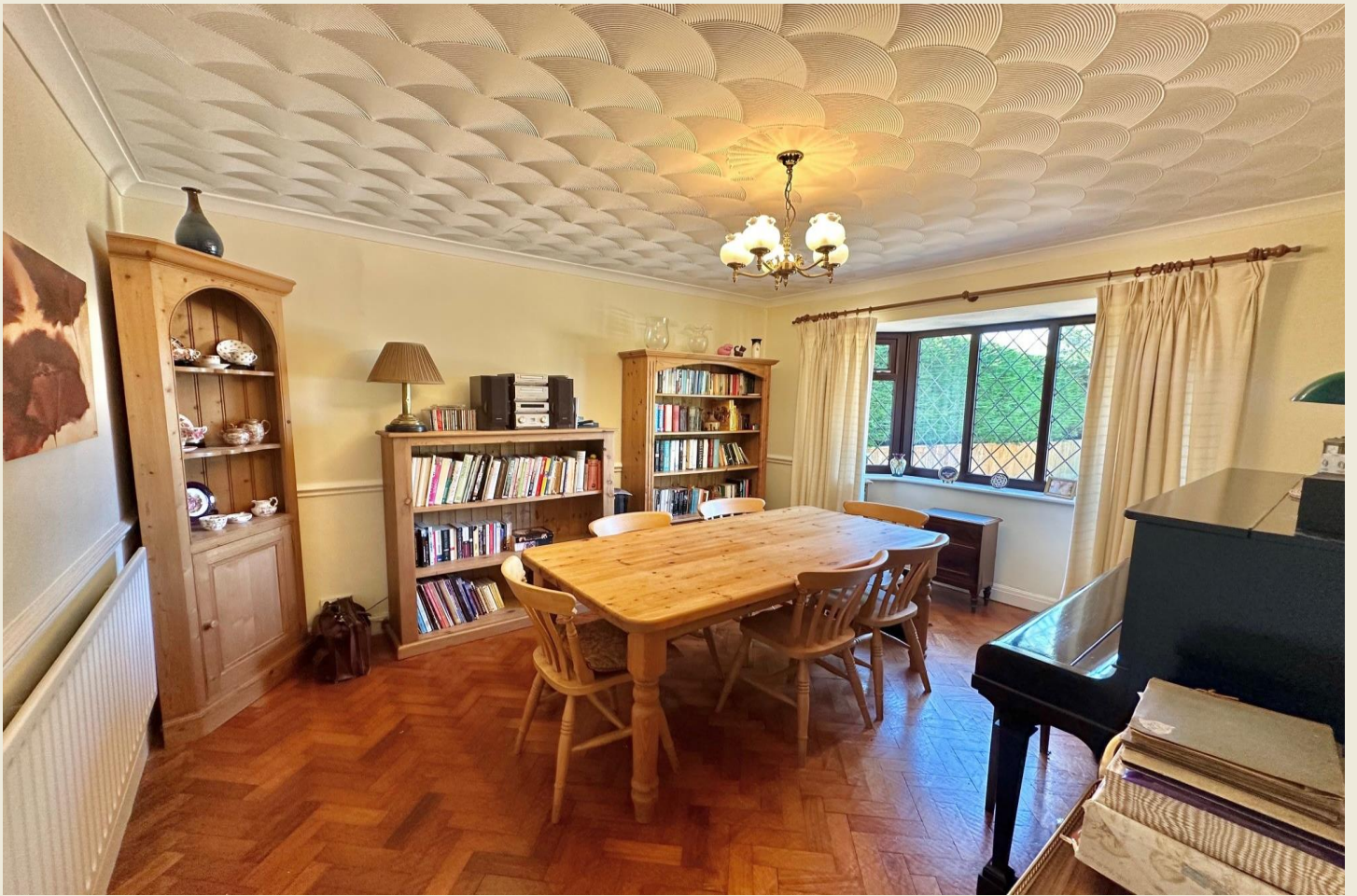
FORMAL DINING ROOM (13'10 x 10'11)