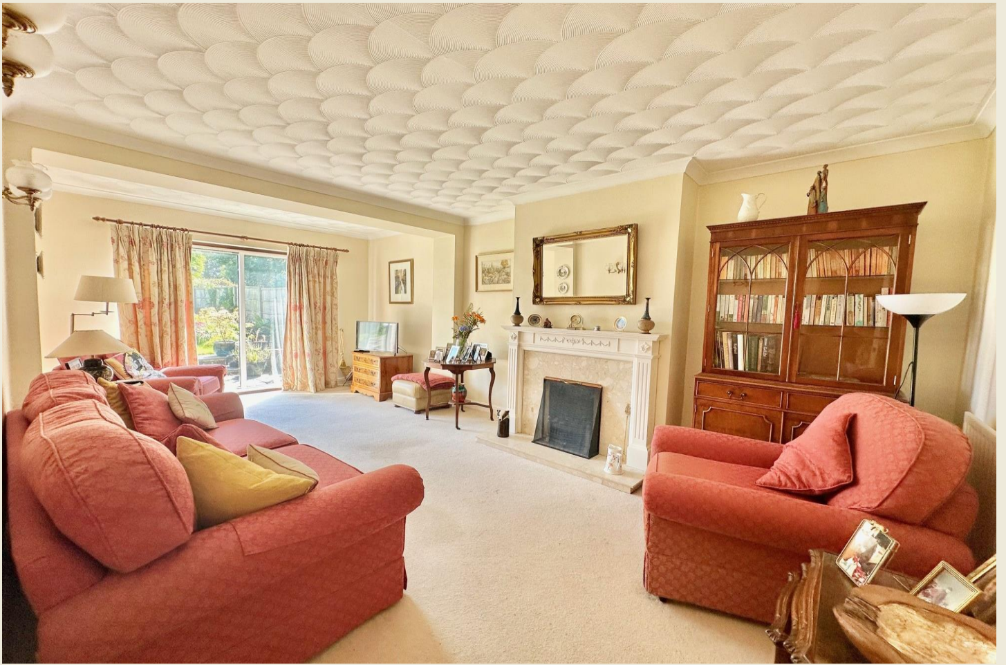
LIVING ROOM (19'8 x 10'11)