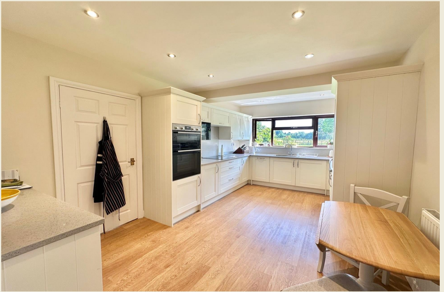
KITCHEN DINER (16'6 x 9'11)