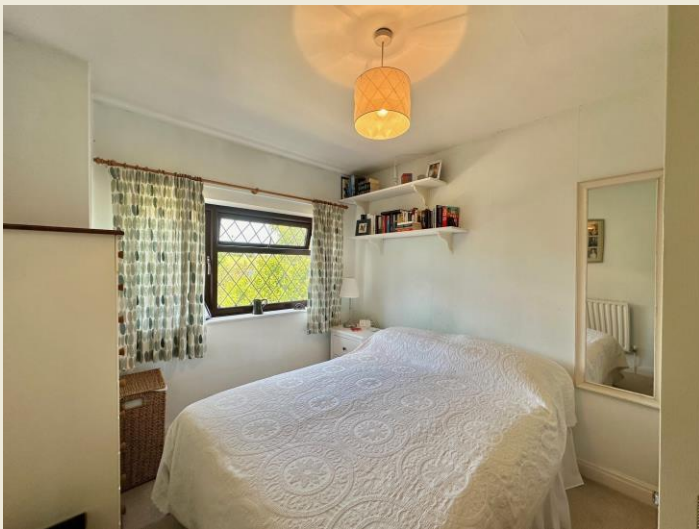
BEDROOM FOUR (10'2 x 8'8)