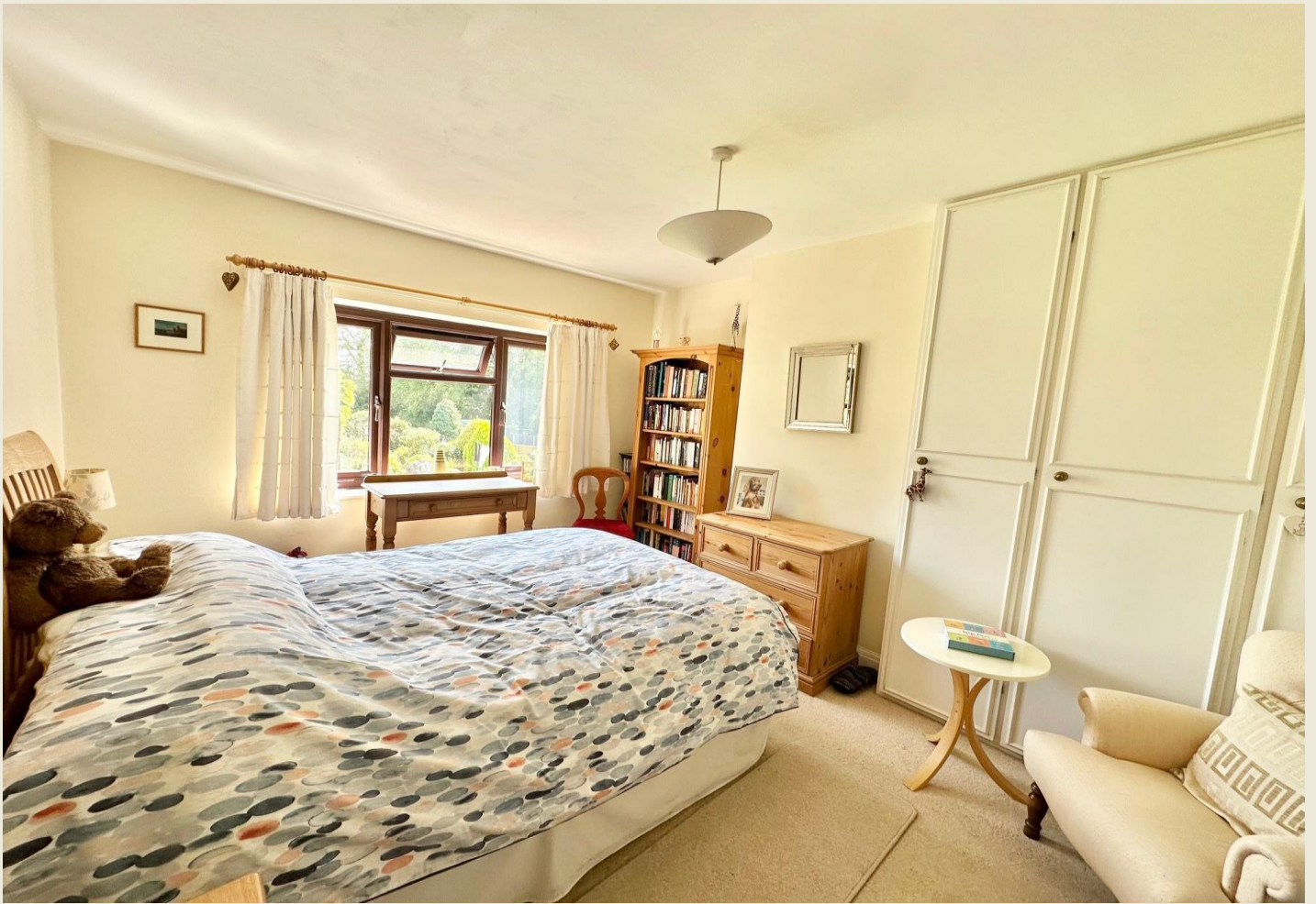
BEDROOM TWO (13'1 x 10'11)