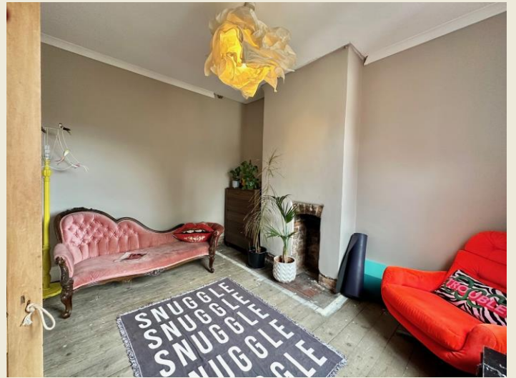
LOFT ROOM (15'6 x 14'11) Accessed via drop down loft ladders.