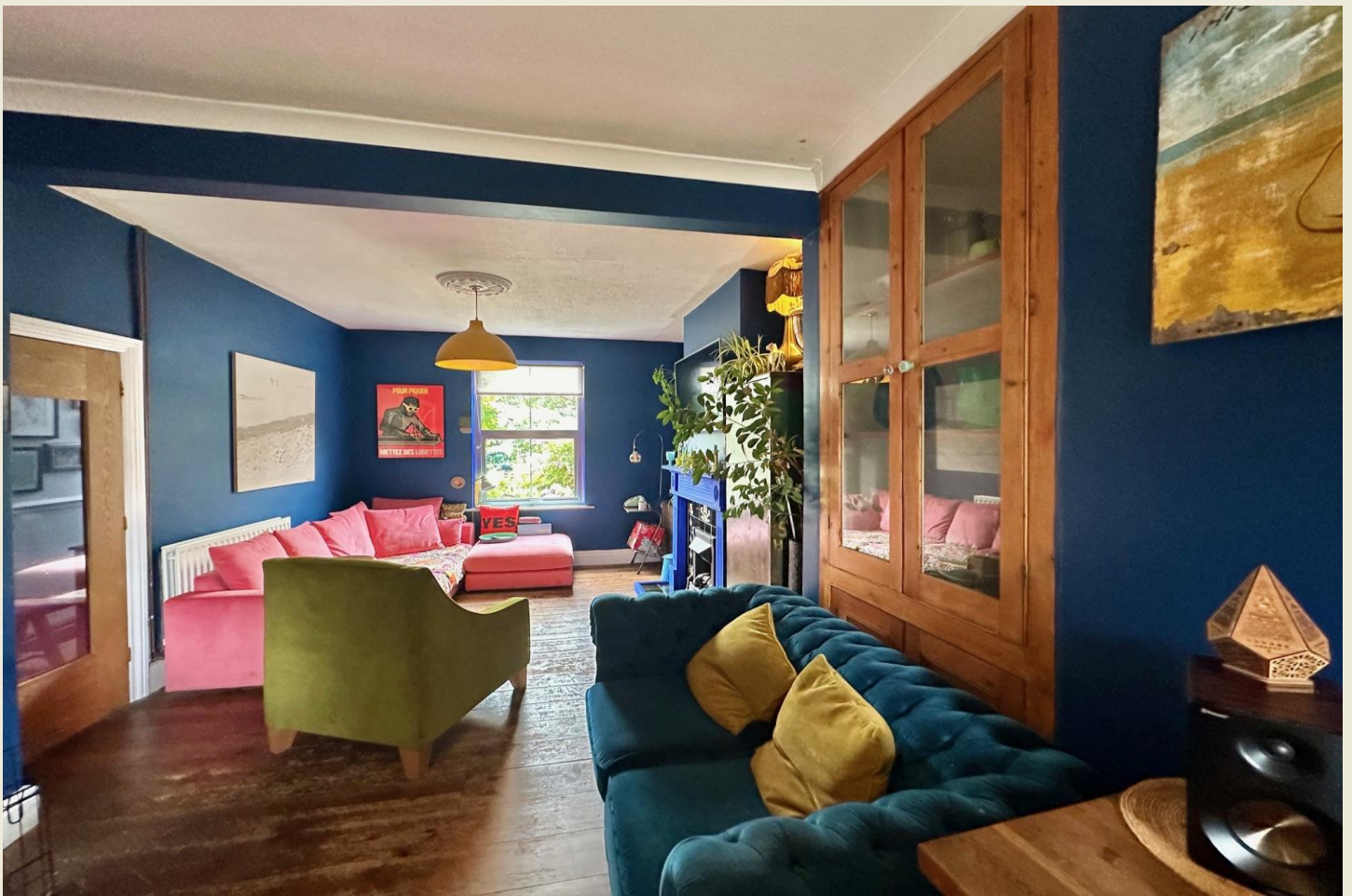
OPEN PLAN LIVING DINING ROOM (23'7 x 11'10)