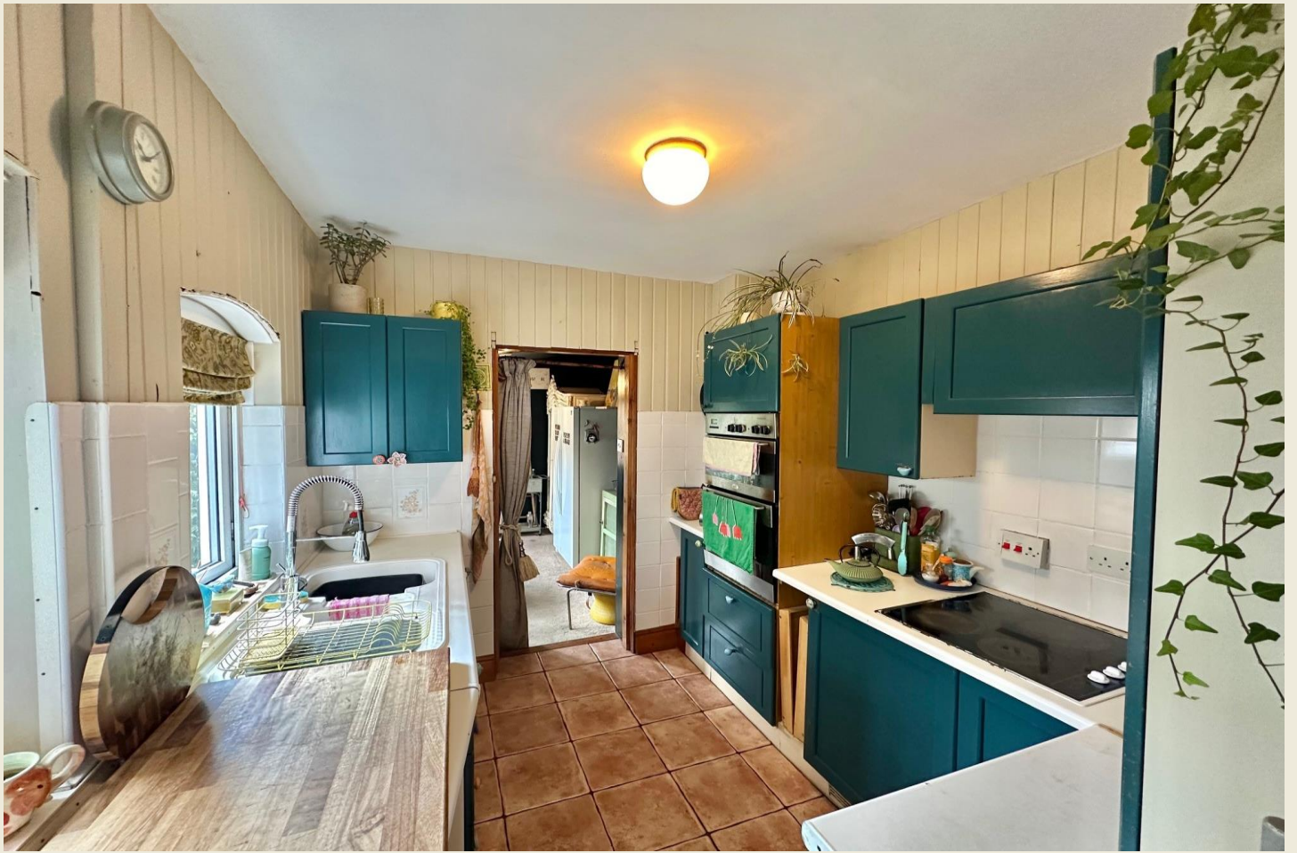
KITCHEN (8'11 x 7'11)