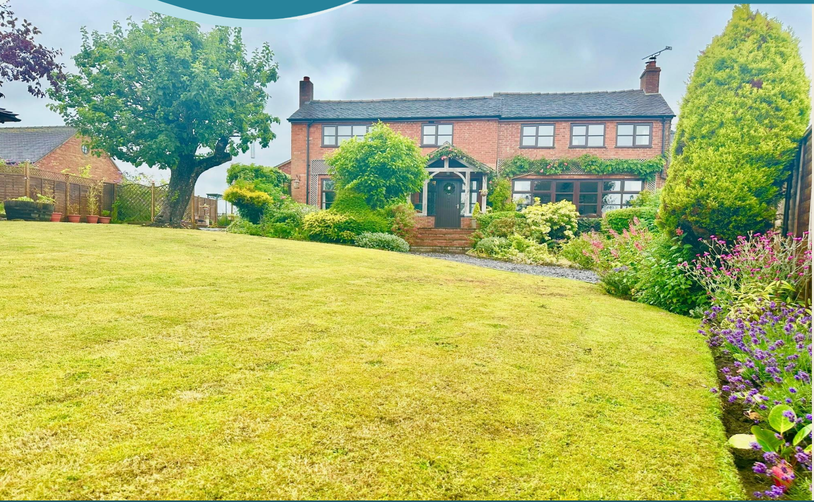
'RICHMOND HOUSE' | MILL LANE | AUDLEM | CHESHIRE | CW3 0AY | OIRO £850,000