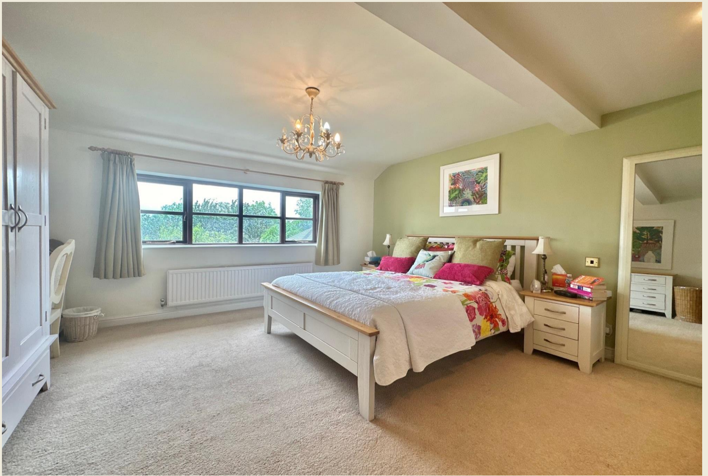
MASTER BEDROOM ONE