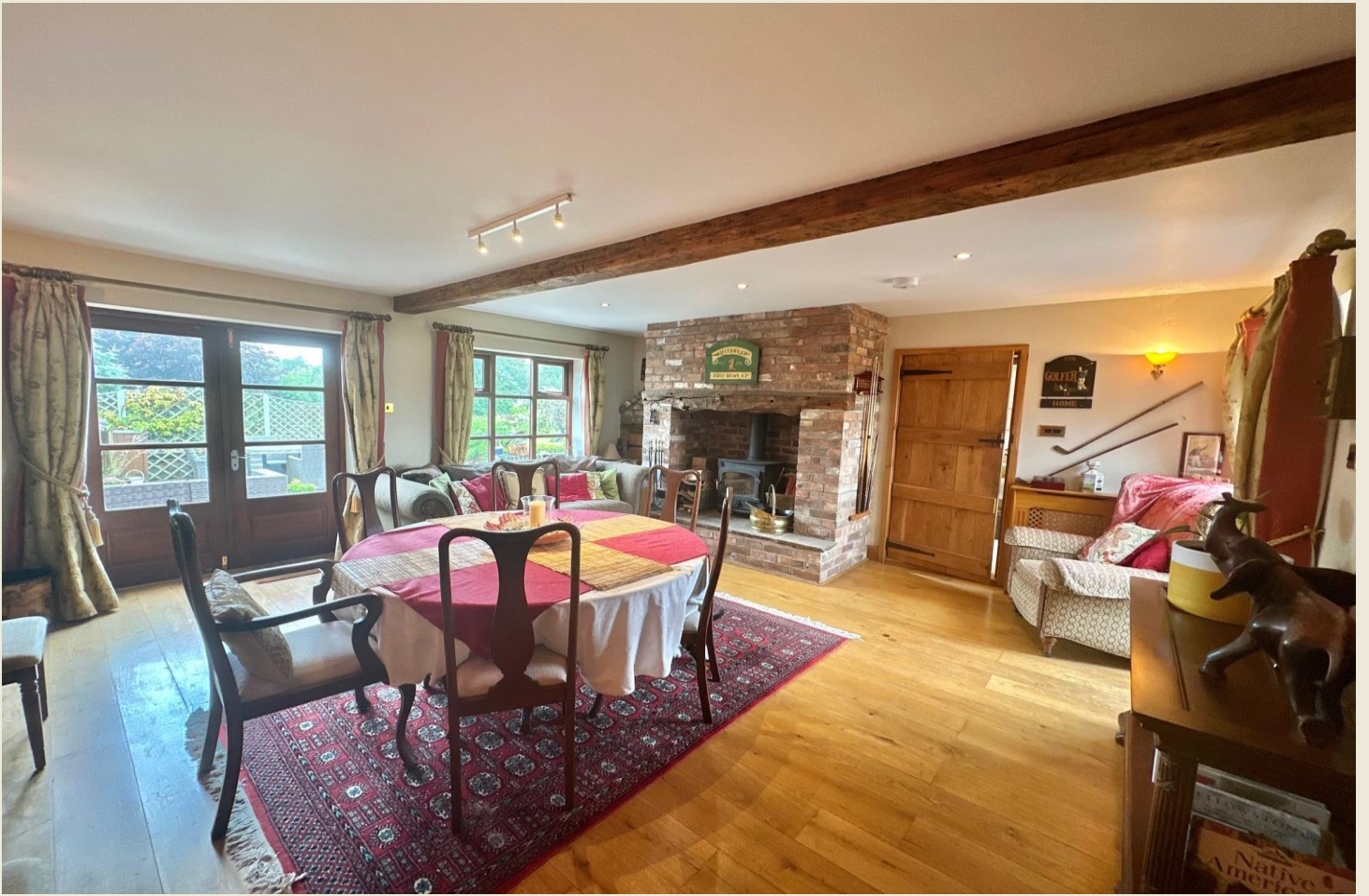
POTENTIAL ANNEXE: LEISURE / FORMAL DINING ROOM