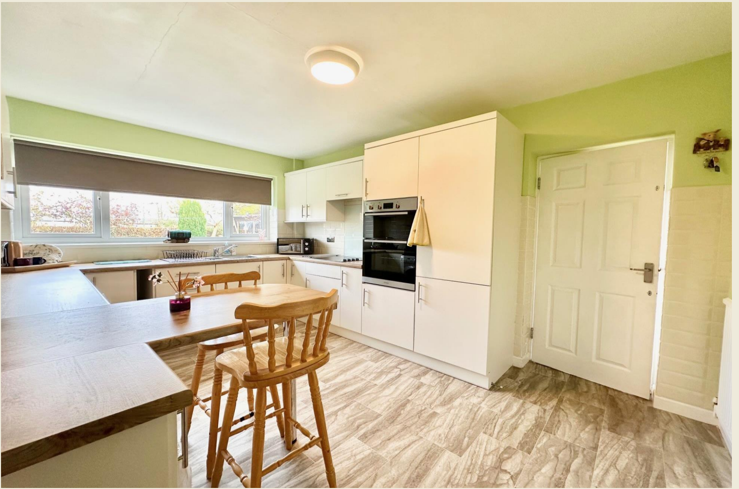
BREAKFAST KITCHEN (13'9 x 9'10)