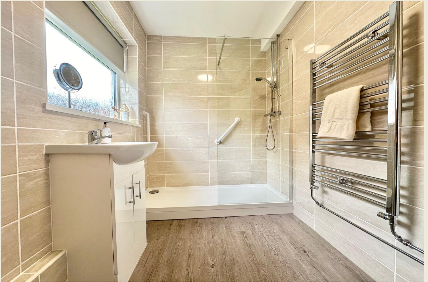
MODERN SHOWER ROOM