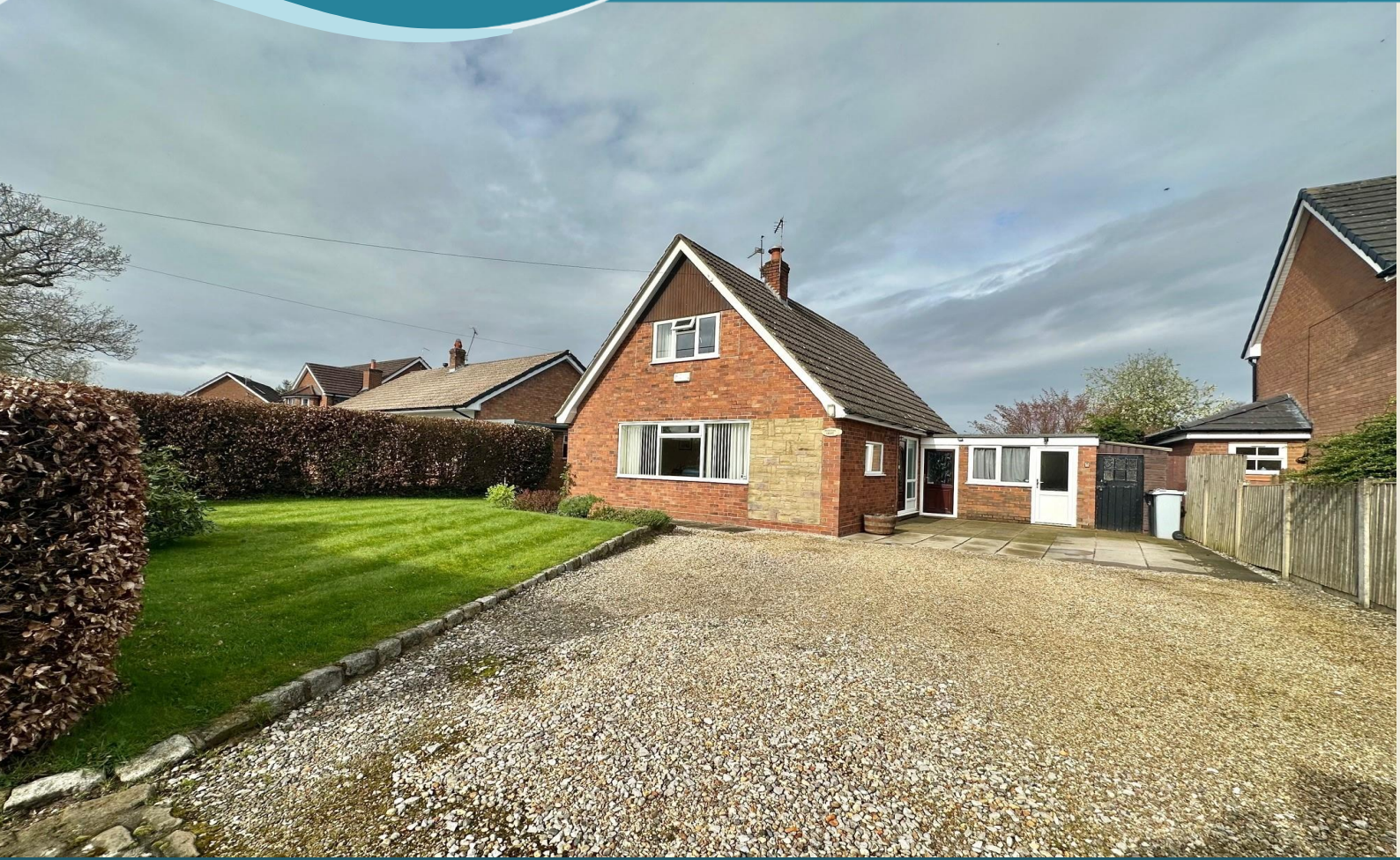
'MORETON CROFT' | SHEPPENHALL LANE | ASTON | NANTWICH | CHESHIRE | CW5 8DE | OIRO £375,000