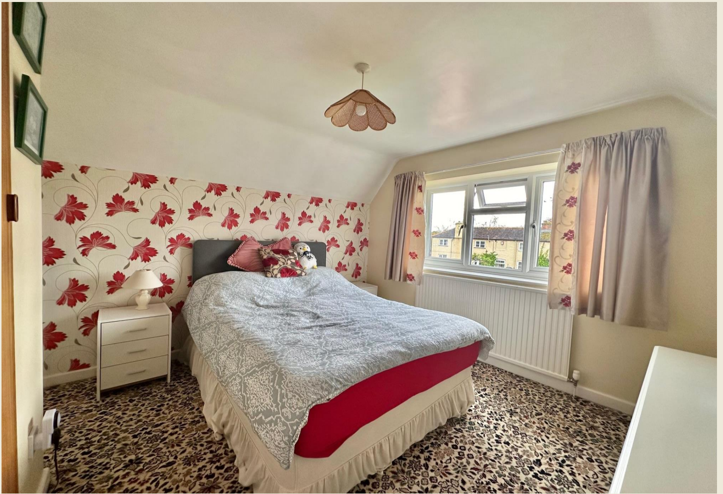
BEDROOM TWO (12'2 max x 10'6)