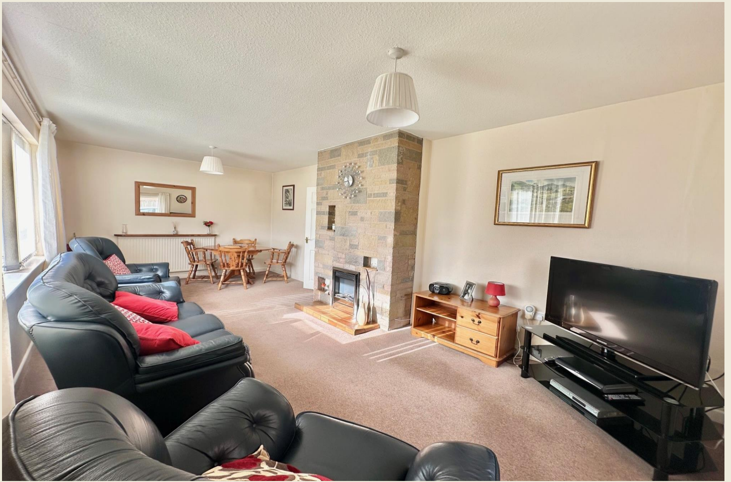
LIVING DINING ROOM (10'10 x 21'4)