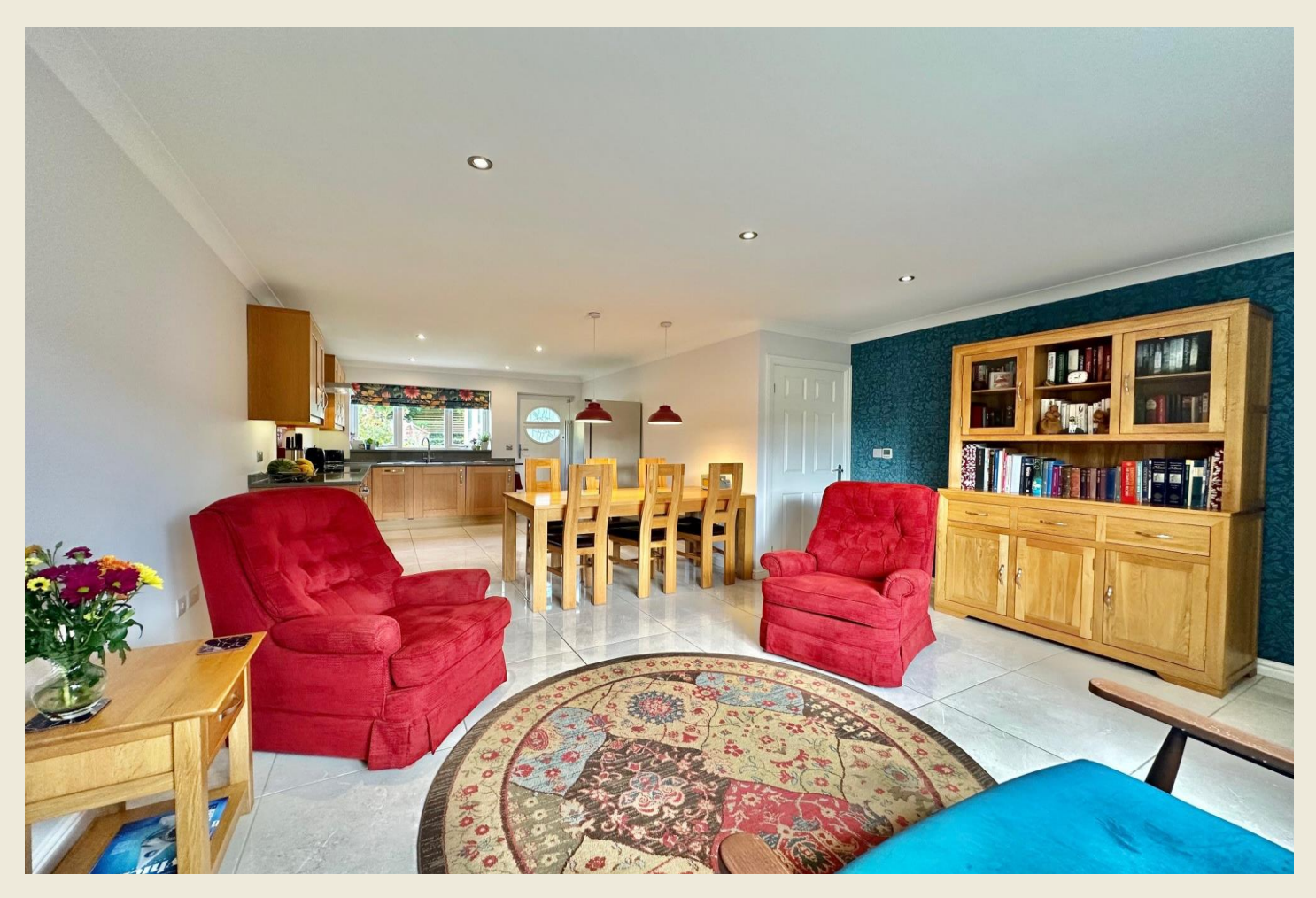
OUTSTANDING OPEN PLAN KITCHEN DINING LIVING ROOM