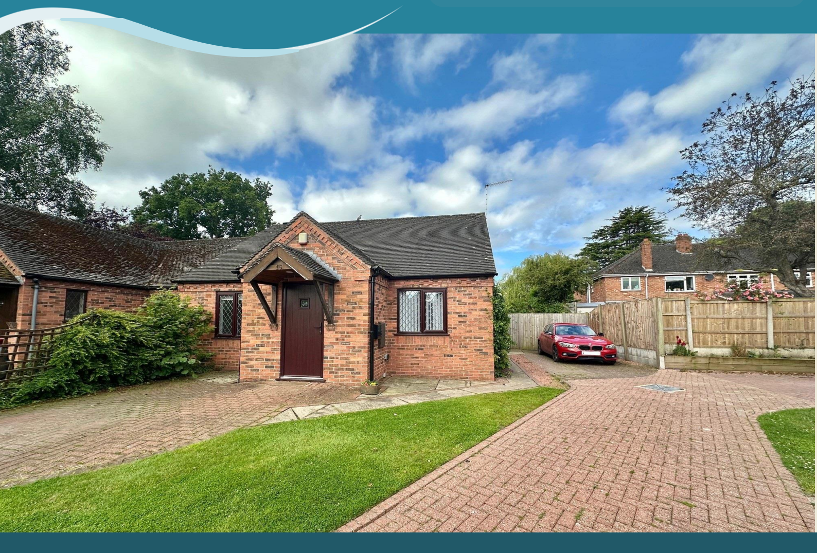
15 CHURCHFIELDS | AUDLEM | CHESHIRE | CW3 0AN | OIRO £315,000