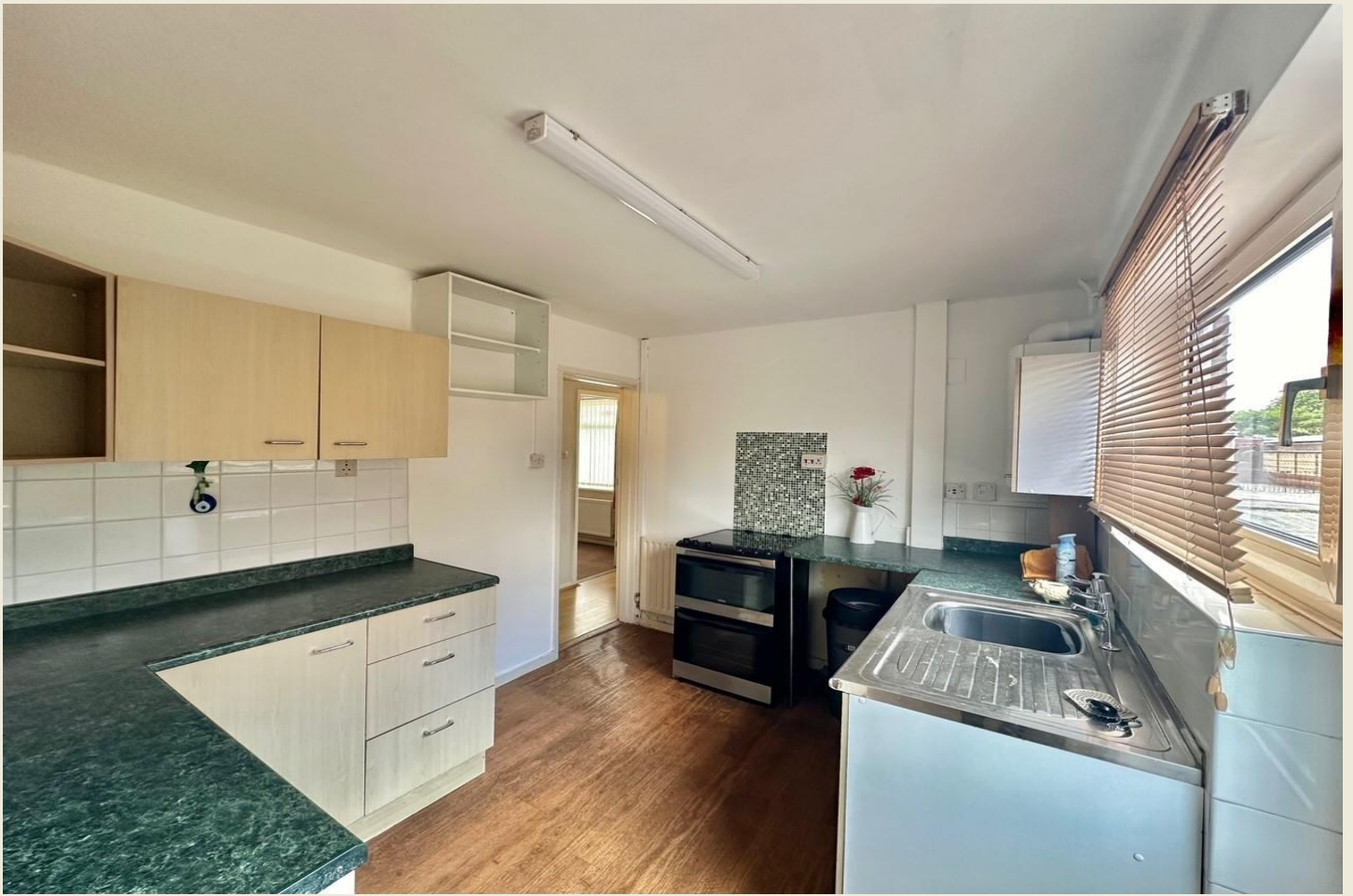
KITCHEN (11'2 x 8'6)