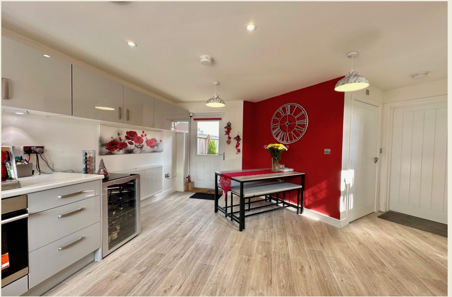
KITCHEN DINER (15'9 overall x 15'4 reducing to 9'7) – irregular shape