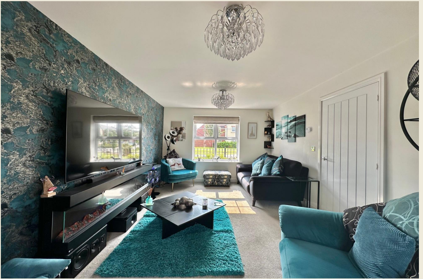
LIVING ROOM (9'9 x 15'10)