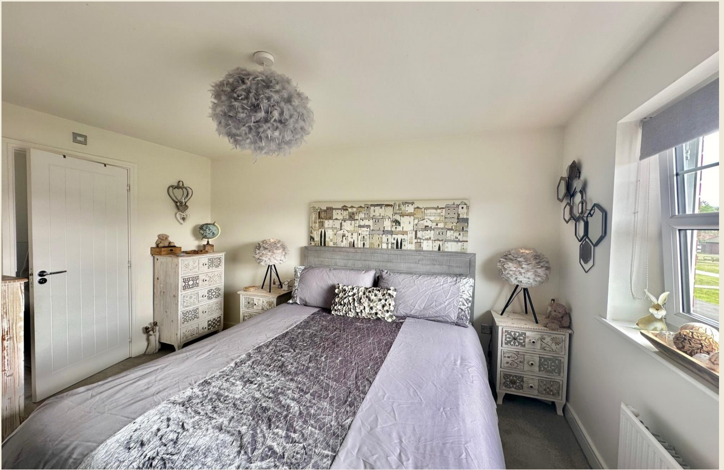
MASTER BEDROOM ONE (11'7 x 9'11)