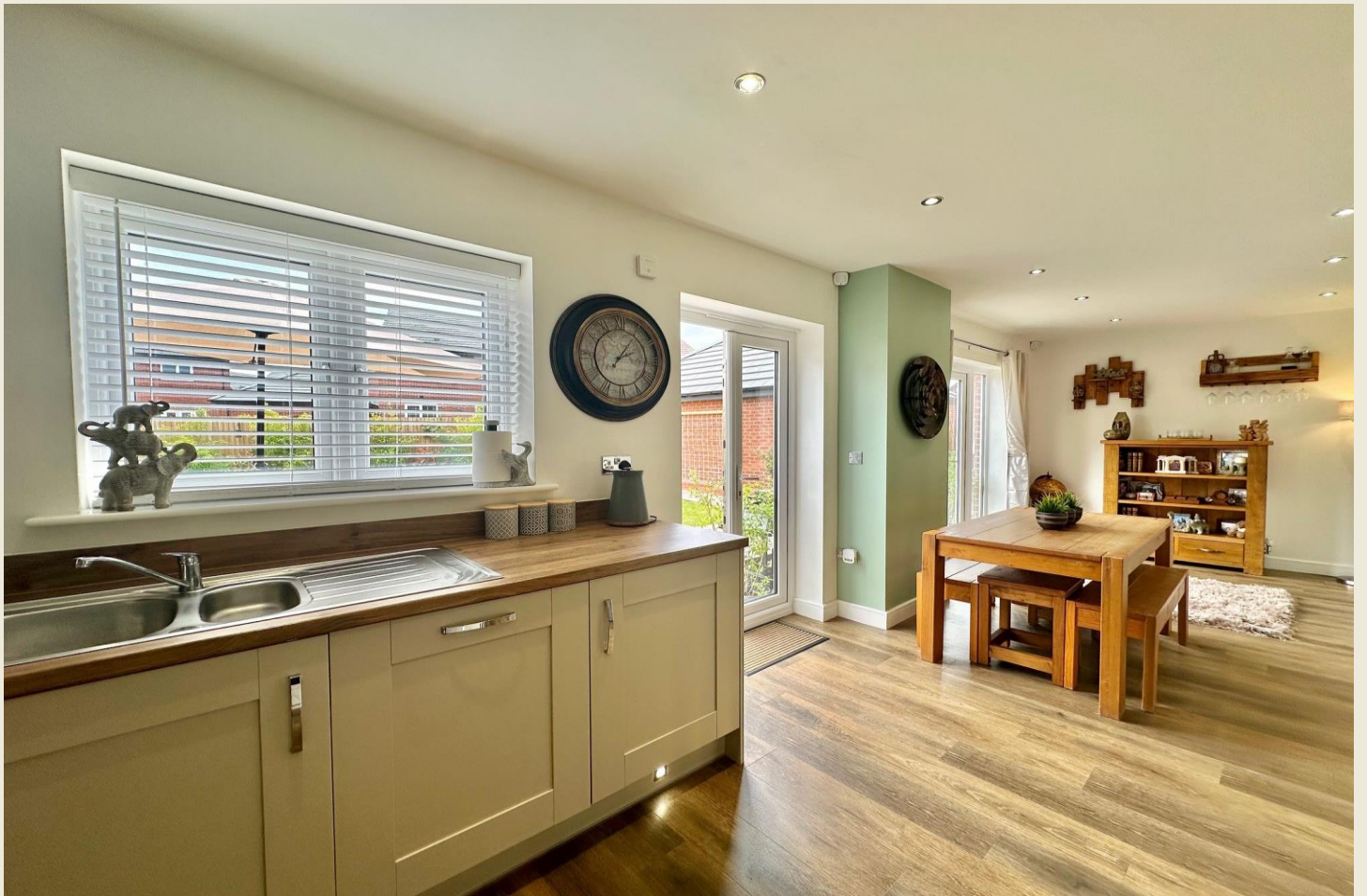
STUNNING KITCHEN DINER