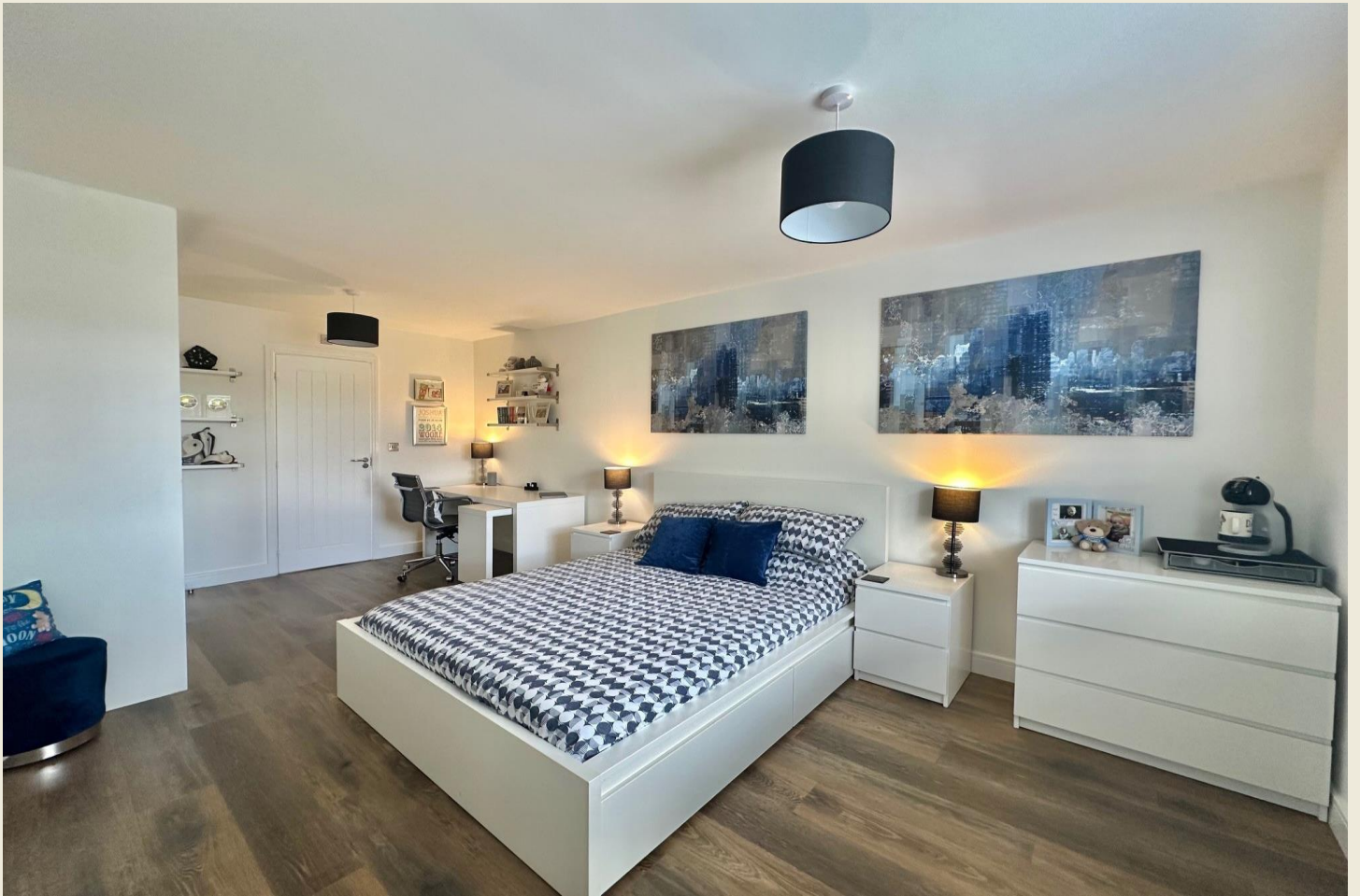
MASTER BEDROOM ONE