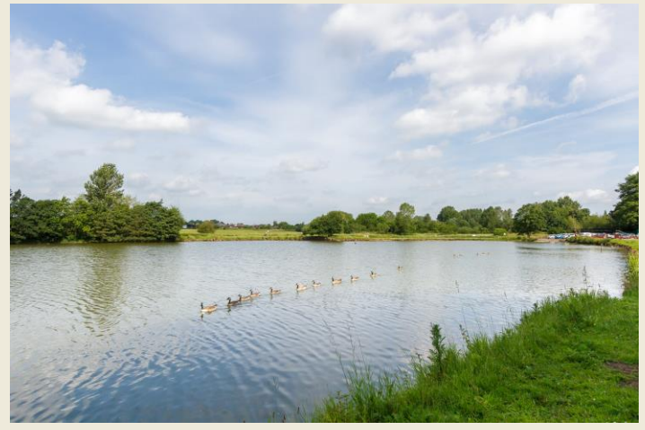
NEARBY BARONY PARK (BELOW)

Nantwich is a charming market town set beside the River Weaver with a rich history, a wide range of speciality shops & 4 supermarkets. Nantwich in Bloom in November 2015 was delighted to have once again scooped the prestigious Gold award from the Britain in Bloom competition. In Cheshire, Nantwich is second only to Chester in its wealth of historic buildings. The High Street has many of the town's finest buildings, including the Queen's Aid House and The Crown Hotel built in 1585. Four major motorways which cross Cheshire ensure fast access to the key commercial centres of Britain and are linked to Nantwich by the A500 Link Road. Manchester Airport, one of Europe's busiest and fastest developing, is within a 45 minute drive of Nantwich. Frequent trains from Crewe railway station link Cheshire to London-Euston in only I hr 30mins. Manchester and Liverpool offer alternative big city entertainment. Internationally famous football teams, theatres and concert halls are just some of the many attractions.