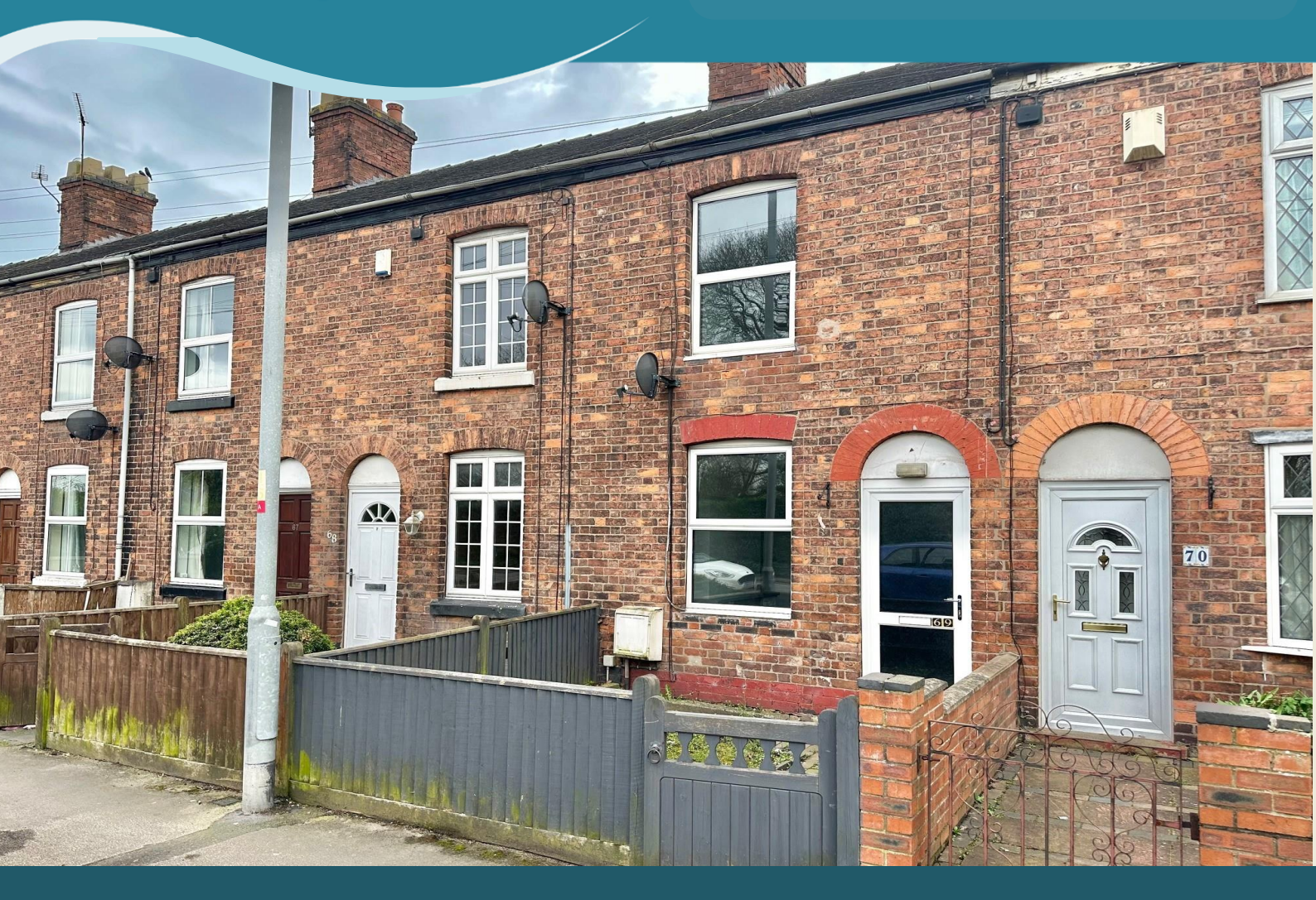
69 BARONY ROAD | NANTWICH | CHESHIRE | CW5 5QP | OIRO £189,000