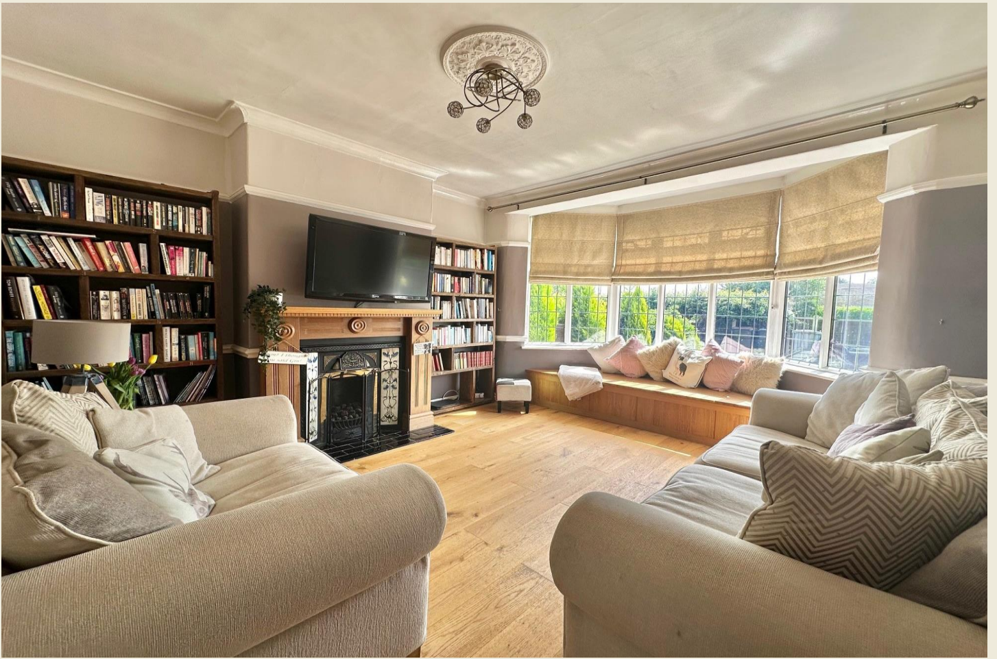
LIVING ROOM (12'6 x 11'10 max)