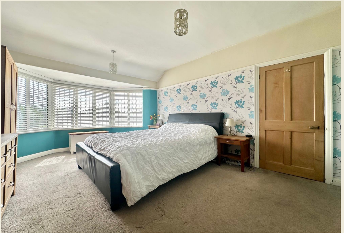
BEDROOM ONE (16'5 max x 12'6)