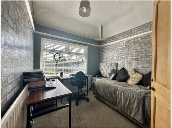
BEDROOM FOUR (8'6 x 8'6)