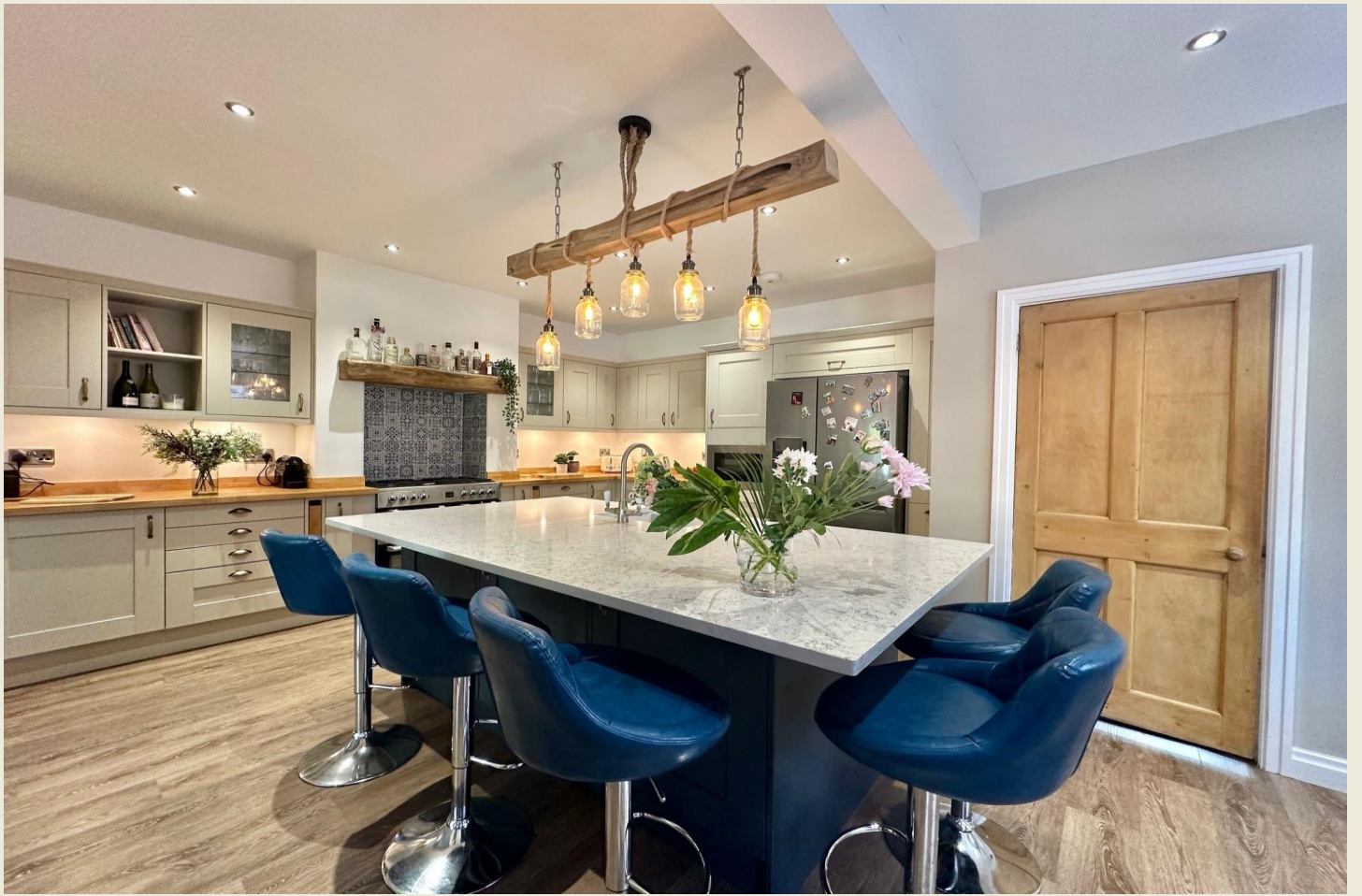
MAGNIFICENT KITCHEN DINING FAMILY ROOM (21'4 x 18'8)