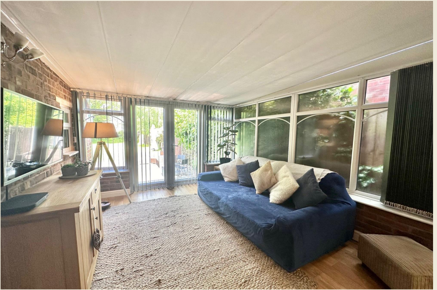
CONSERVATORY (11'2 x 10'2)