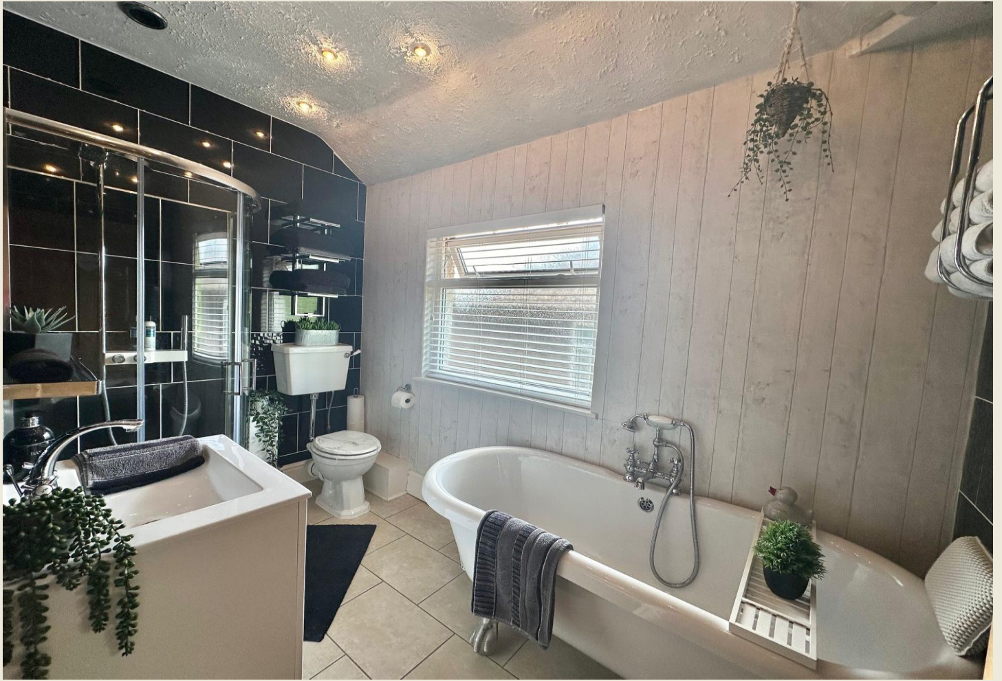
FAMILY BATH & SHOWER ROOM