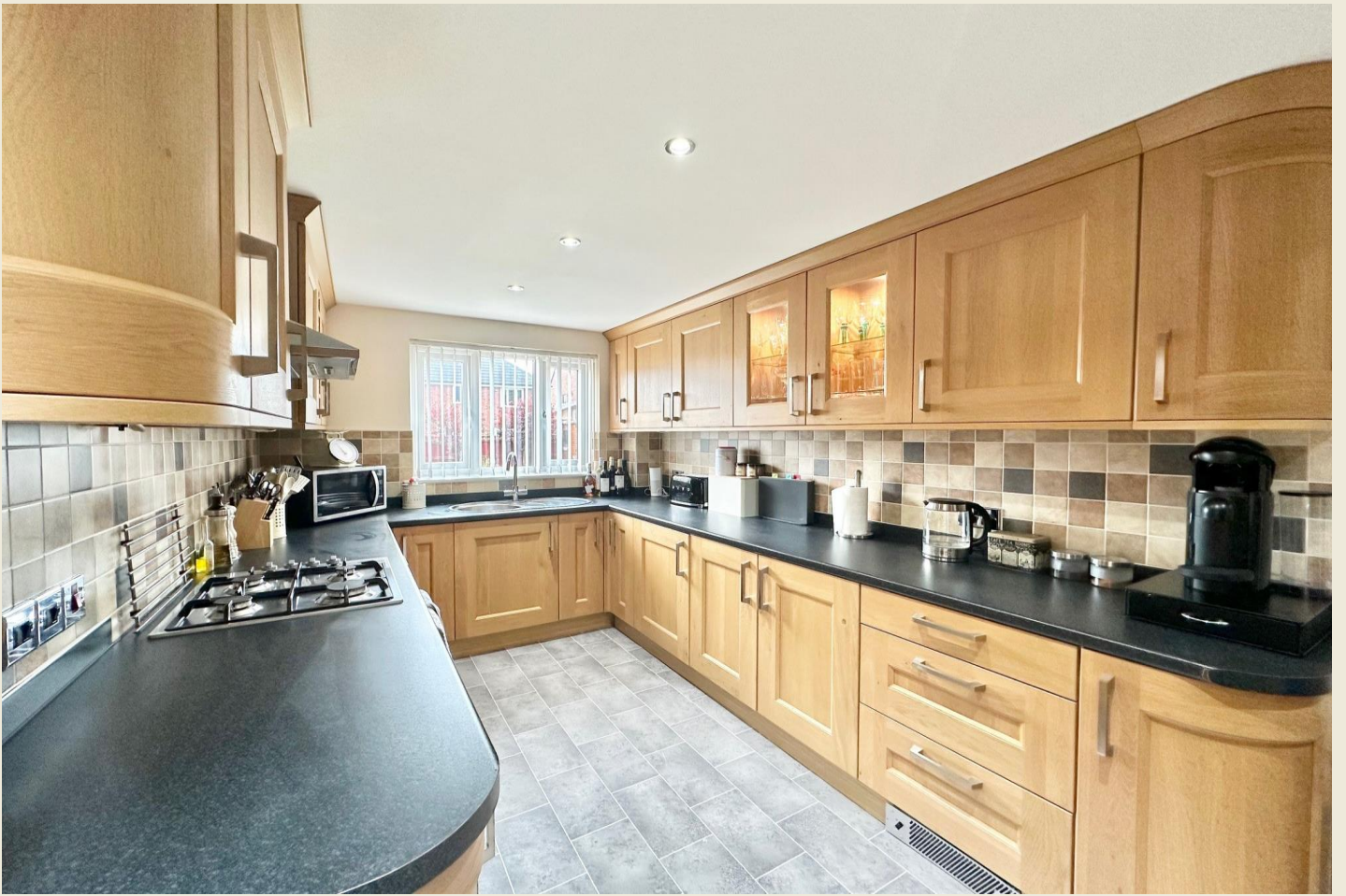
KITCHEN (15'11 x 8'2)