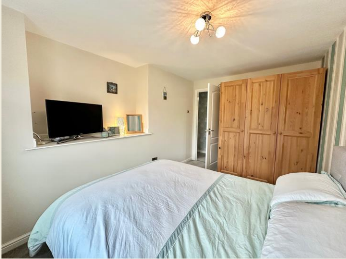
BEDROOM THREE (13'6 x 8'2)