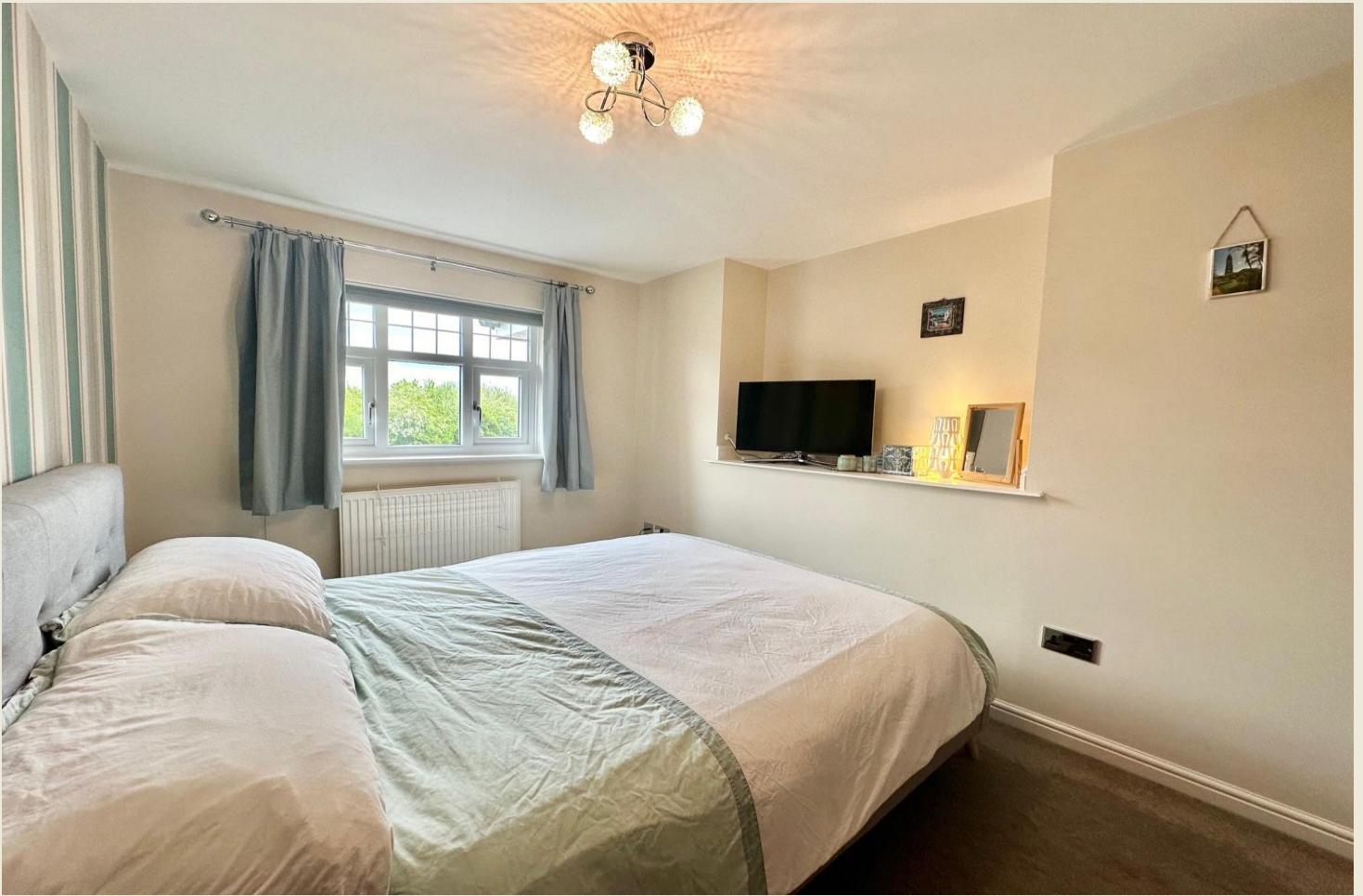
BEDROOM TWO (12'4 x 10'4)