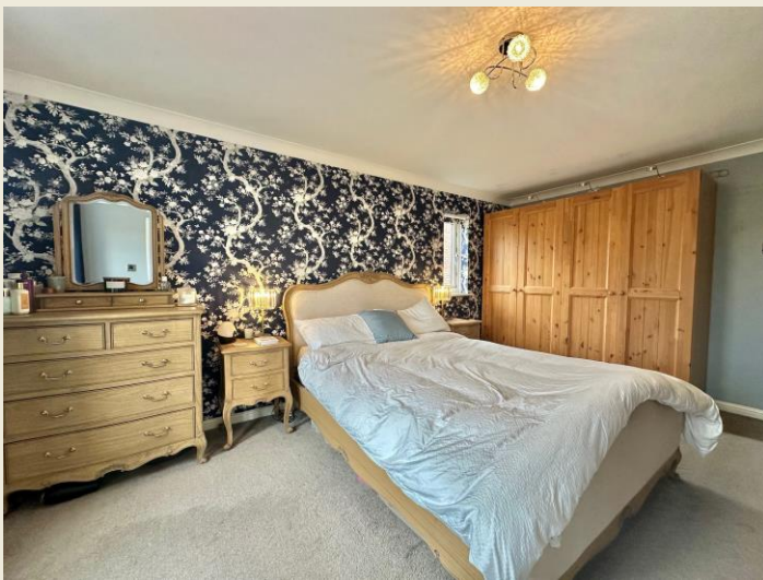
MASTER BEDROOM ONE (16'6 x 11'4 max)