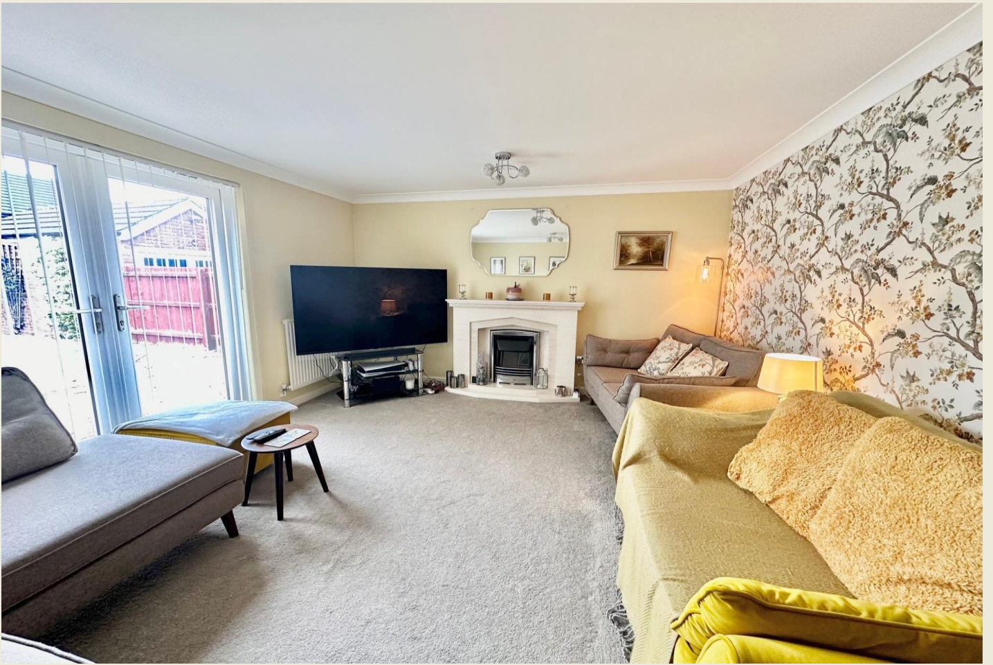
LIVING ROOM (12'4 x 14'8)