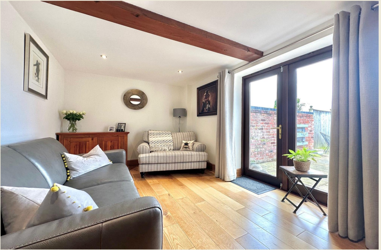
SITTING ROOM / BEDROOM FOUR (13'1 x 8'2)