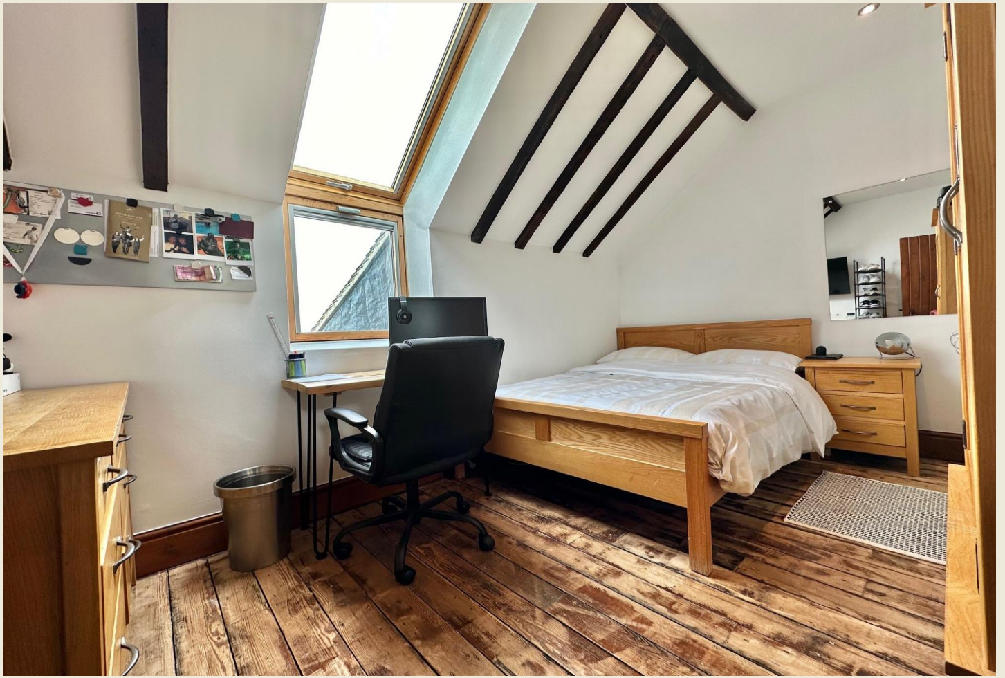
BEDROOM TWO (12'10 x 8'2 max)