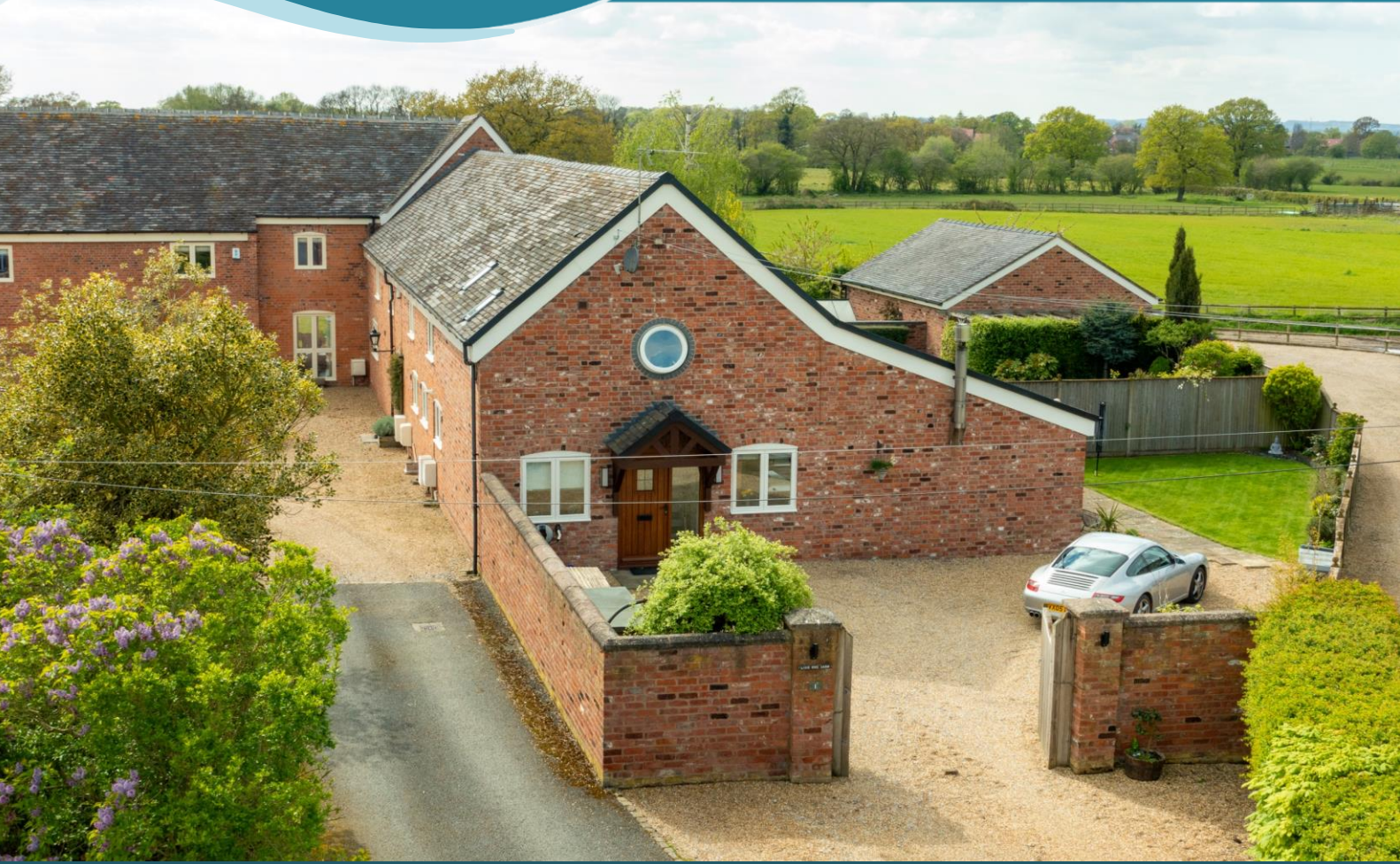
'LANE END BARN' | 1 BROUGHTON FARM, 86 ROPE LANE | WISTASTON | CHESHIRE | CW2 6RQ | OFFERS OVER £525,000