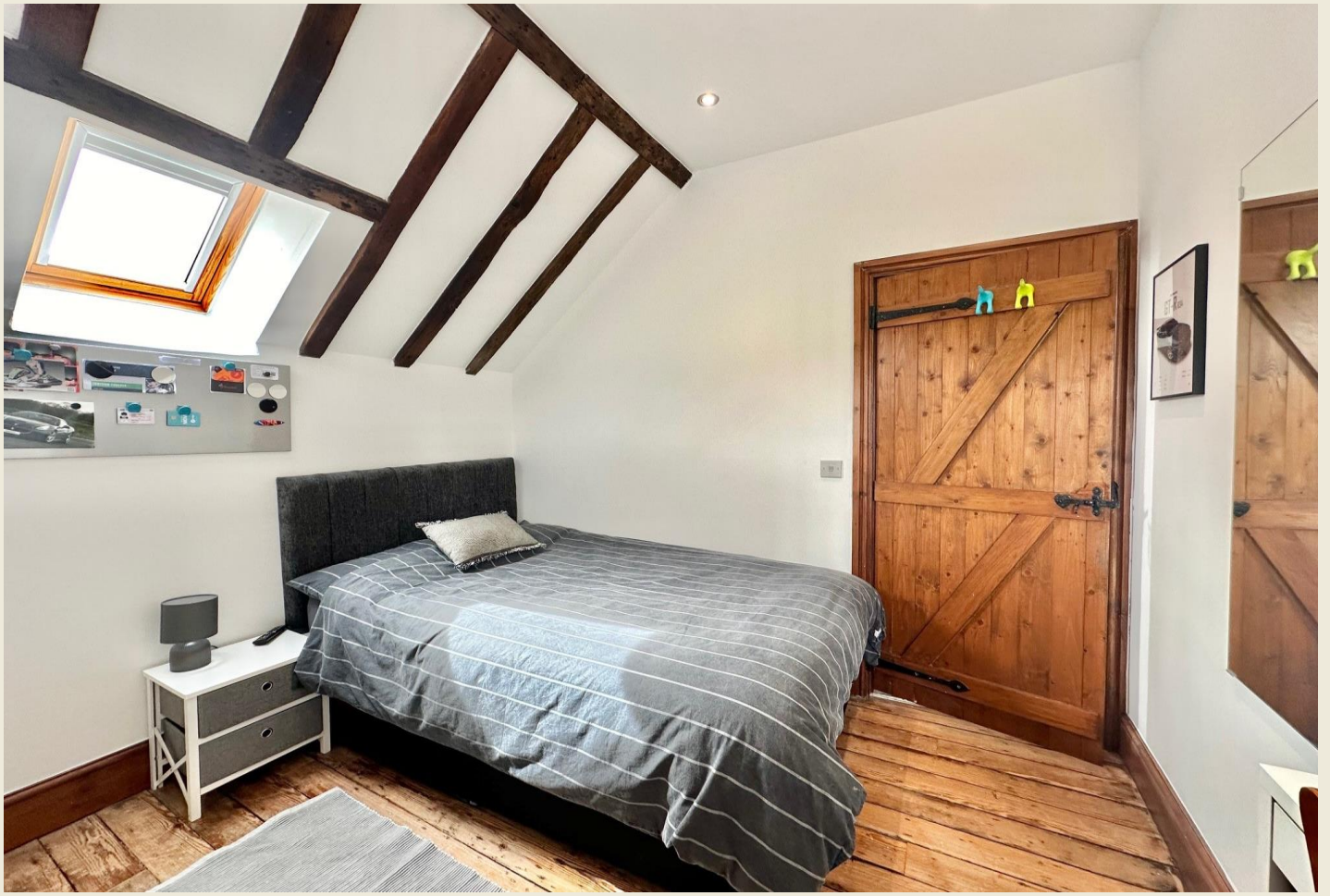
BEDROOM THREE (10'5 max x 9'6)