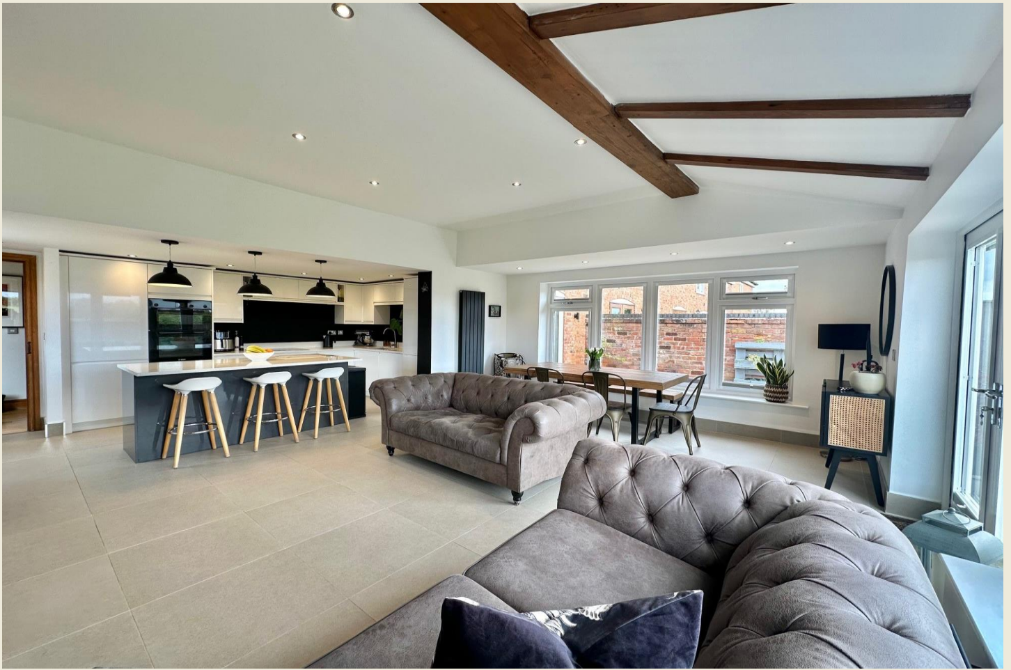
OPEN PLAN KITCHEN DINING FAMILY ROOM (22'11" x 19'1")