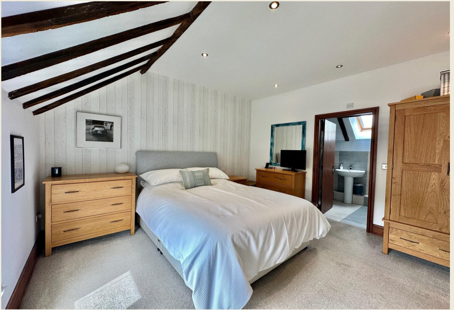
MASTER BEDROOM ONE (13'5 x 12'2)