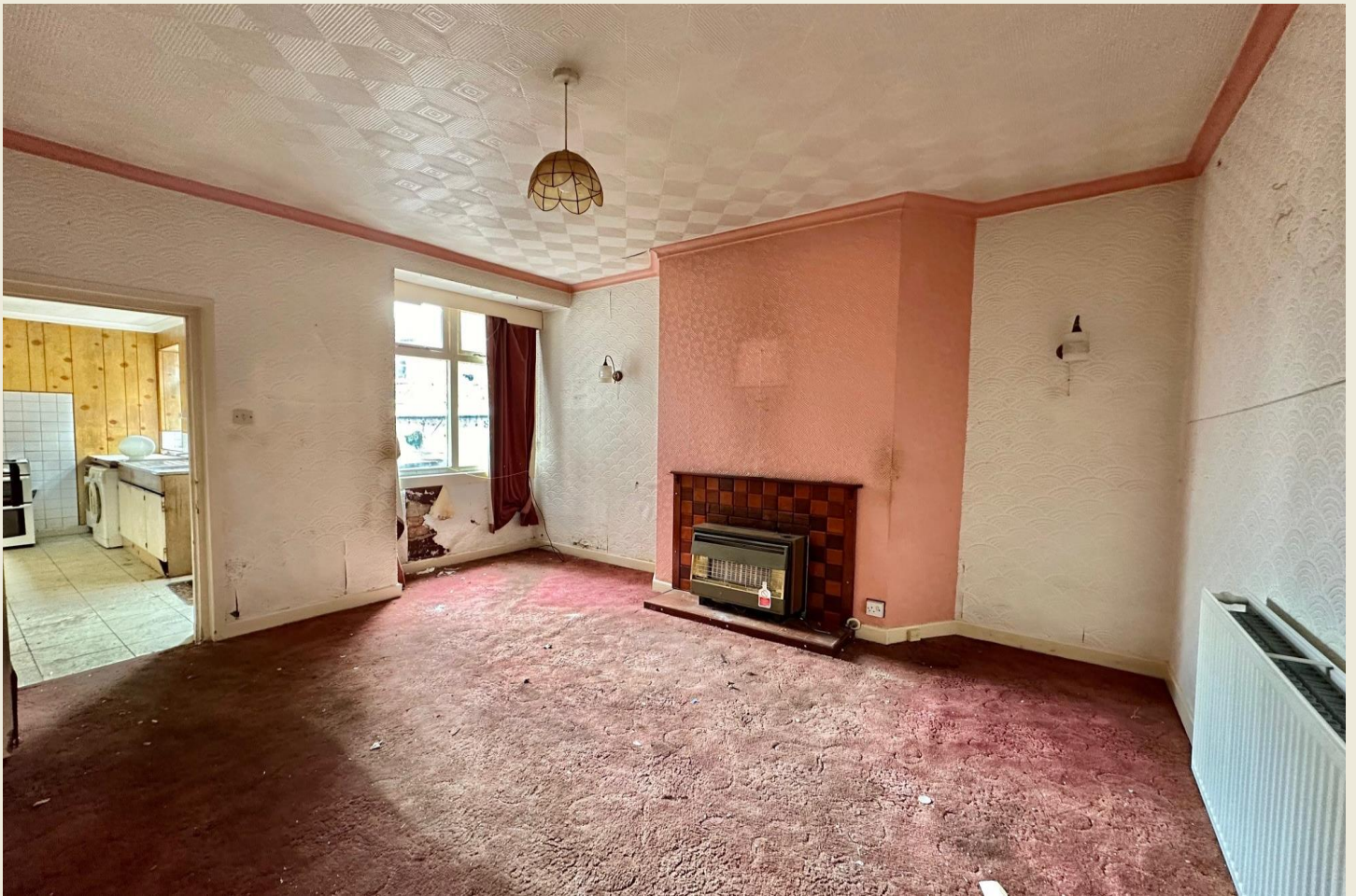
DINING ROOM (13'5 max x 11'2)