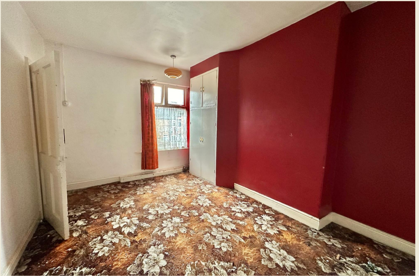
BEDROOM TWO (13'5 x 9'2)