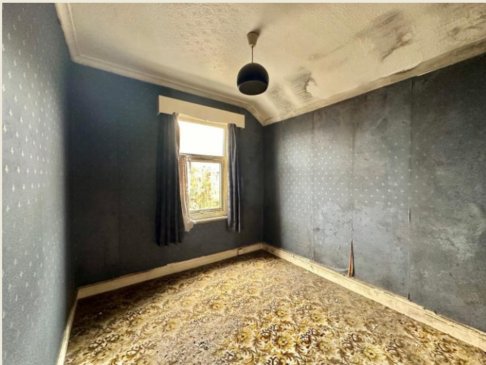
BEDROOM THREE (10'8 x 8'2)