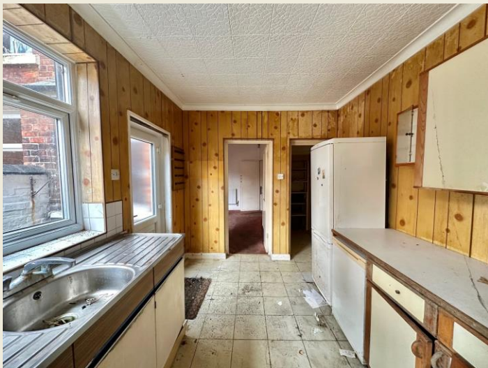
KITCHEN (14'5 x 8'2)