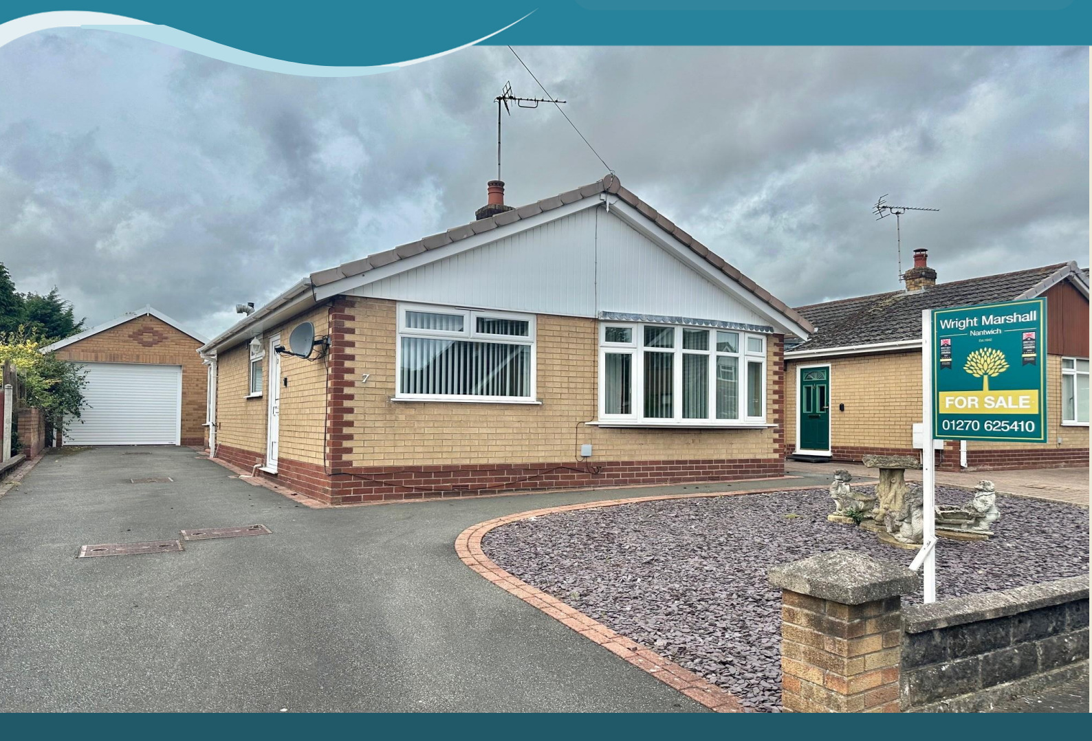
7 GODWIN CRESCENT | SHAVINGTON | NEAR NANTWICH | CHESHIRE | CW2 5EN | OIRO £285,000