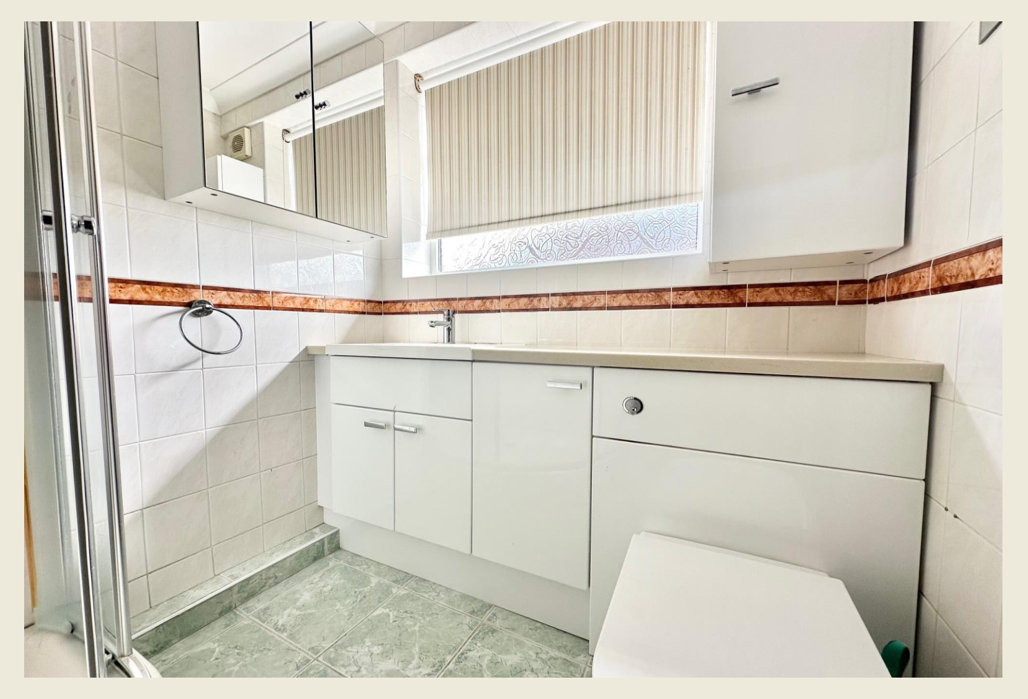
SHOWER ROOM (6'3 x 5'7)