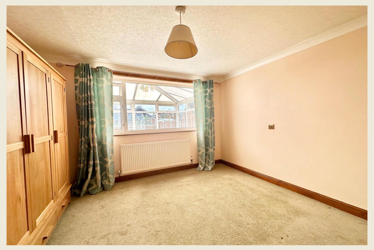
BEDROOM ONE (11'10 max x 10'10)