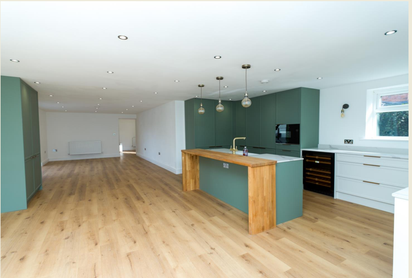
EXPANSIVE OPEN PLAN KITCHEN DINING FAMILY ROOM (34'1 x 18'8 max)