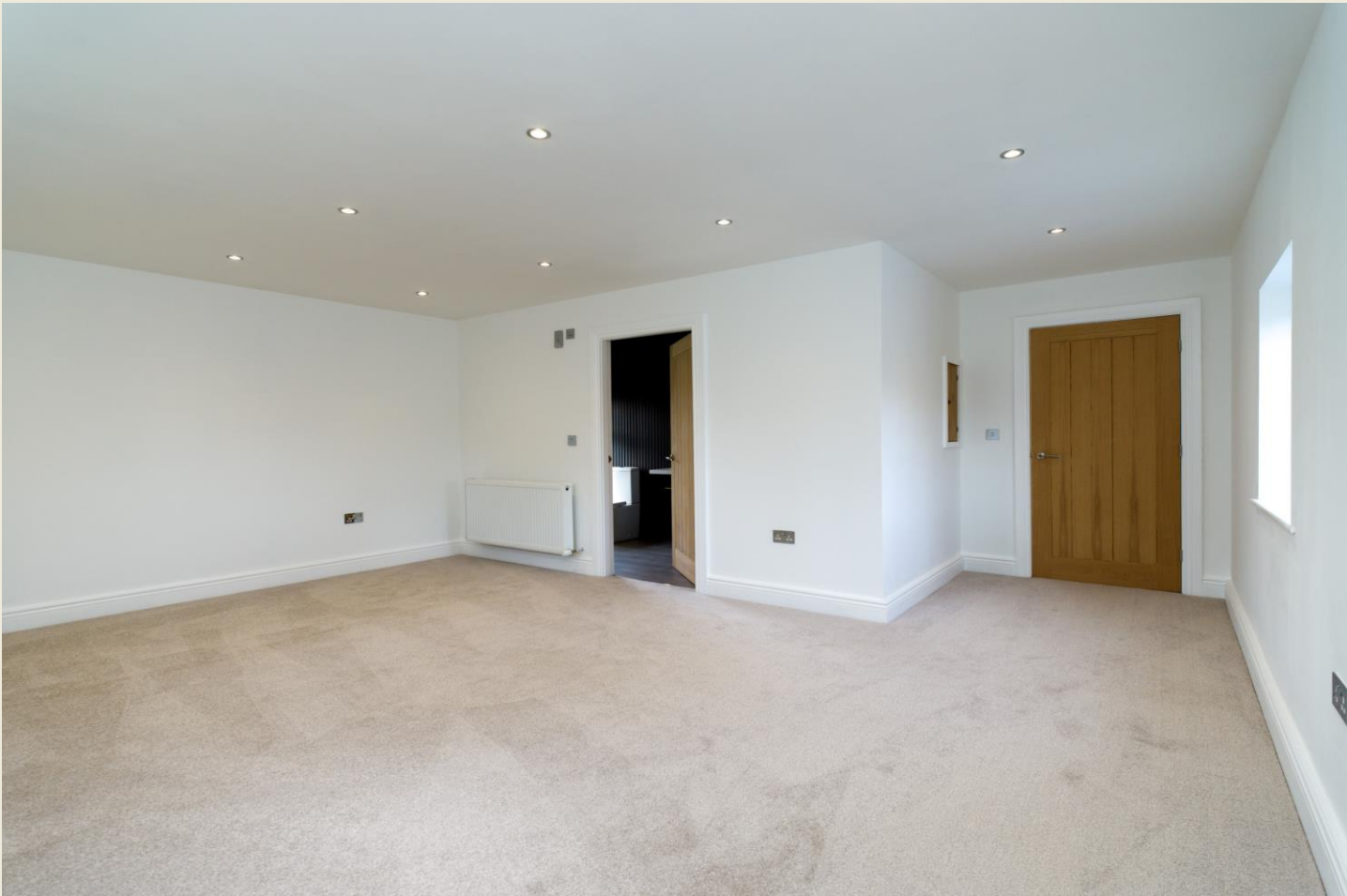
MASTER BEDROOM ONE (17'9 x 13'1)