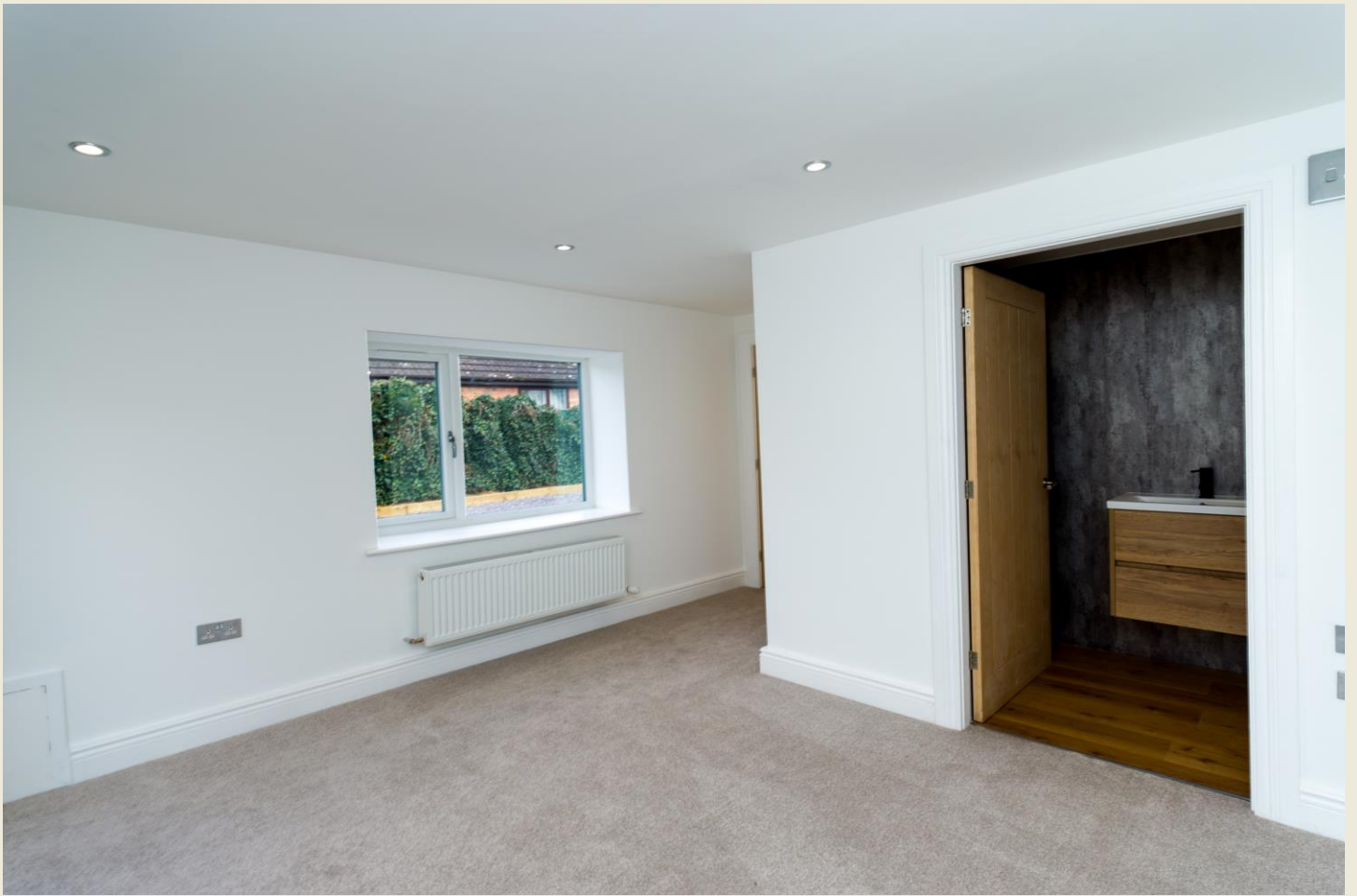
BEDROOM FIVE (OFFICE/HOBBY ROOM) (13'5 x 12'2)