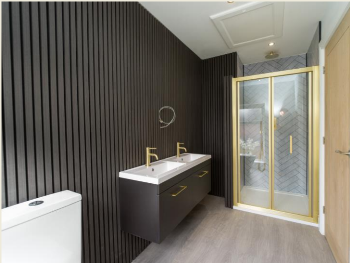
'BOUTIQUE HOTEL STYLE' ENSUITE SHOWER ROOM (12'2 x 5'3)