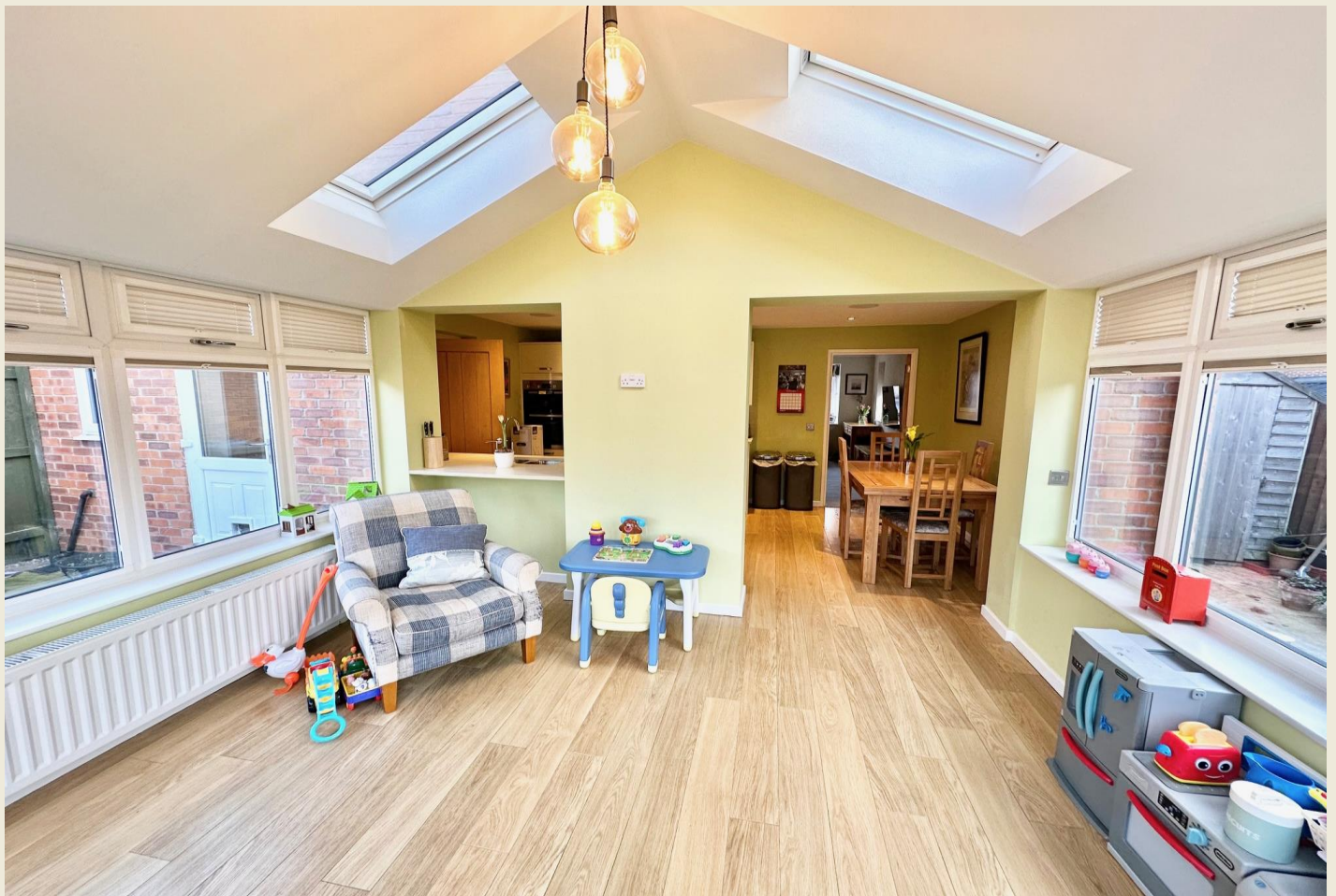
GARDEN / FAMILY ROOM (12'3 max x 11'1)