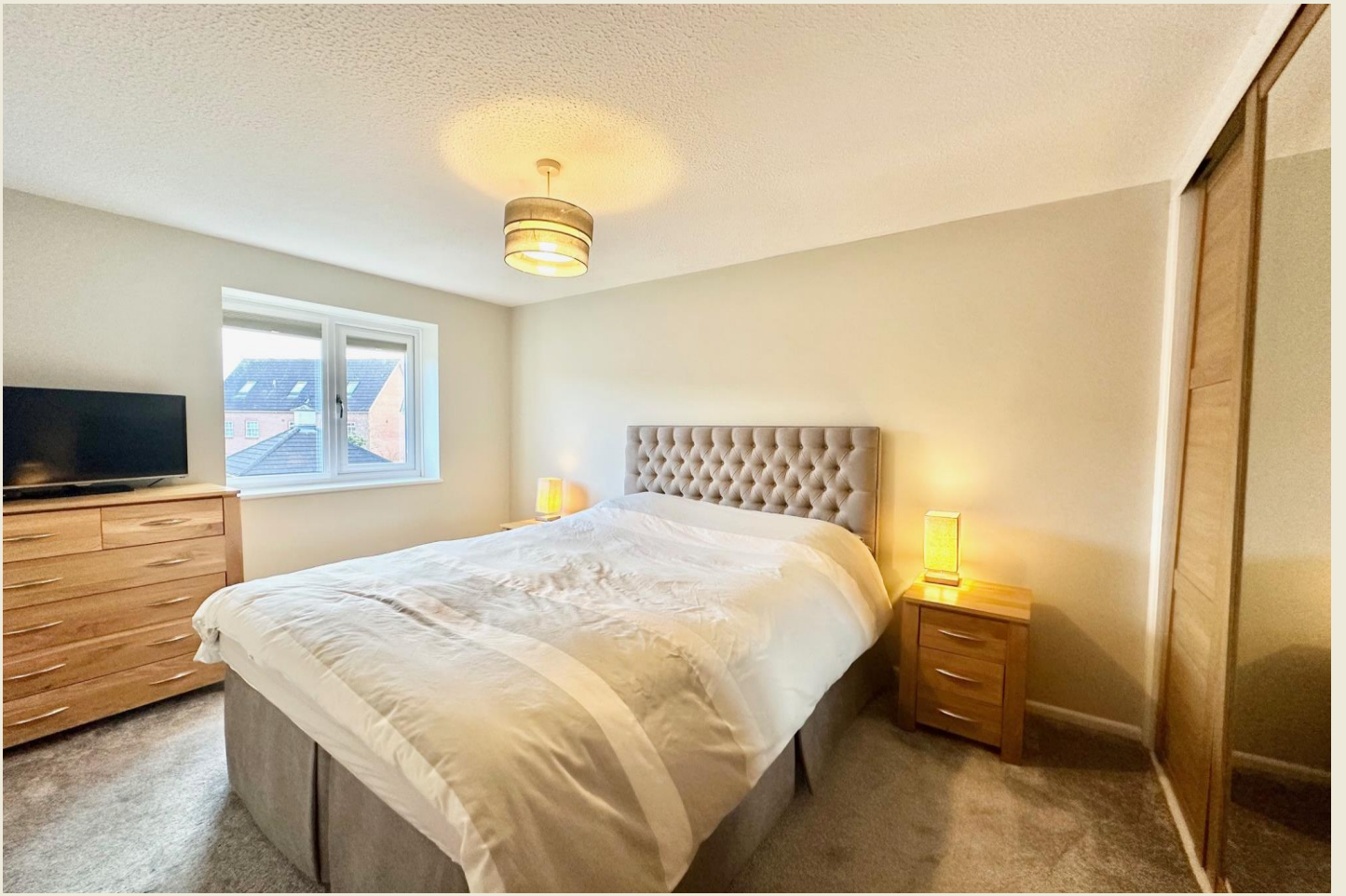
BEDROOM ONE (12'10 max to front of wardrobe) x 8'10 max